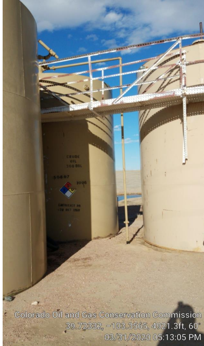
Colorado Oil and Gas Conservation Commission 39.72332, -103.3565, 4921.3ft, 60° 03/31/2020 05:13:05 PM