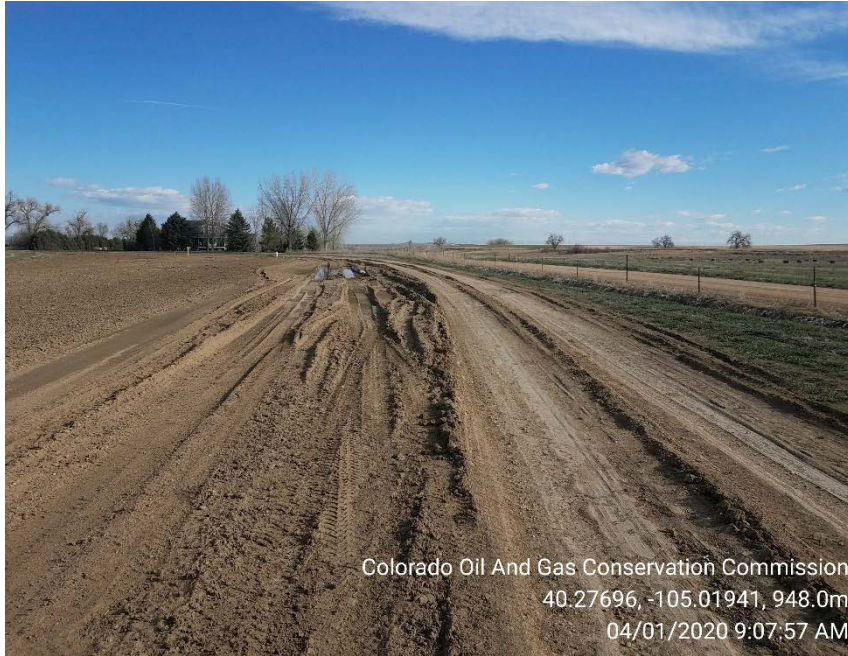
Lease road damage