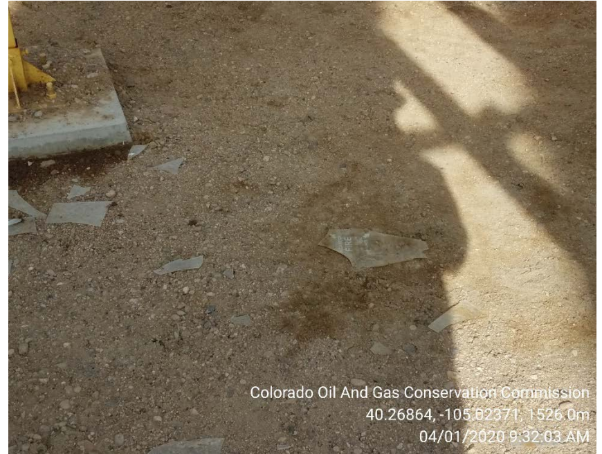
ECD unit and crude oil

Colorado Oil And Gas Conservation Commission 40.26864, -105.02371, 1526.0m 04/01/2020 9:32:03 AM