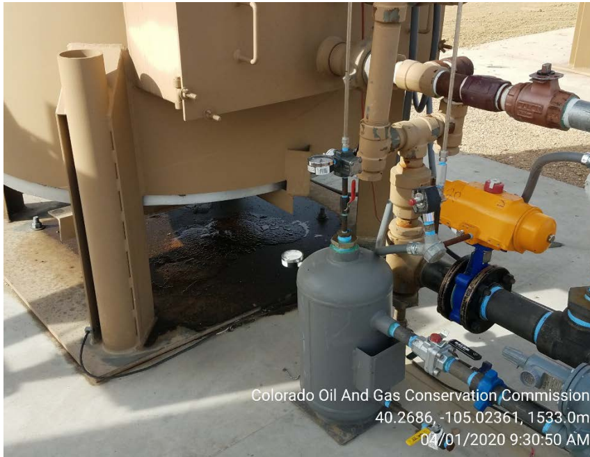
ECD unit and crude oil