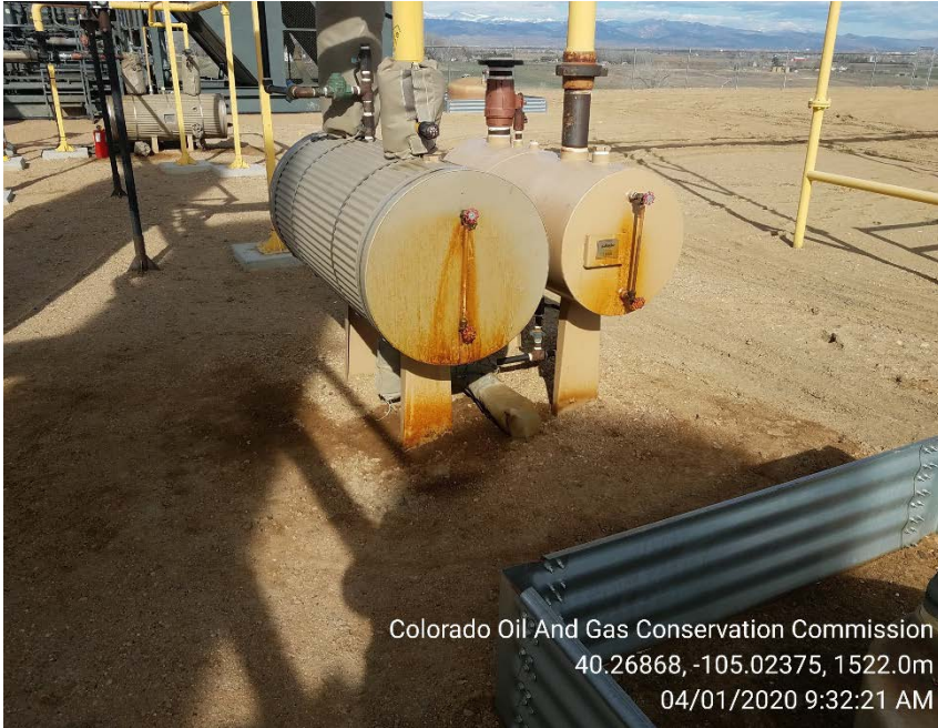
Colorado Oil And Gas Conservation Commission 40.26868, -105.02375, 1522.0m 04/01/2020 9:32:21 AM