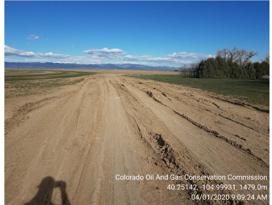
Lease road damage