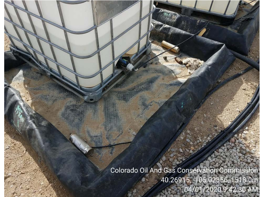
Chemical storage and trash

Colorado Oil And Gas Conservation Commission 40.26915, -105.02356, 1518.0m 04/01/2020 9:42:30 AM