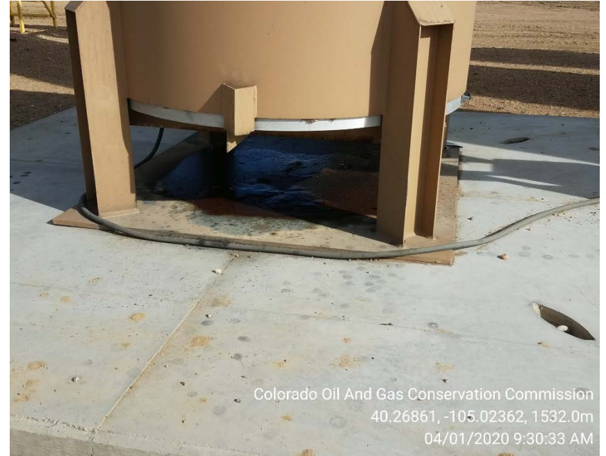
ECD unit and crude oil