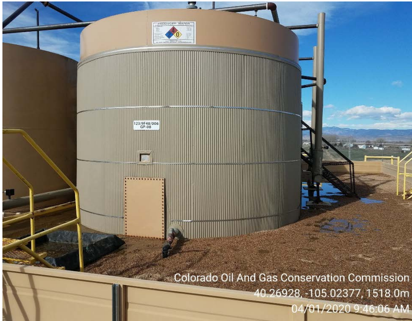
Produced water tank placards