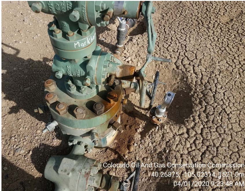
Master valve leak