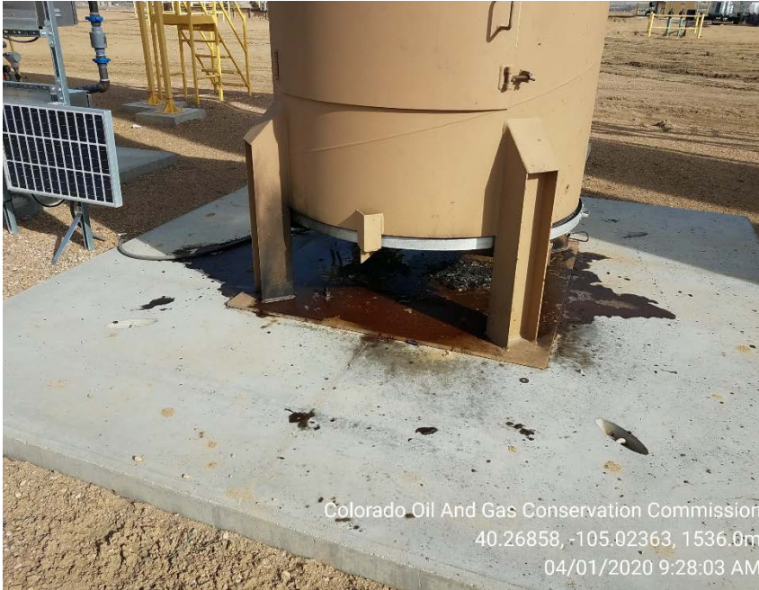
ECD unit and crude oil