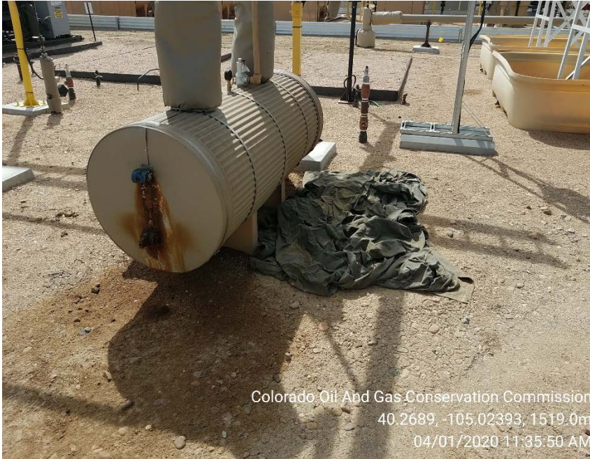
Trash and stained soil