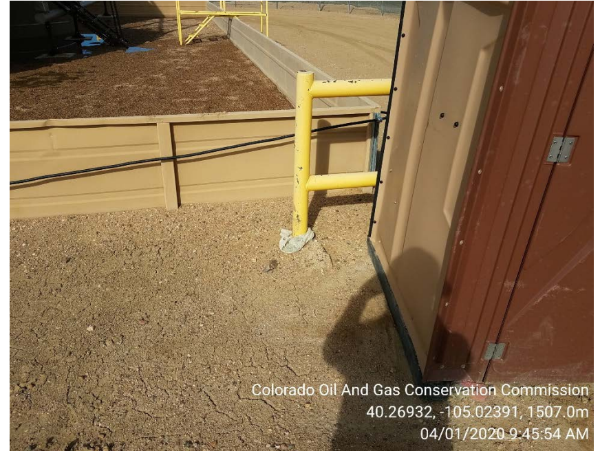
Trash and stained soil

Colorado Oil And Gas Conservation Commission 40.26932, -105.02391, 1507.0m 04/01/2020 9:45:54 AM