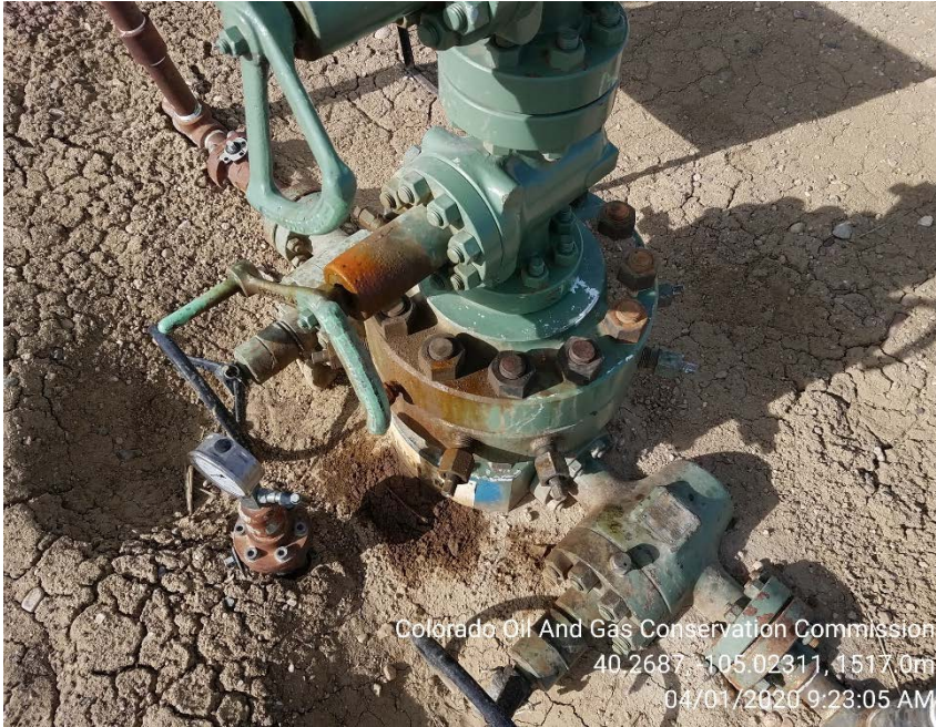
Master valve leak