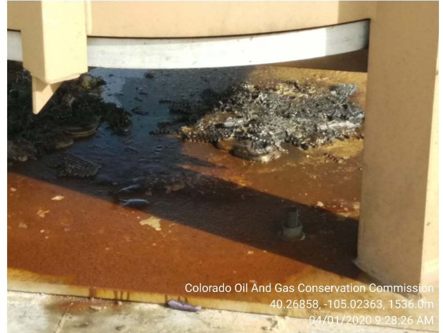
ECD unit, crude oil and flame arrester