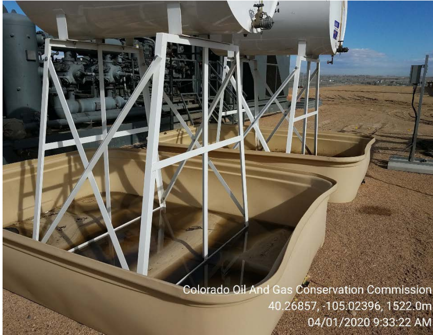
Lube oil storage