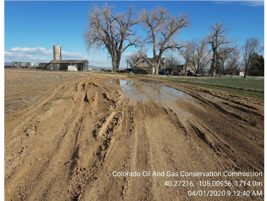
Lease road damage