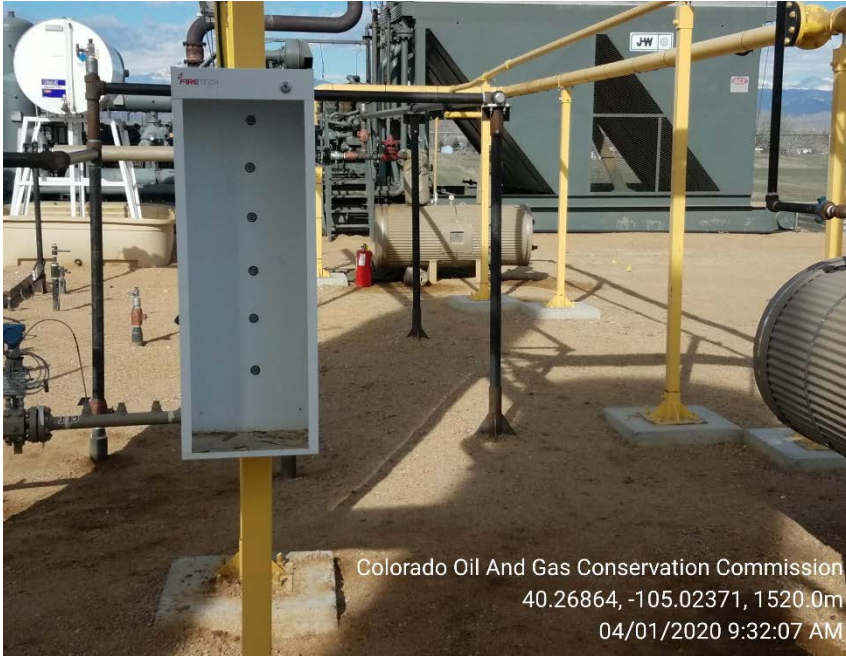
Fire extinguisher rack