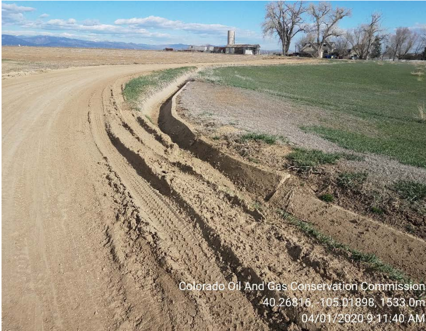
Lease road damage