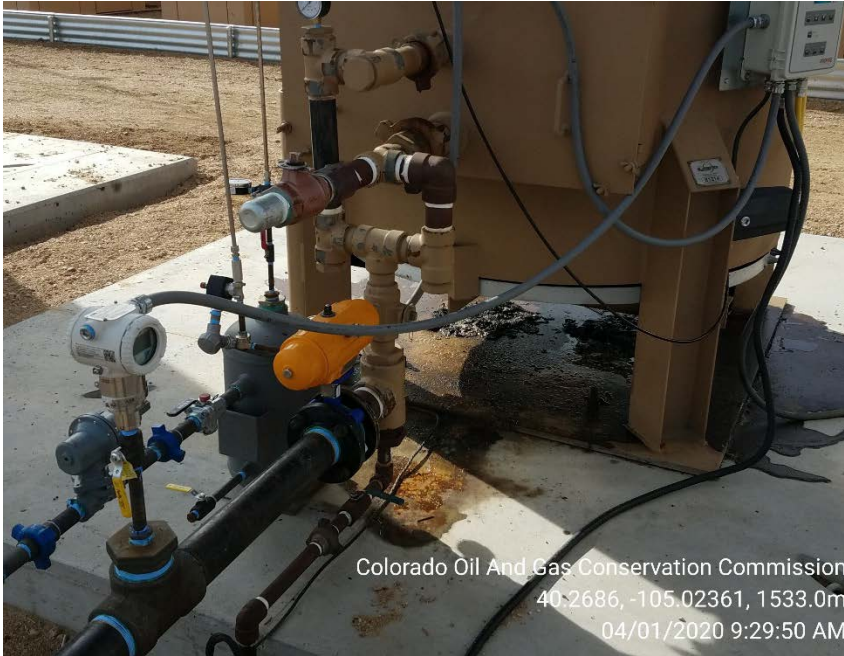
ECD unit and crude oil