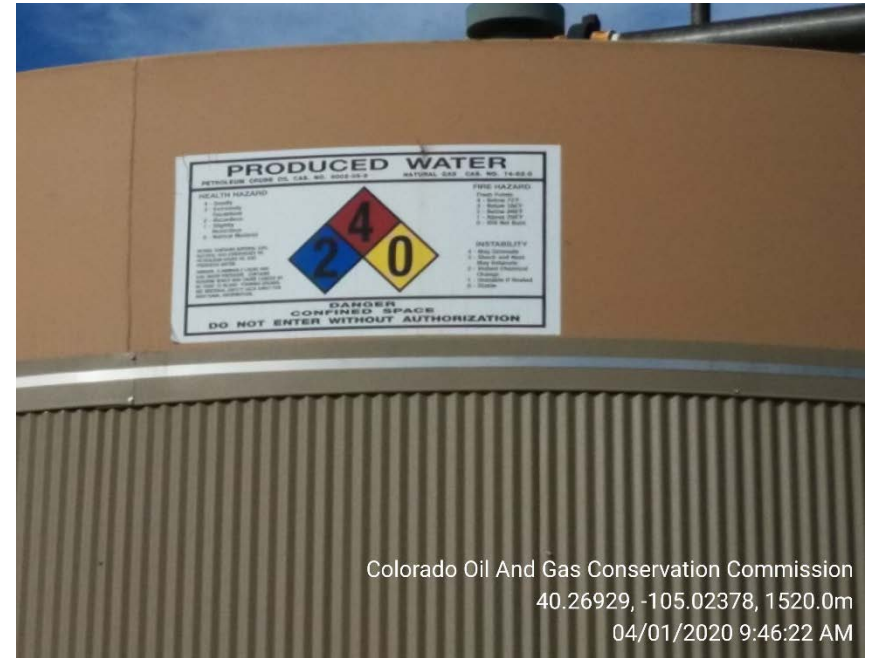
Produced water tank placards