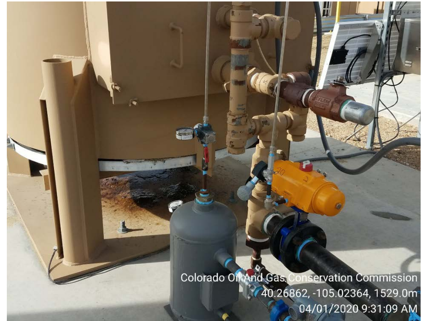
ECD unit and crude oil