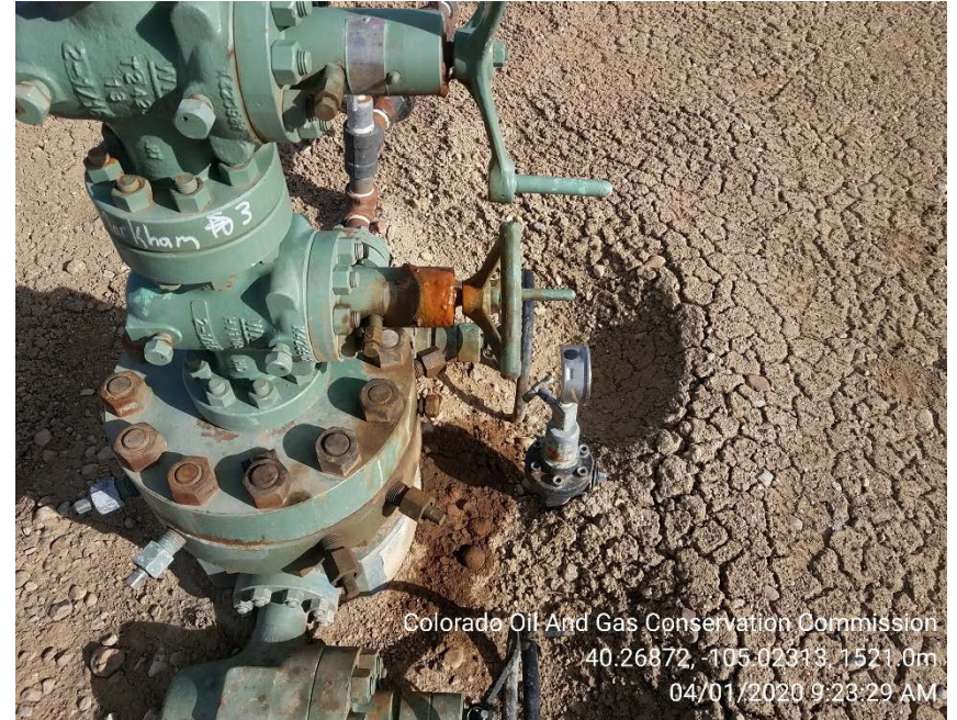
Master valve leak