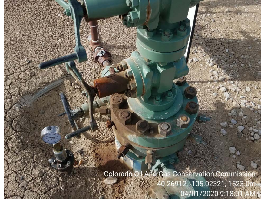
Master valve leak