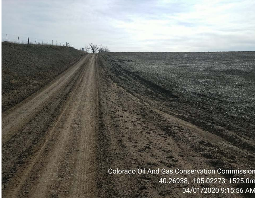
Lease road damage