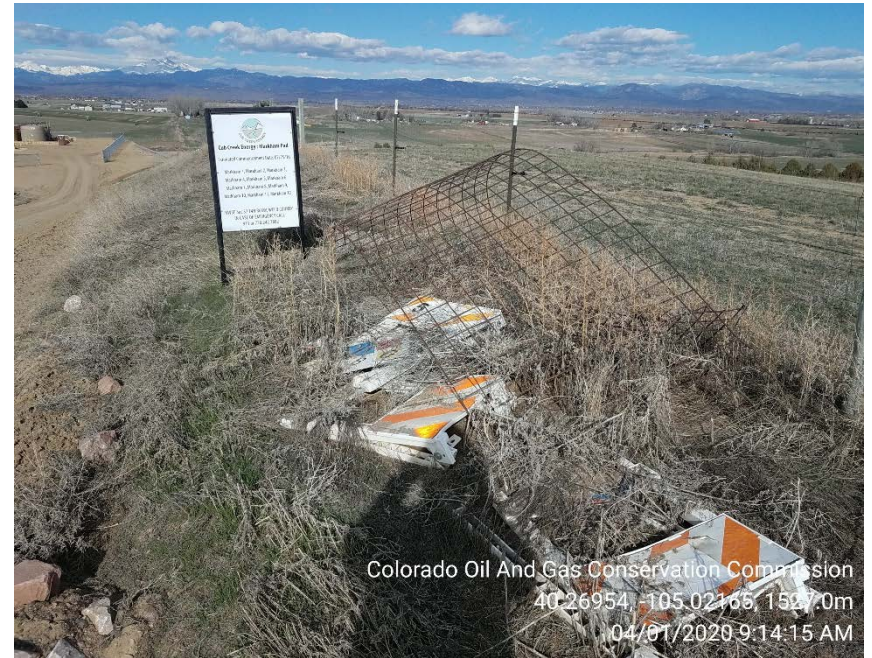
Lease road sign and trash