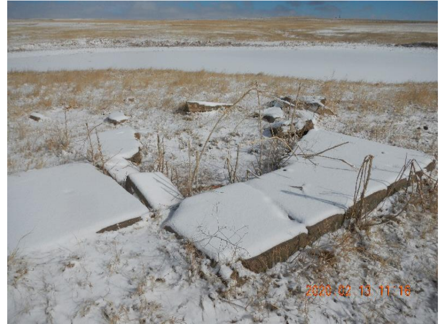
Photo 2: Closer view of broken cement slab and cement pieces in background.