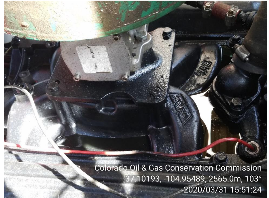
Colorado Oil & Gas Conservation Commission 37.10193, -104.95489, 2565.0m, 103° 2020/03/31 15:51:24

PHOTO 6: STANDING OIL IN COMPRESSOR SKID. COMPLY WITH GENERAL PERVISIONS OF THE OIL AND GAS ACT AND SB-181 REGARDING WILDLIFE PROTECTION. CA DATE 4-30-20.