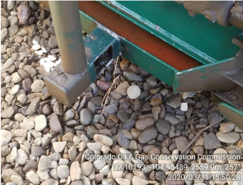
PHOTO 5: AREA OF IMPACTED UNDER COMPRESSOR SKID DRAIN APPEARS THAT SKID IS BEING DRAINED ON THE GROUND. Conduct maintenance on equipment, cleanup stained material and review self inspection processes. CA DATE 4-30-20.