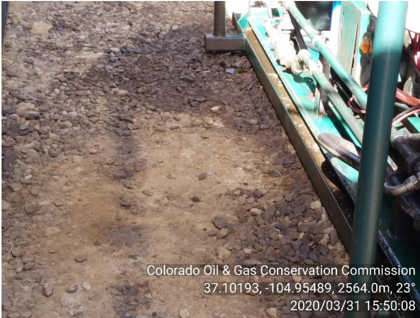
PHOTO 3: AREA OF IMPACTED SOIL AROUND COMPRESSOR SKID. Conduct maintenance on equipment, cleanup stained material and review self inspection processes. CA DATE 4-30-20.