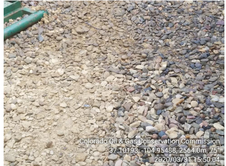
PHOTO 4: AREA OF IMPACTED SOIL AROUND COMPRESSOR SKID. Conduct maintenance on equipment, cleanup stained material and review self inspection processes. CA DATE 4-30-20.