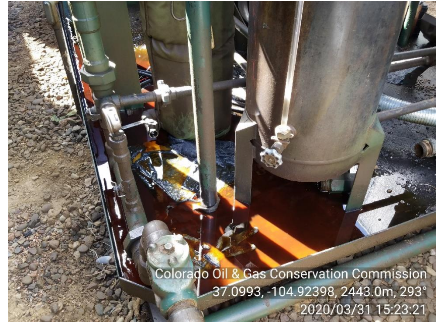
PHOTO 4: STANDING OIL INSIDE OF COMPRESSOR SKID. COMPLY WITH GENERAL PERVERSIONS OF OIL AND GAS ACT & SB-181 PERTAINING TO WILDLIFE PROTECTION. CA DATE 4-30-20