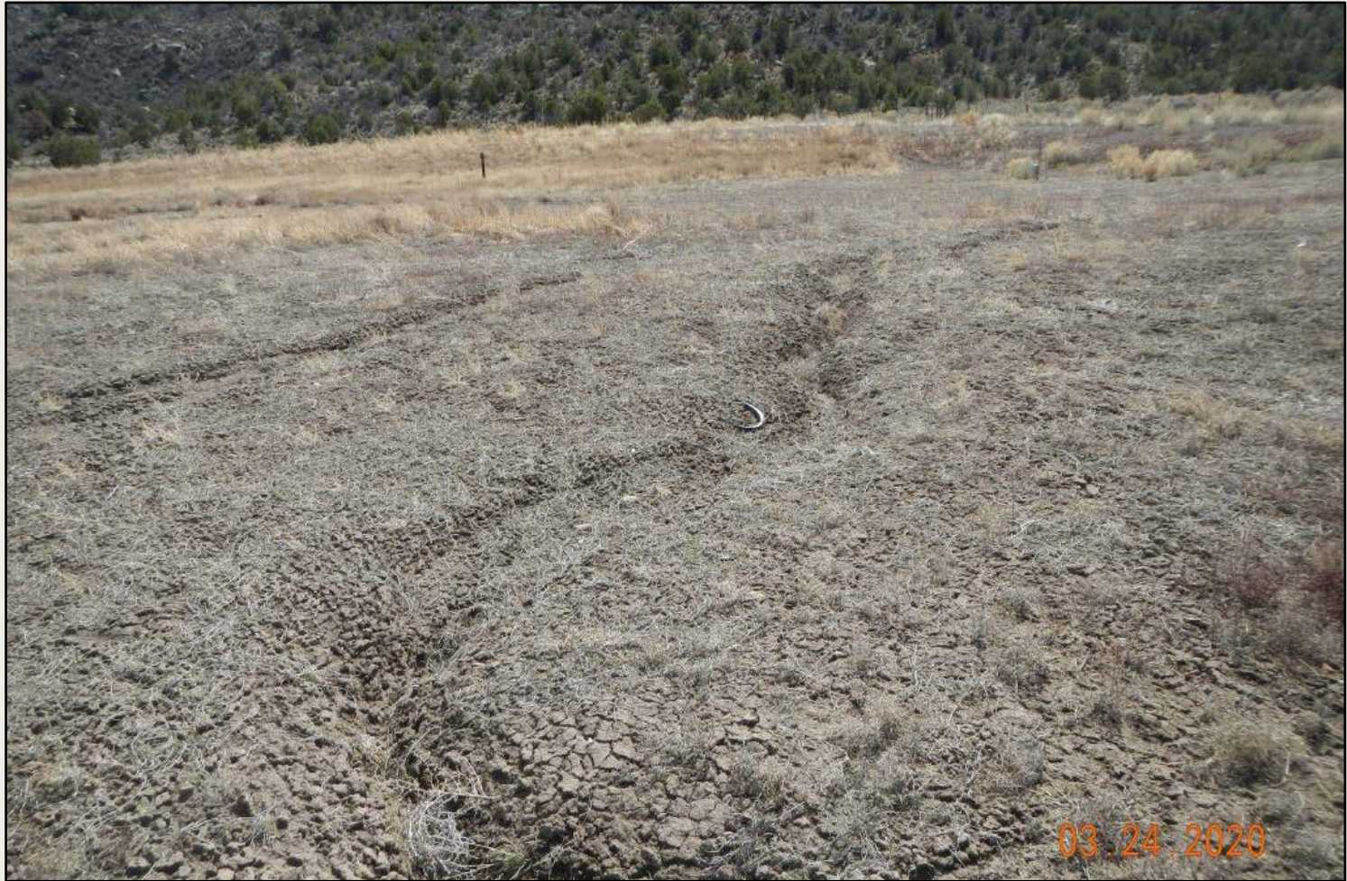
Photo 3. View of erosional rilling (approximately 1 foot wide and deep) within the northwestern project area facing up-slope (southward).