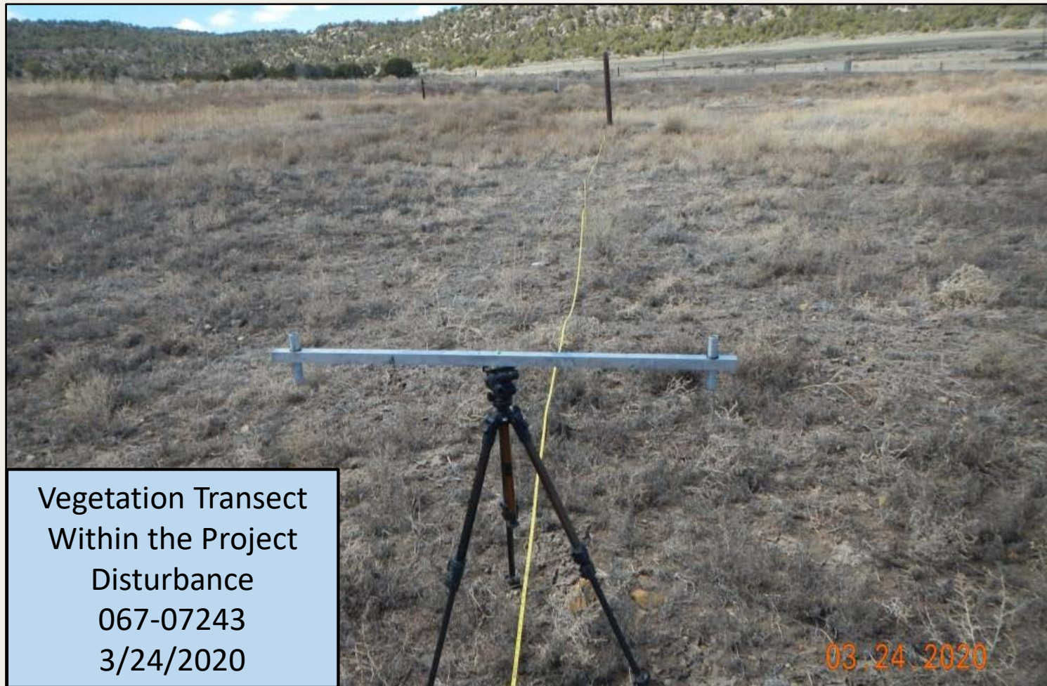
Photo 5. View from the beginning of Transect 1, within the project disturbance area facing westward. No desirable vegetation was detected along vegetation transect.