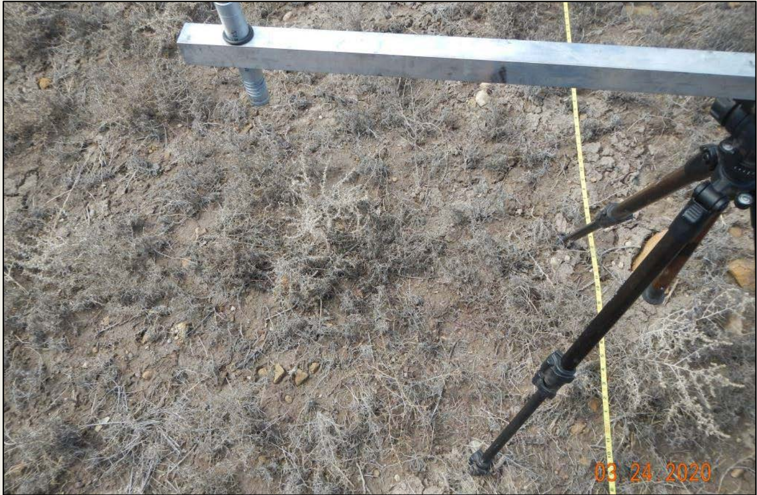
Photo 6. Birdseye view of midpoint along the vegetation Transect. Observable vegetation is all weed debris from previous growing seasons-largely Russian thistle and bindweed.