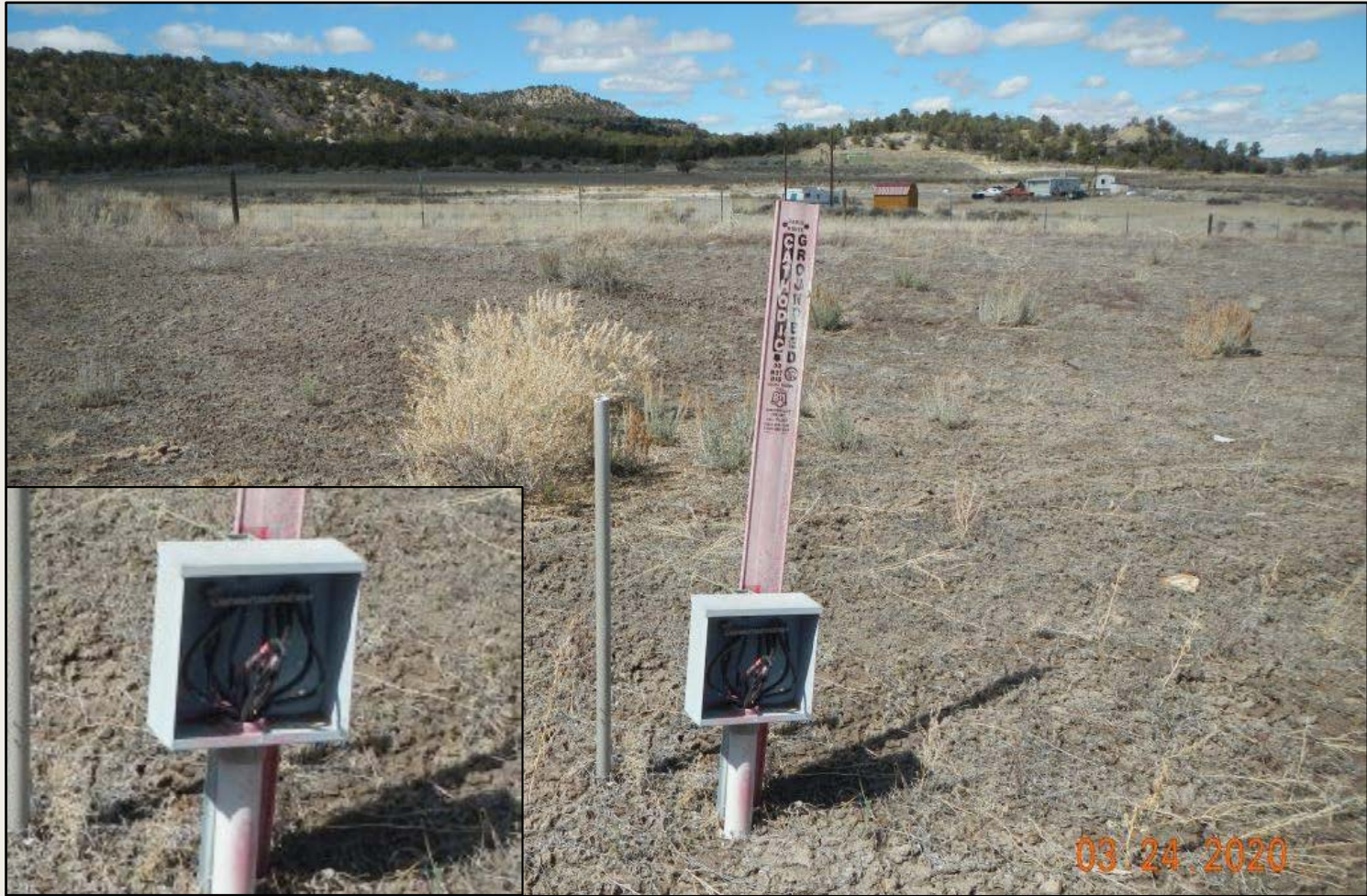
Photo 2. View of electrical equipment that remains within the western project area. Closeup in lower left inset shows exposed electrical wiring.