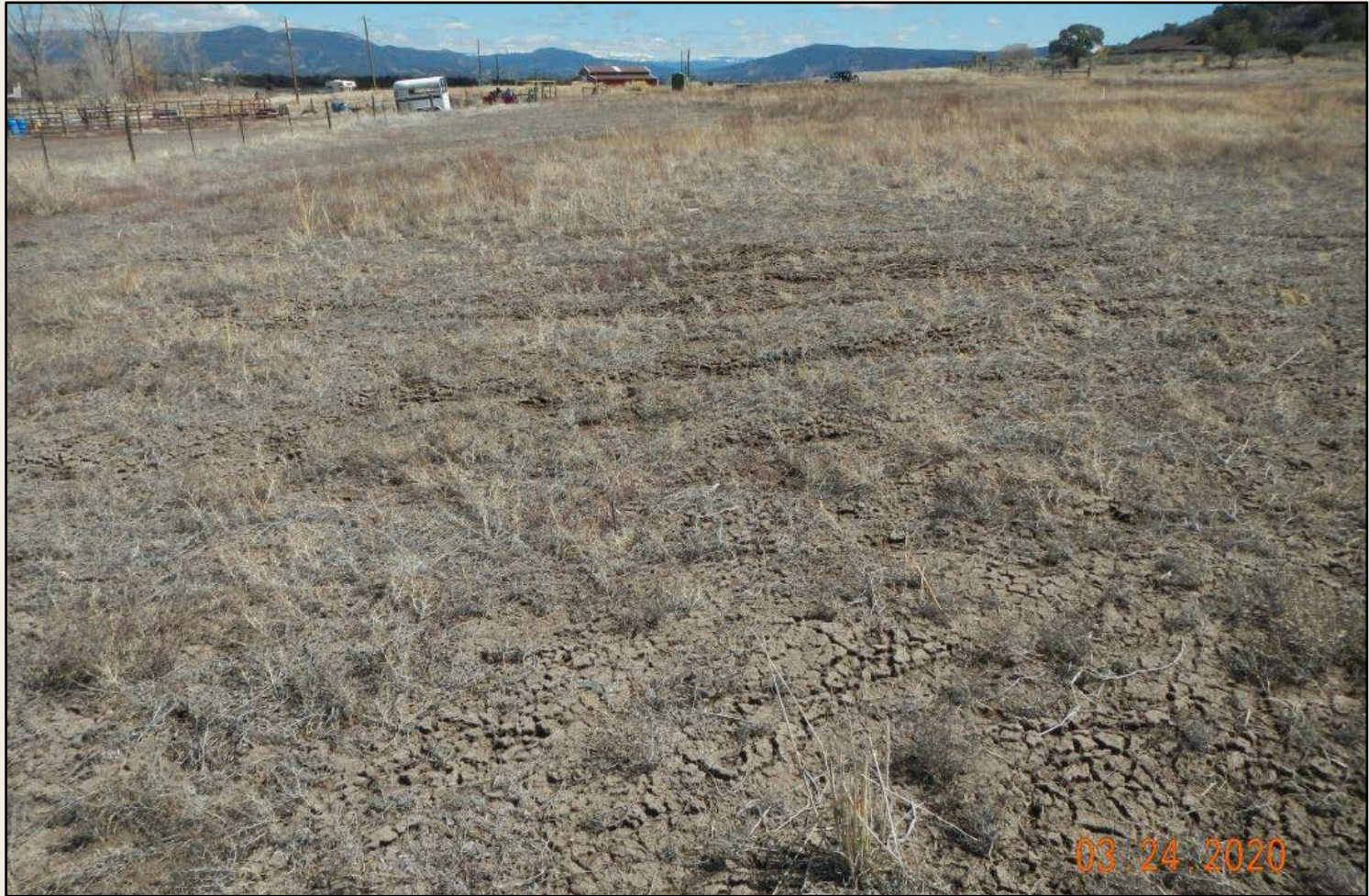
Photo 4. View of the northern fill slope facing eastward from the northwestern corner of the well pad.