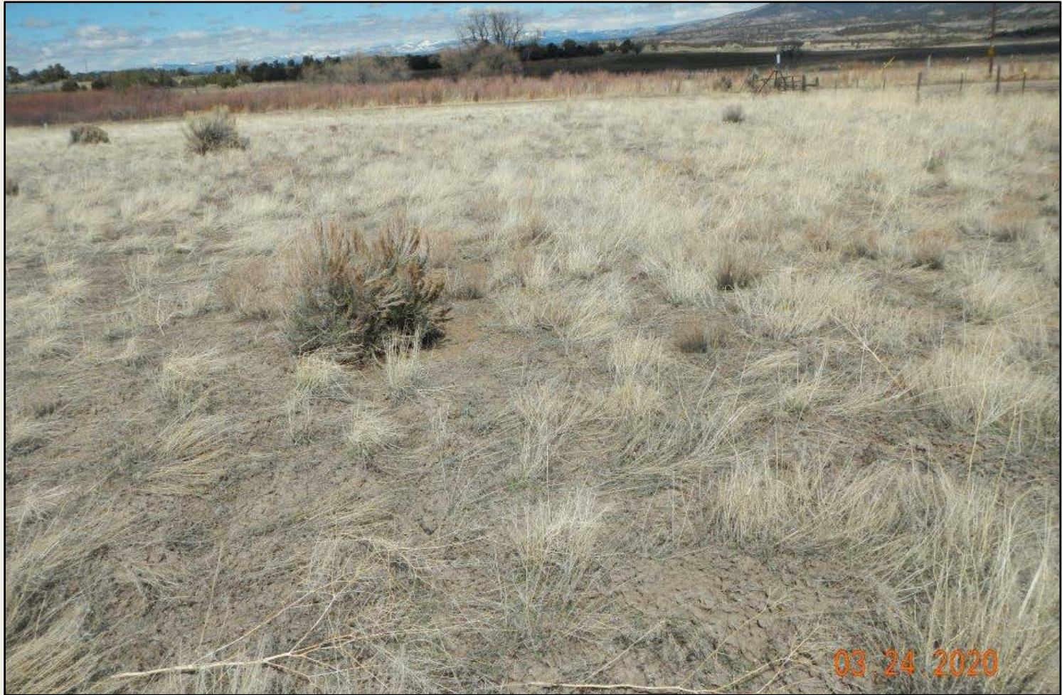
Photo 5. View of reference area vegetation, largely comprised of open sagebrush shrubland with native perennial grasses and forbs.