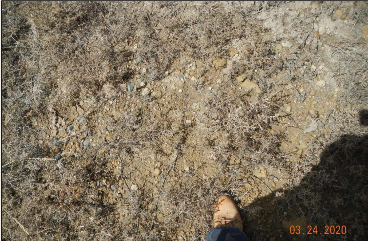
Photo 4. Birdseye view of lack of desirable vegetation in the interim reclamation area. Observable vegetation is Russian thistle debris.