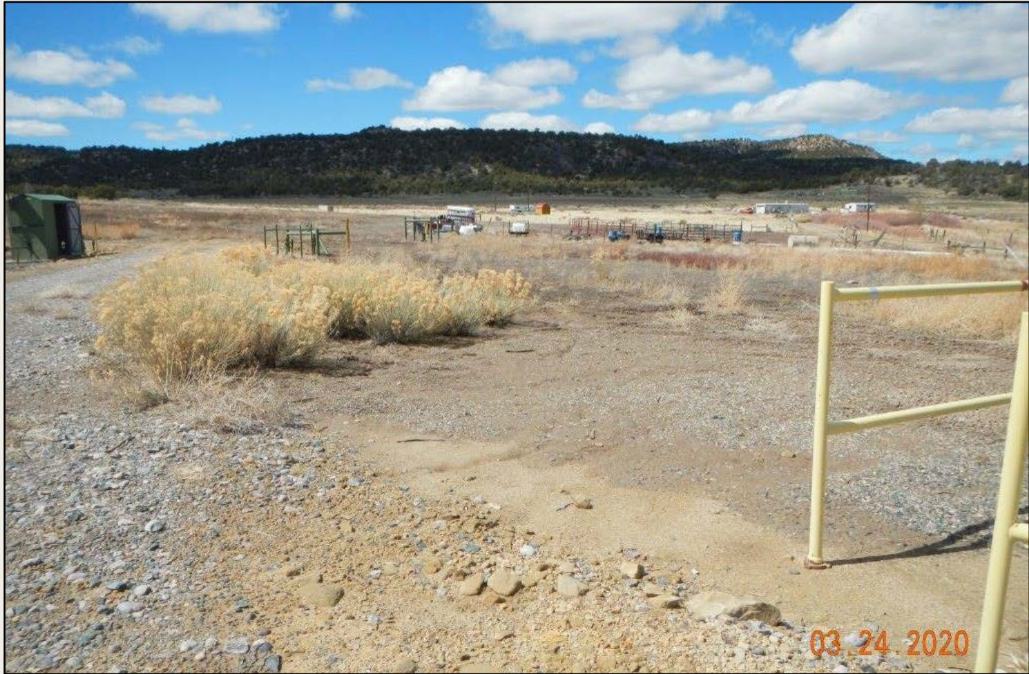
Photo 2. View of the northern project area from the well pad entrance facing westward. Revegetation is sparse within the majority of the project area. Some areas are revegetating with rubber rabbitbrush and sand dropseed.