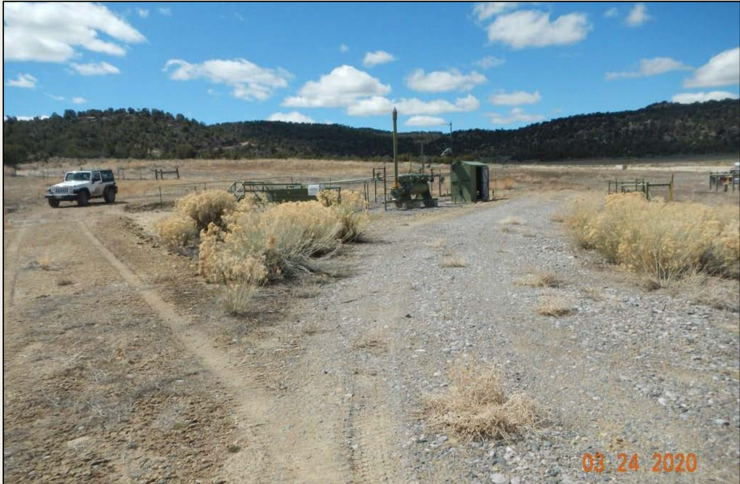
Photo 1. View of the project area from the well pad entrance facing center.