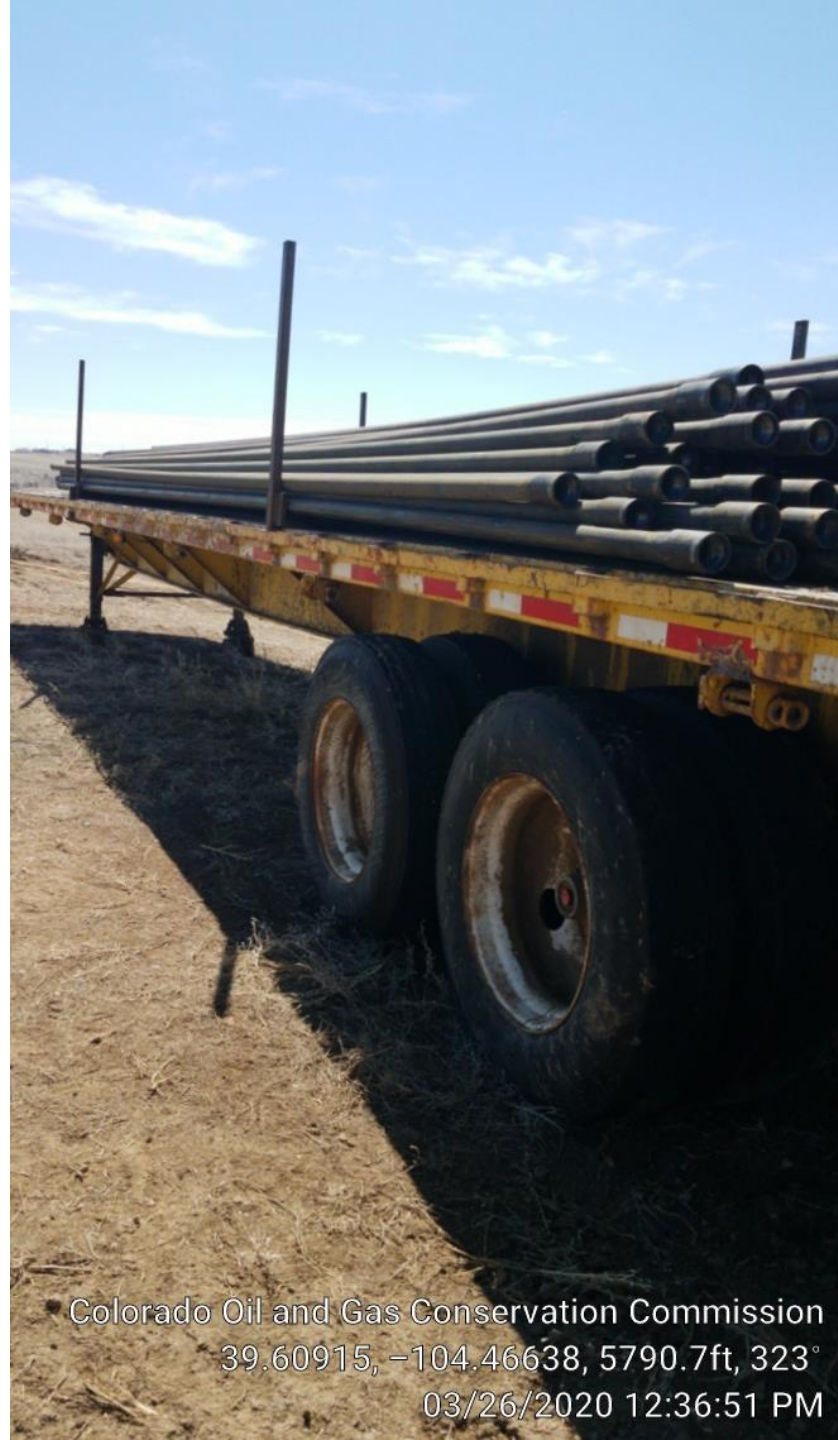
Tubing from Murphy well.