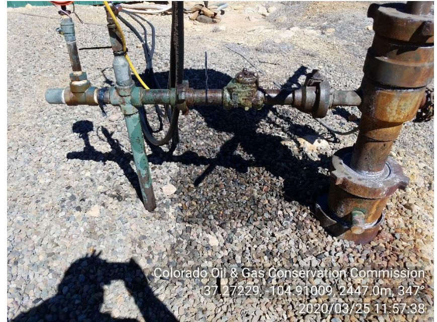
Colorado Oil & Gas Conservation Commission 37.27229, -104.91009, 2447.0m, 347° 2020/03/25 11:57:38