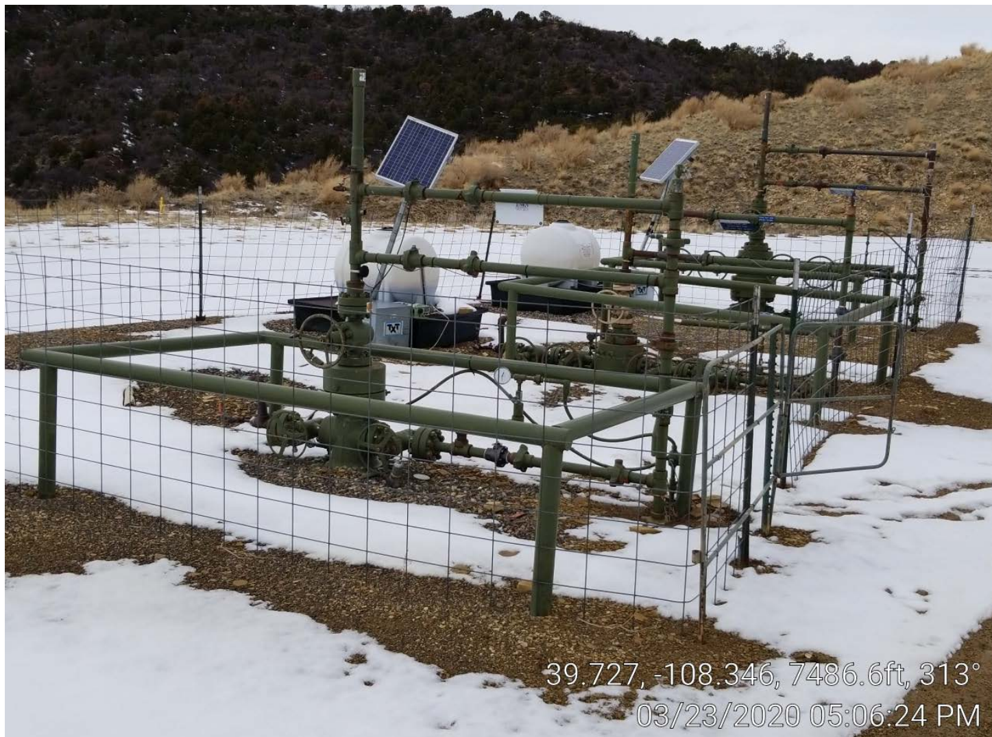
Figure Four M01 498 API: 05-103-10482, 10483, 10484 Inspection: 700400644

39.727, -108.346, 7486.6ft, 313° 03/23/2020 05:06:24 PM