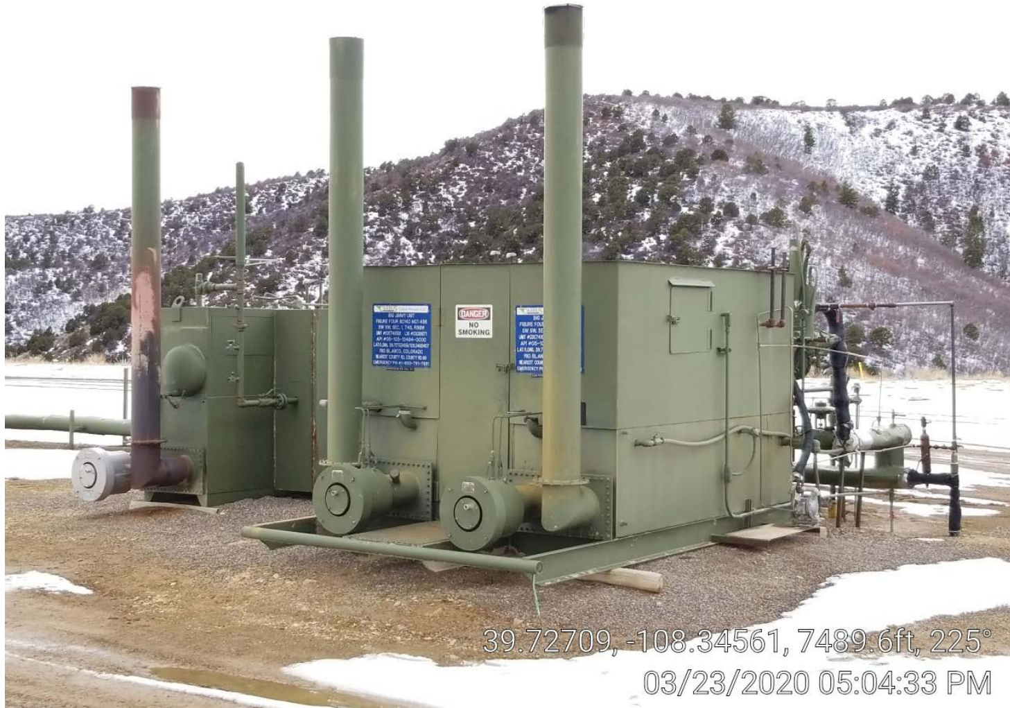
Figure Four M01 498 API: 05-103-10482, 10483, 10484 Inspection: 700400644