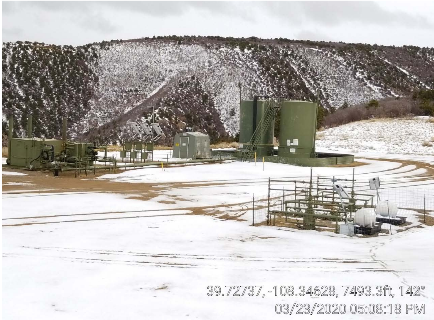
Figure Four M01 498 API: 05-103-10482, 10483, 10484 Inspection: 700400644

39.72737, -108.34628, 7493.3ft, 142° 03/23/2020 05:08:18 PM