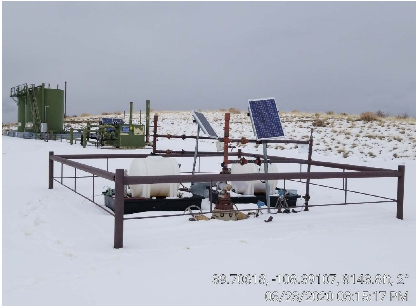
Figure Four A16 498 API: 05-103-10737, 10738 Inspection: 700400632

39.70618, -108.39107, 8143.8ft, 2° 03/23/2020 03:15:17 PM