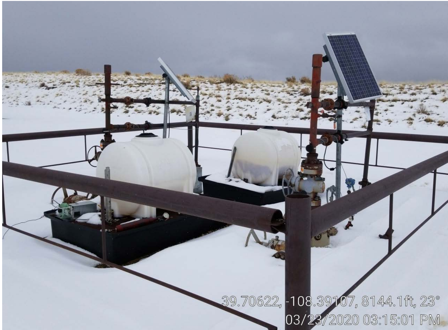
Figure Four A16 498 API: 05-103-10737, 10738 Inspection: 700400632