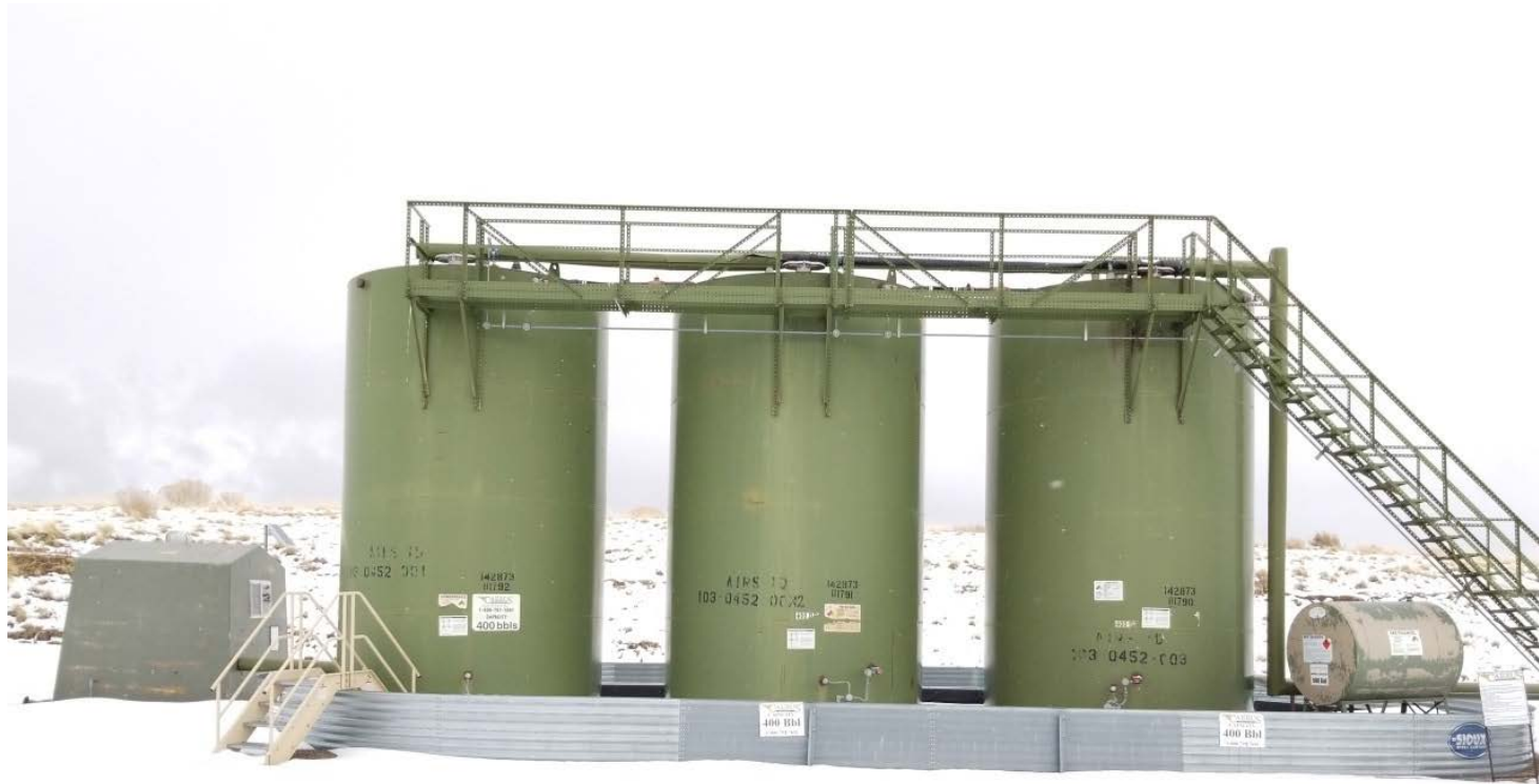
Figure Four A16 498 API: 05-103-10737, 10738 Inspection: 700400632

39.70672, -108.3911, 8159.4ft, 90° 03/23/2020 03:10:20 PM