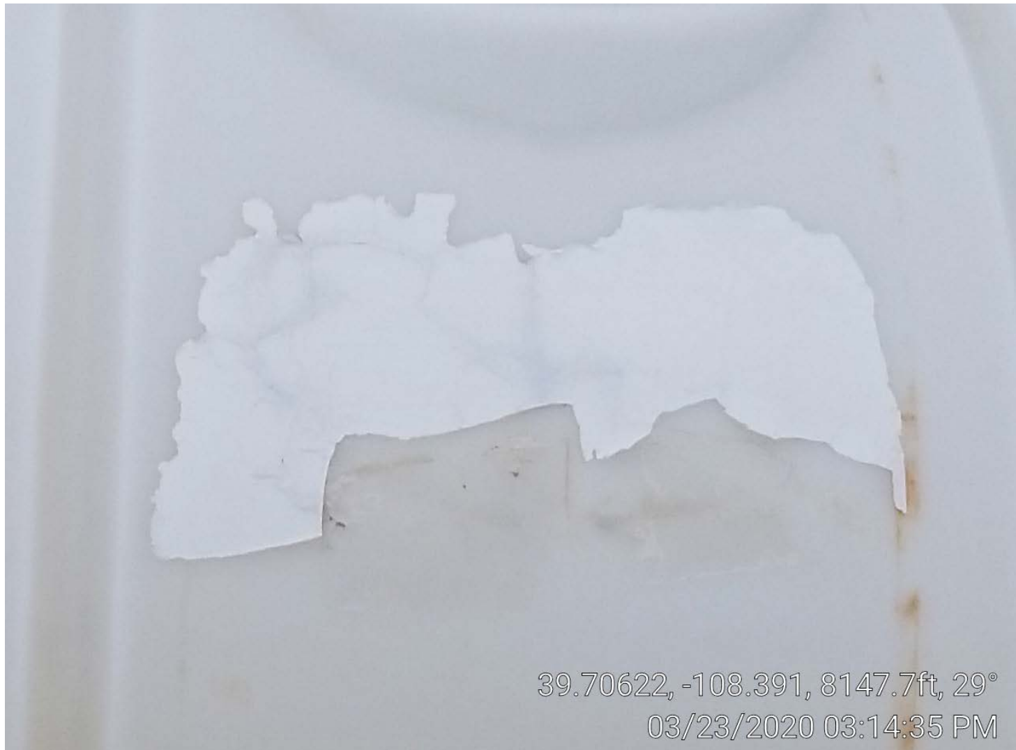
Figure Four A16 498 API: 05-103-10737, 10738 Inspection: 700400632