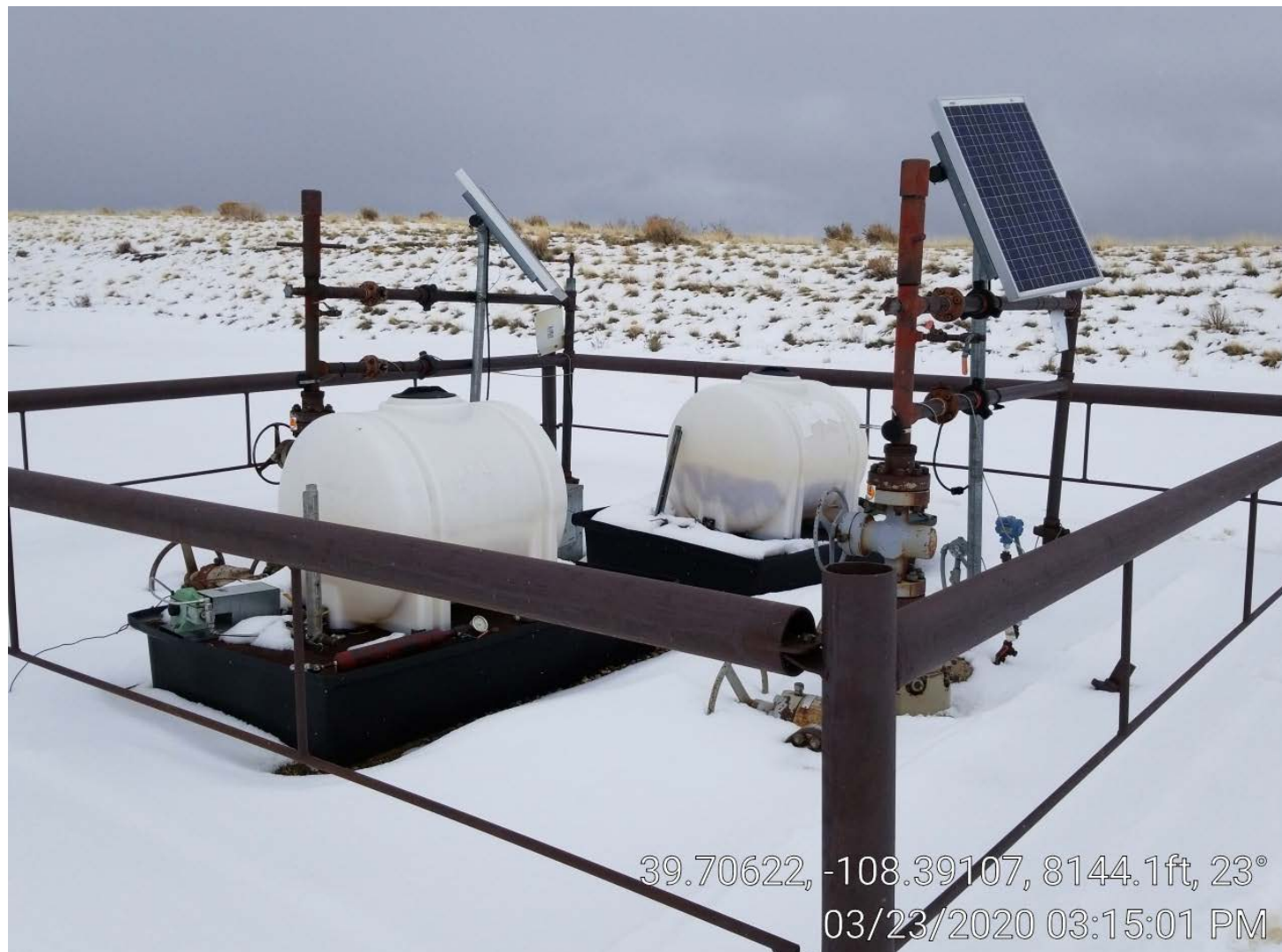
Figure Four A16 498 API: 05-103-10737, 10738 Inspection: 700400630