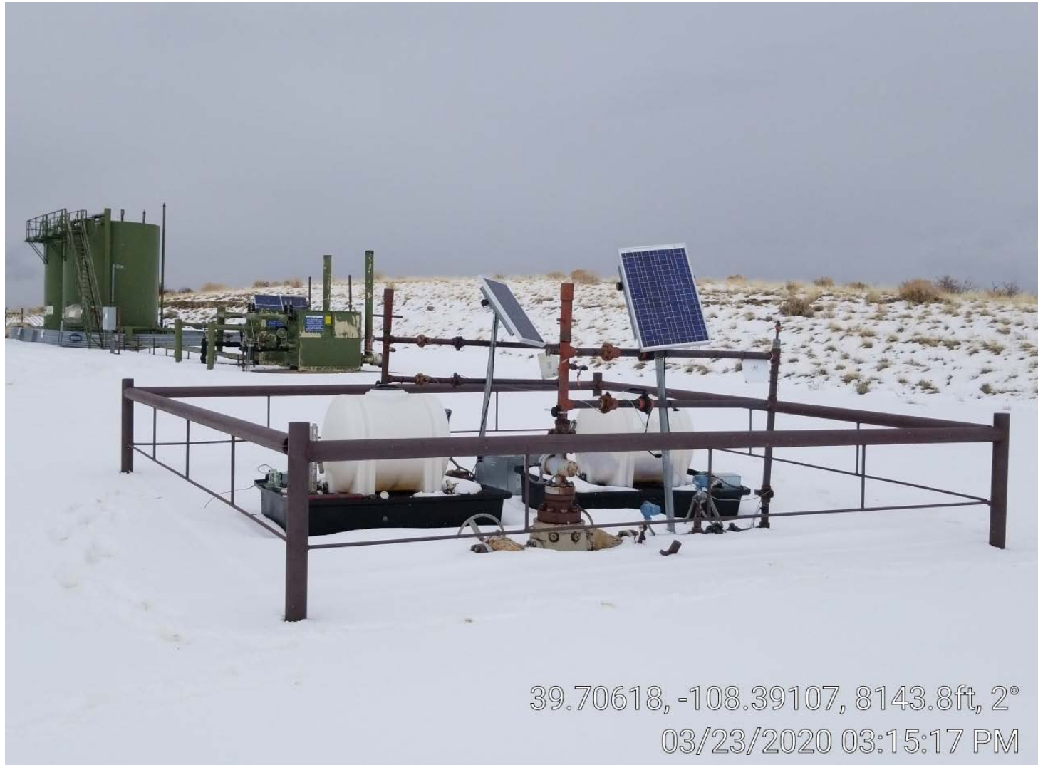
Figure Four A16 498 API: 05-103-10737, 10738 Inspection: 700400630

39.70618, -108.39107, 8143.8ft, 2° 03/23/2020 03:15:17 PM