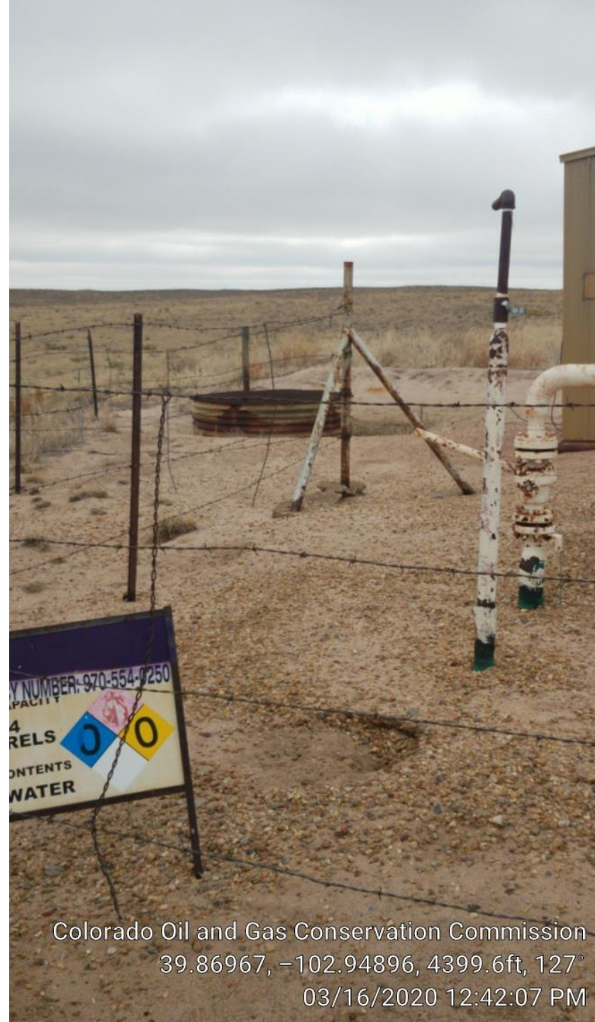
Colorado Oil and Gas Conservation Commission 39.86967, -102.94896, 4399.6ft, 127° 03/16/2020 12:42:07 PM