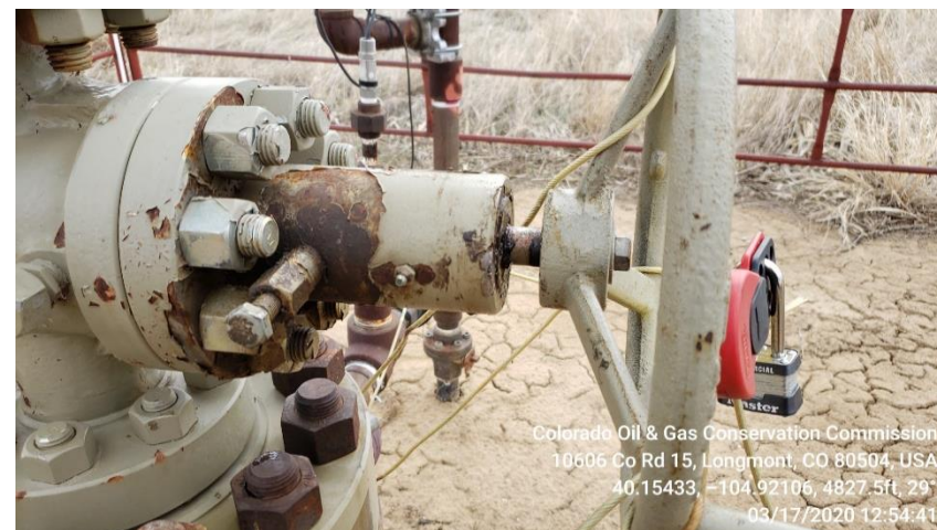
Photo 2 WH valve