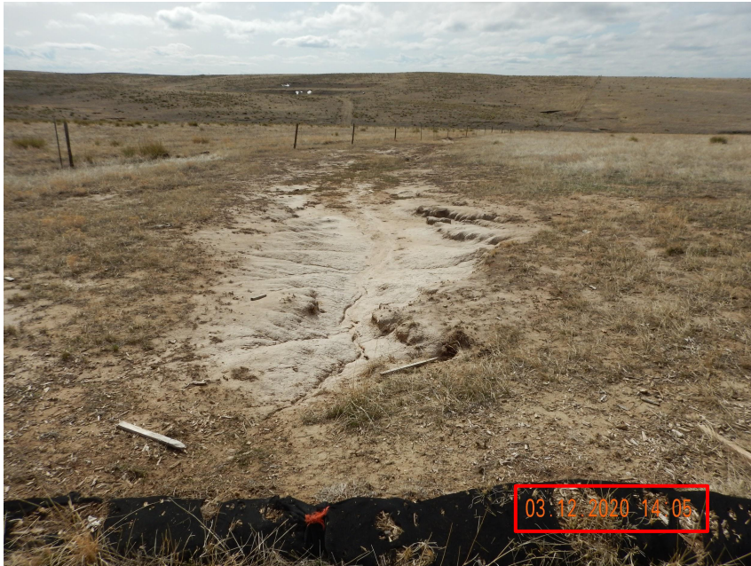
Photo 9. Photo taken from the western battery location on 3/12/2020, facing West. Photo illustrates Operator has failed to conduct any of previous corrective actions- refer to Photos 3-6.