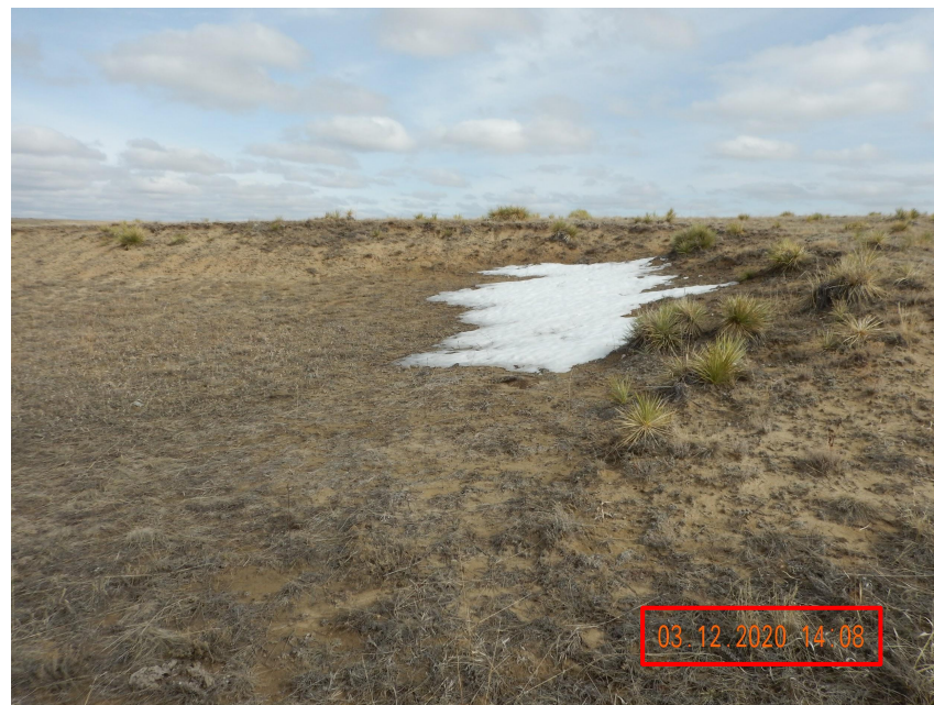
Photo 12. Photo taken of the southeastern well location on 3/12/2020, facing East. See comments under Photo 11.