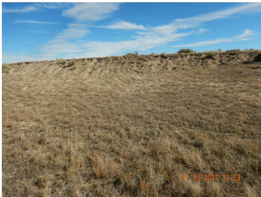
Photo 7. Photo taken of the eastern well location on November 3, 2017, facing East. Operator has not reclaimed the location per Rule 1004 standards. The location has not been contoured to match the surrounding landscape. Rill erosion evident along the eastern cut slope.