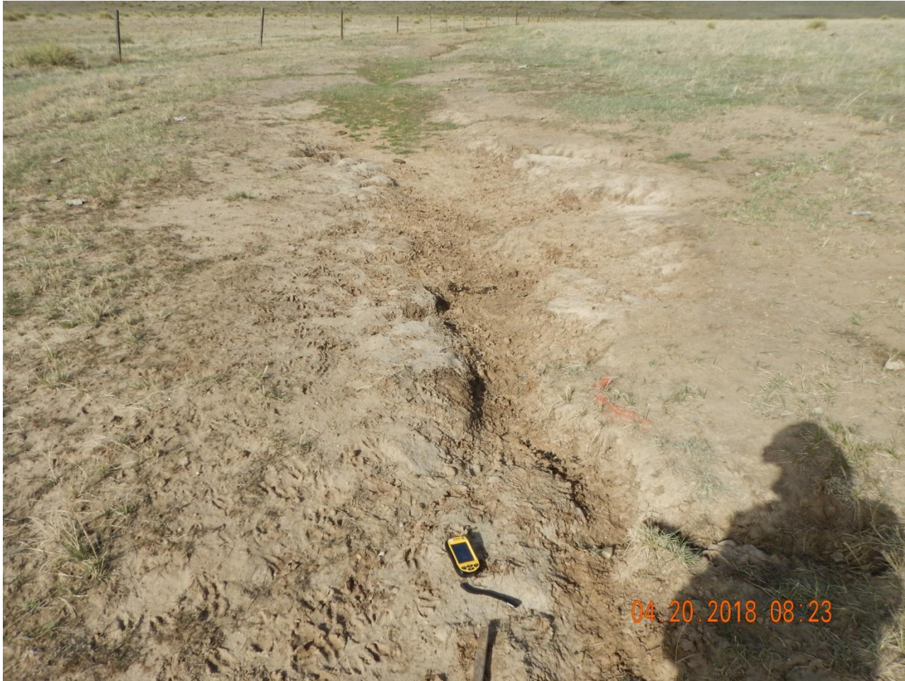
Photo 4. Photo taken from the gully erosion along the western battery location on 4/20/2018, facing West. Erosion continues west, off location.