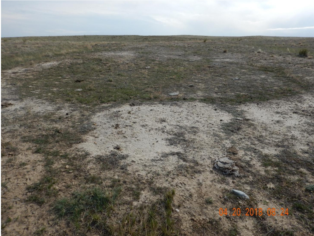
Photo 5. Photo taken from the western battery location on 4/20/2018, facing East. Vegetation at the battery location is not reflective of reference area vegetative level and does not meet Rule 1004 standards. Operator has failed to complete final reclamation activities.