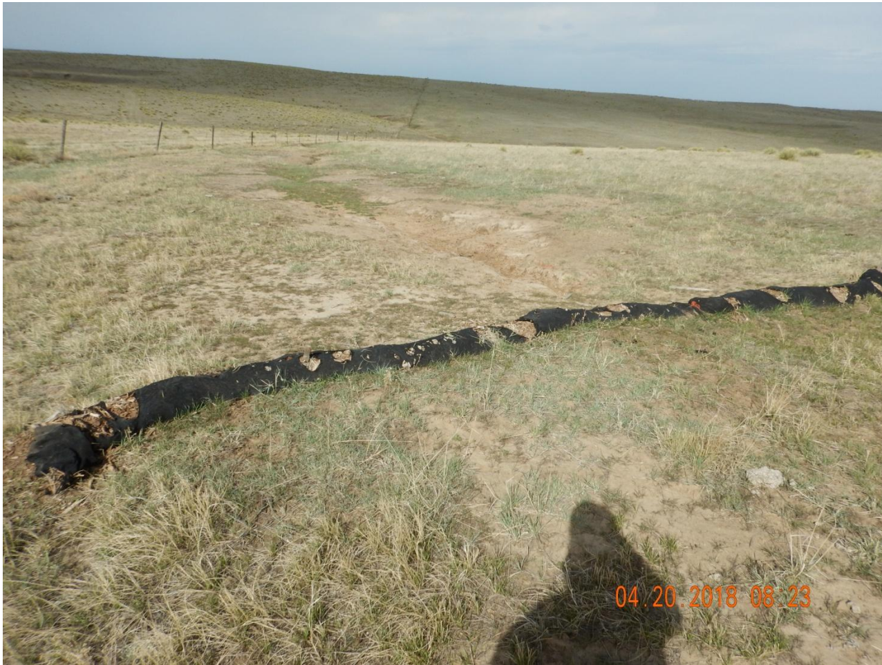
Photo 3. Photo taken from the western battery location on 4/20/2018, facing West. Gully erosion is evident and BMP is in disrepair. Operator has failed to complete final reclamation activities.