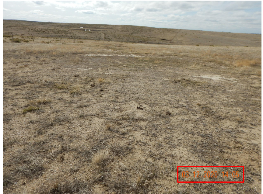
Photo 10. Photo taken from the western battery location on 3/12/2020, facing West. See comments under Photo 9.