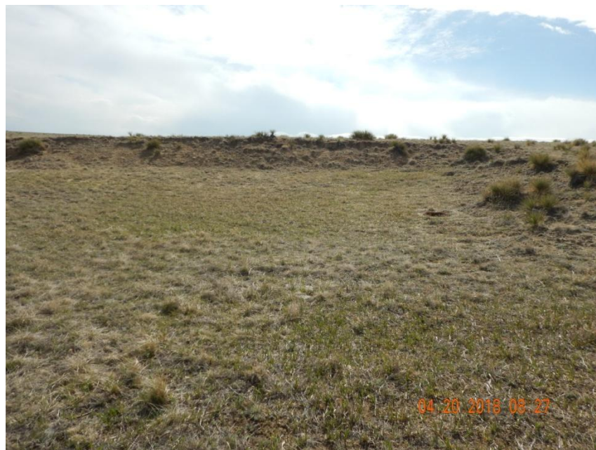
Photo 8. Photo taken of the eastern well location on April 20, 2018, facing East. Operator has failed to complete final reclamation activities.