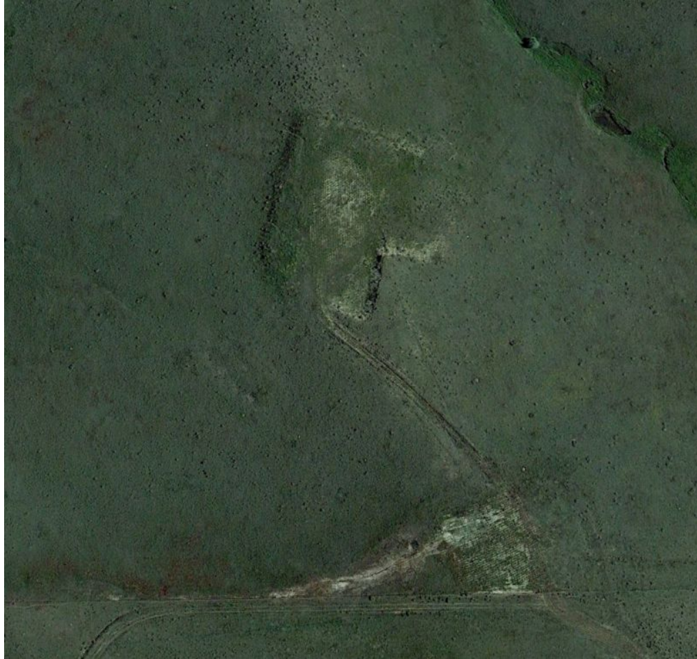
Photo 2. Google Earth aerial imagery taken 6/15/2010 illustrating well and battery location after the location was plugged in 2003. Both the well and battery locations do not meet Rule 1004 standards.