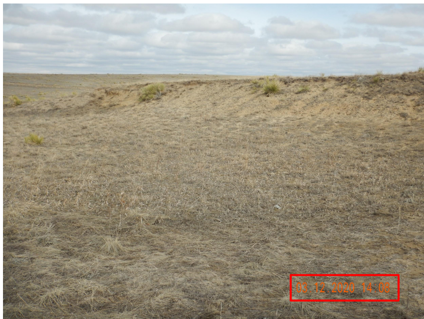
Photo 11. Photo taken of the eastern well location on 3/12/2020, facing Northeast. Photo illustrates Operator has failed to conduct any of previous corrective actions- refer to Photos 7-8.