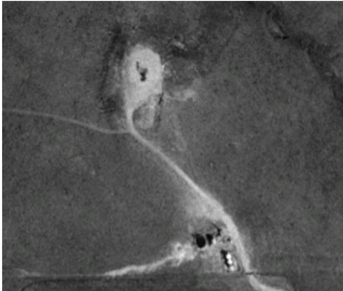
Photo 1. Google Earth aerial imagery taken 9/29/1999 illustrating well and battery location during operations.