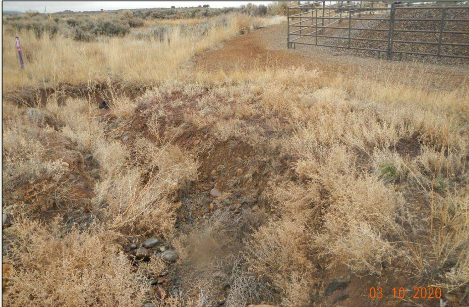
Photo 2. View of area adjacent to the southwestern corner of the working area where erosion continues. Cobble BMP placed in channel was not sufficient to stabilize this area and is largely washed downstream.