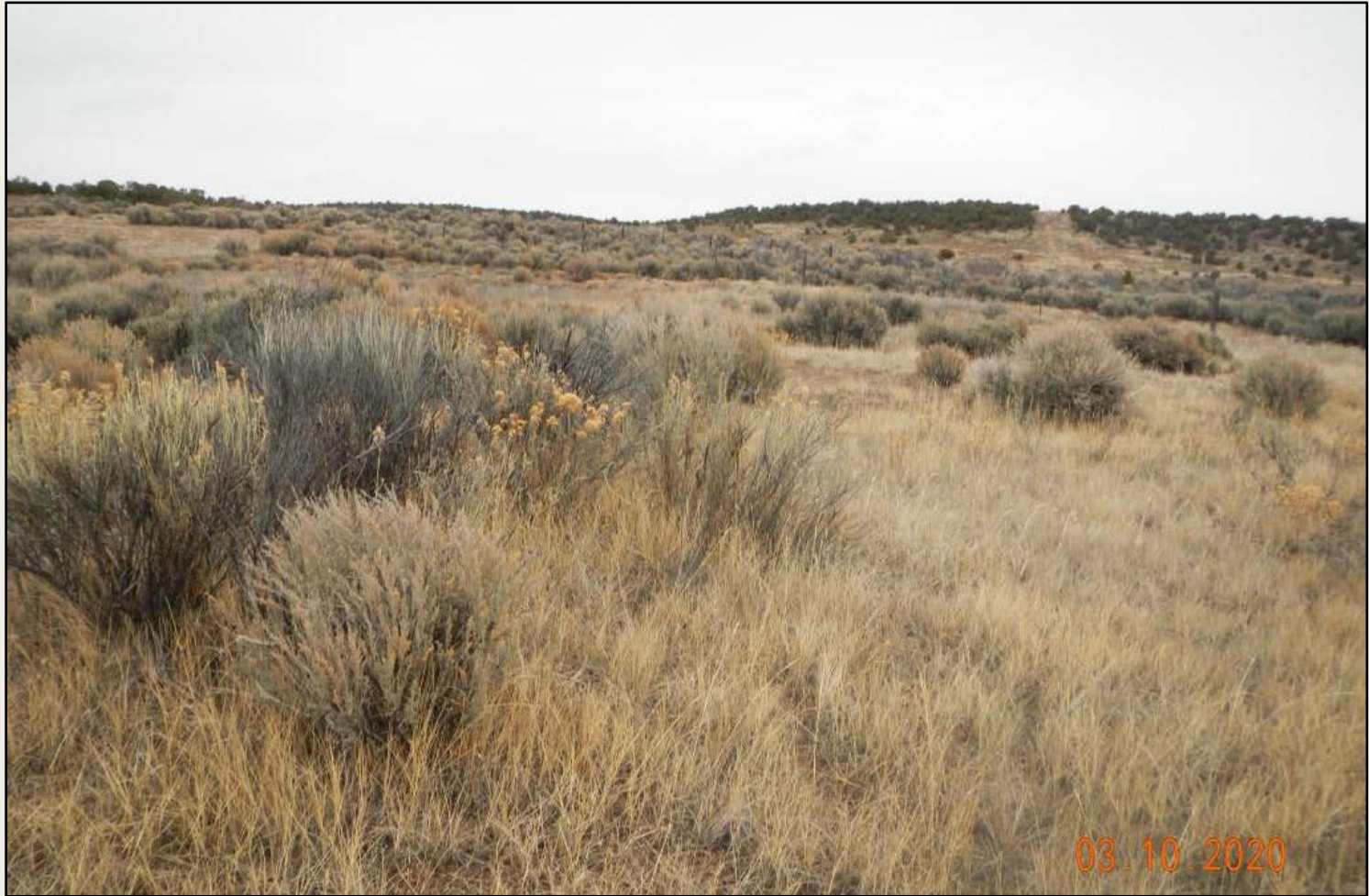
Photo 5. View of reference area vegetation comprised of sagebrush shrubland with grassy understory, dominated by thickspike wheatgrass, and James galleta.