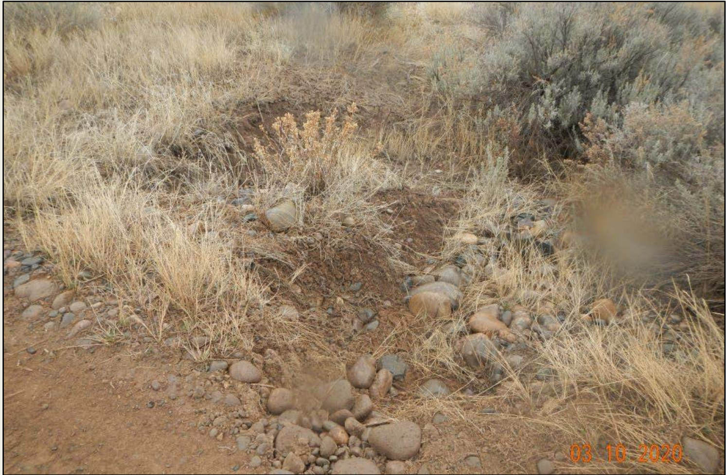
Photo 4. View of additional headcut erosion observed at well pad entrance where stormwater flows over the access road.