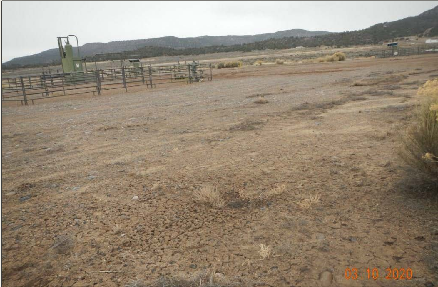
Photo 1. View of the project area from the northeastern corner facing center.