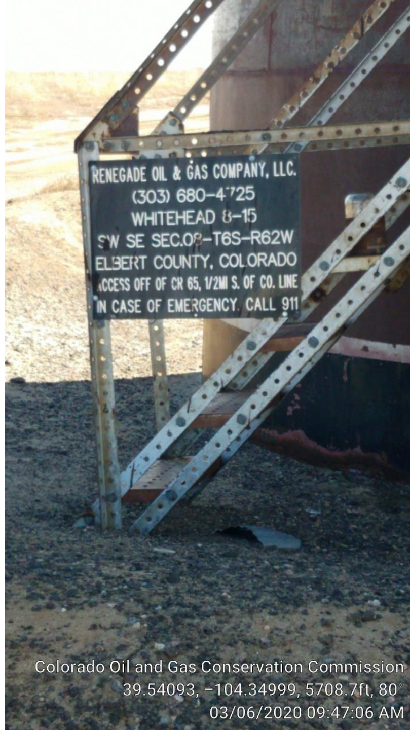
Colorado Oil and Gas Conservation Commission 39.54093, -104.34999, 5708.7ft, 80° 03/06/2020 09:47:06 AM