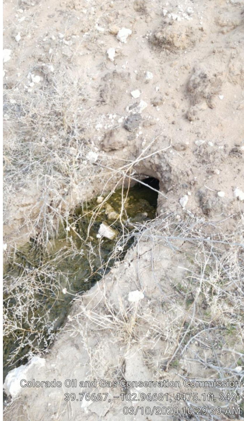
Animal hole in berm on south side of produced water pit.