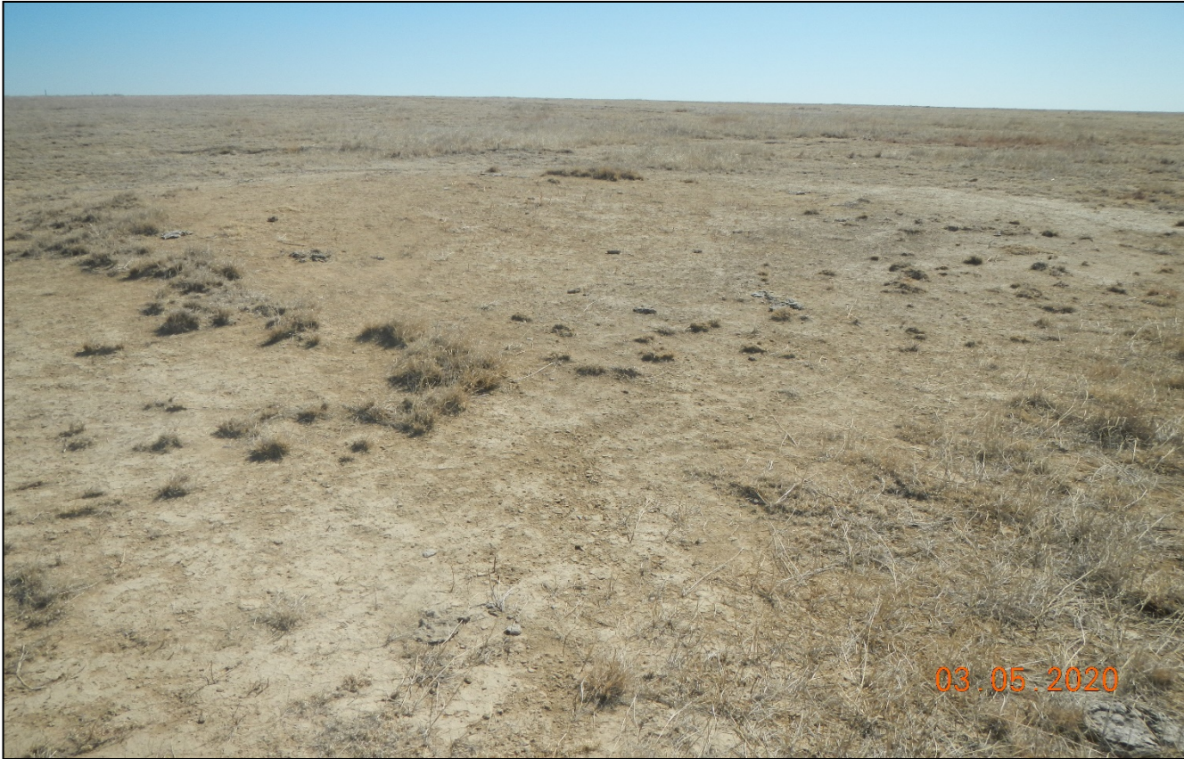
Photo 4. This area further south at the location is bare of vegetation approximately 60'x60'.