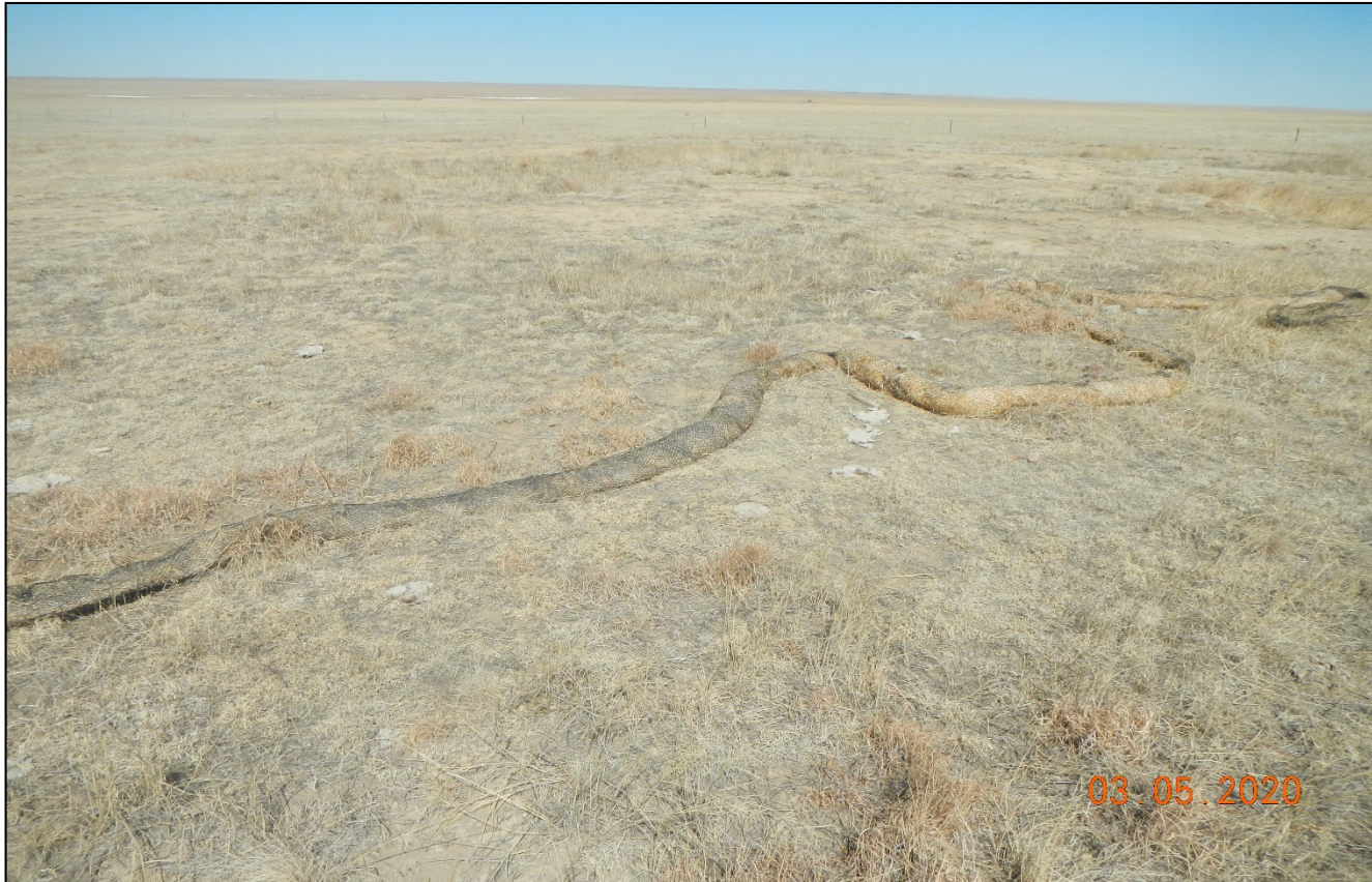
Photo 3. There are degraded wattles that remain at the location.