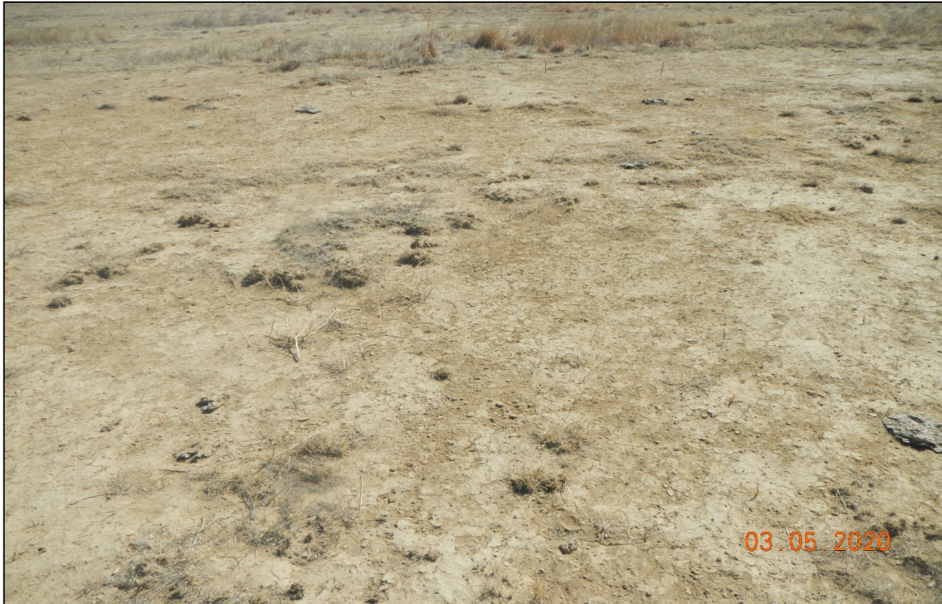
Photo 2. There are areas of the location which are bare of vegetation.