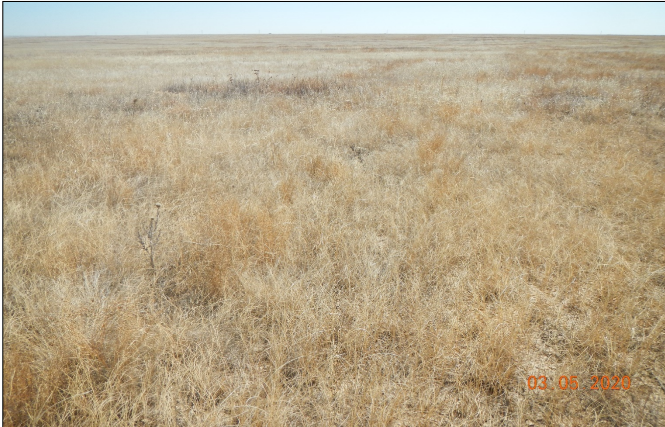
Photo 7. Facing southwest toward the surrounding reference area which consists of desirable vegetation such as Blue grama, Sand dropseed.