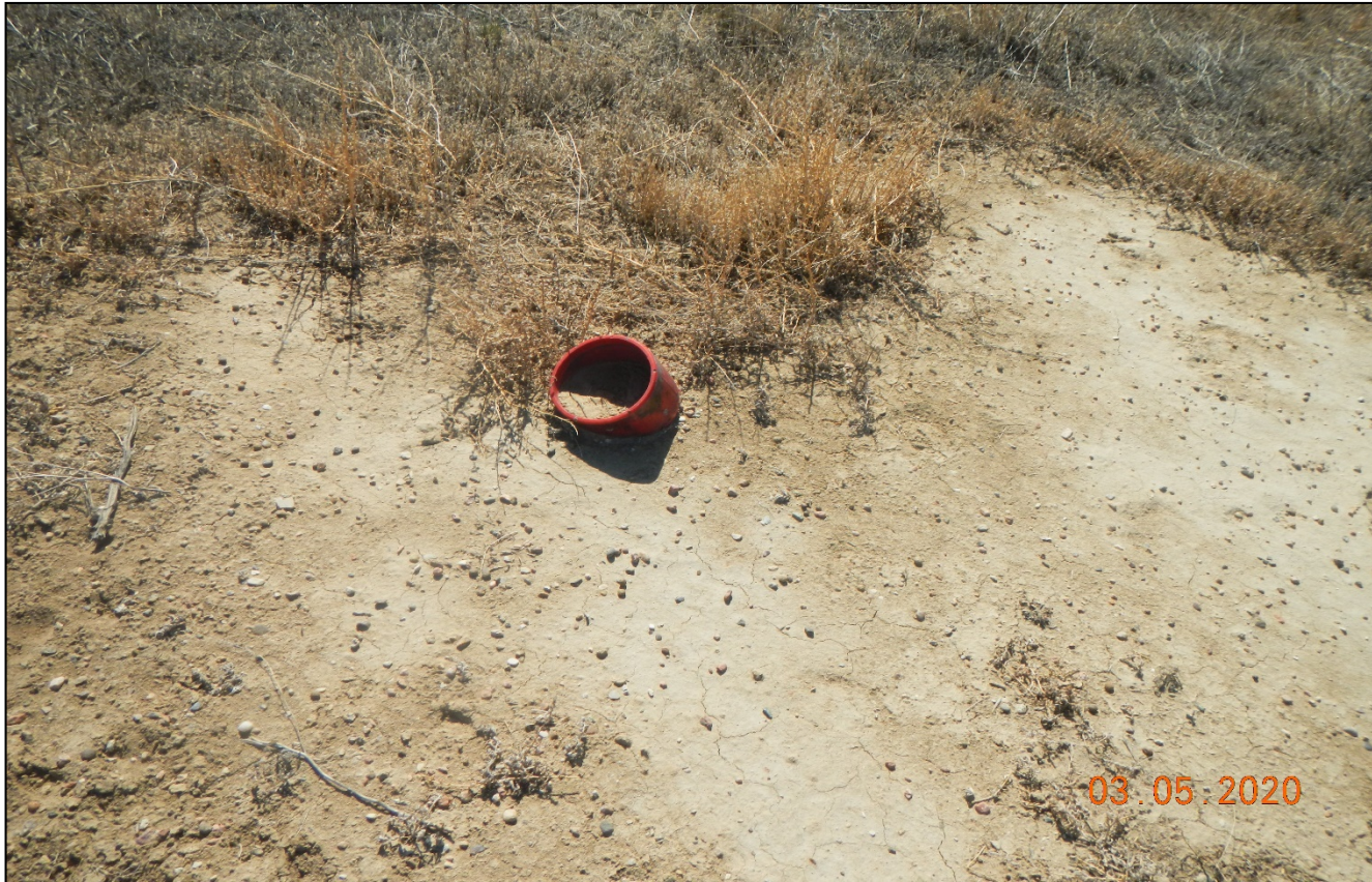
Photo 2. There is several red plastic couplers that remain at the location.