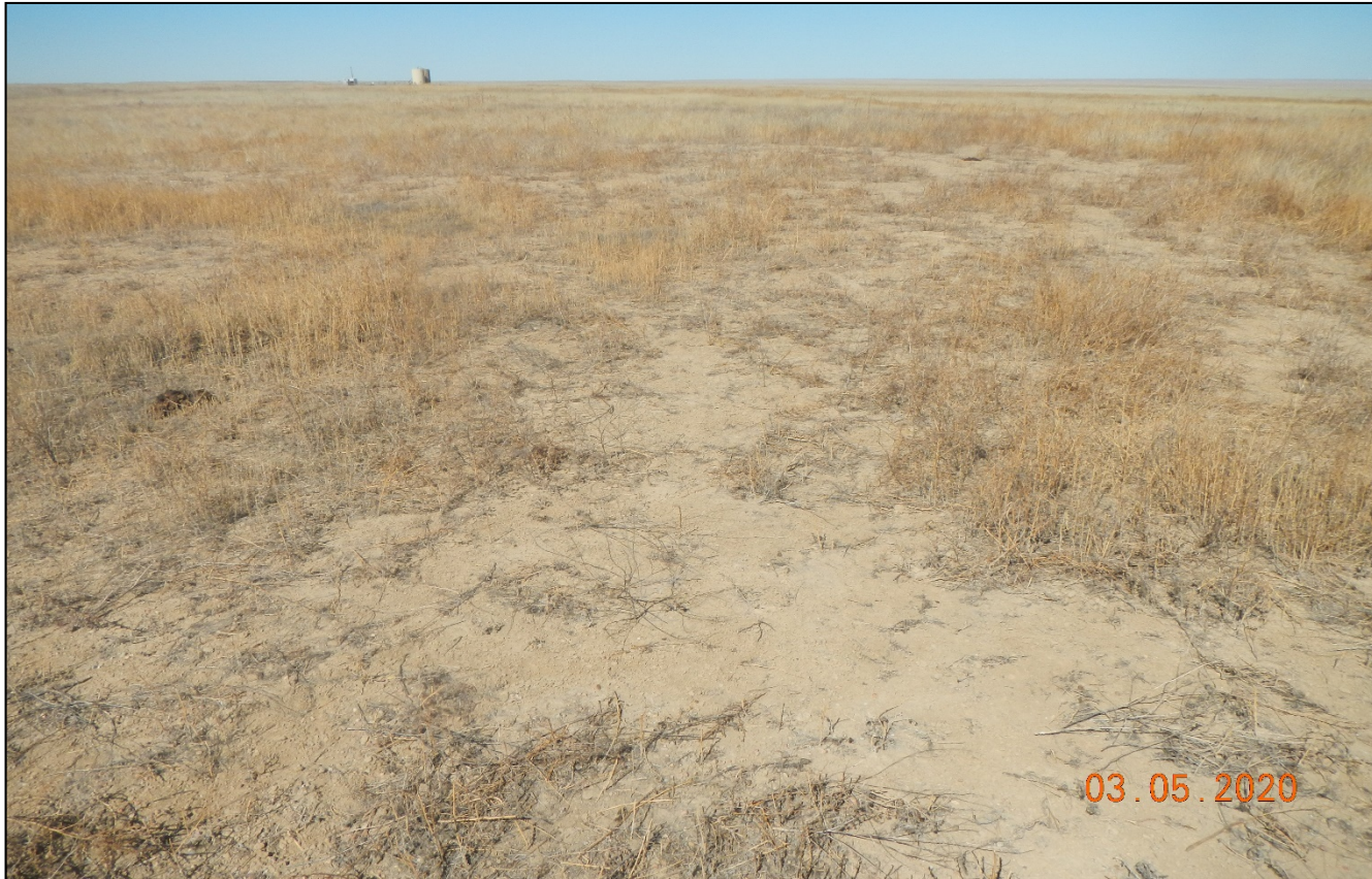
Photo 3. Facing north at the location. There is predominately undesirable weeds throughout the location.