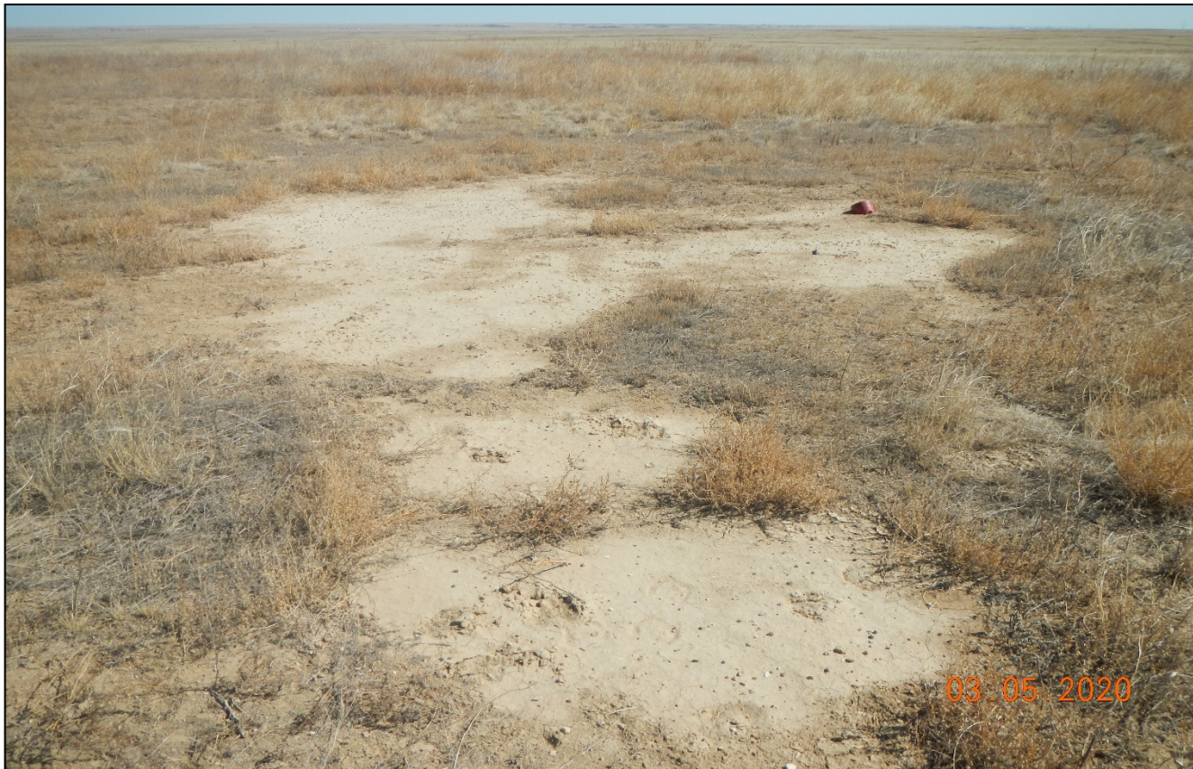
Photo 1. Facing east toward the location. There are areas that are bare of vegetation and undesirable weeds.