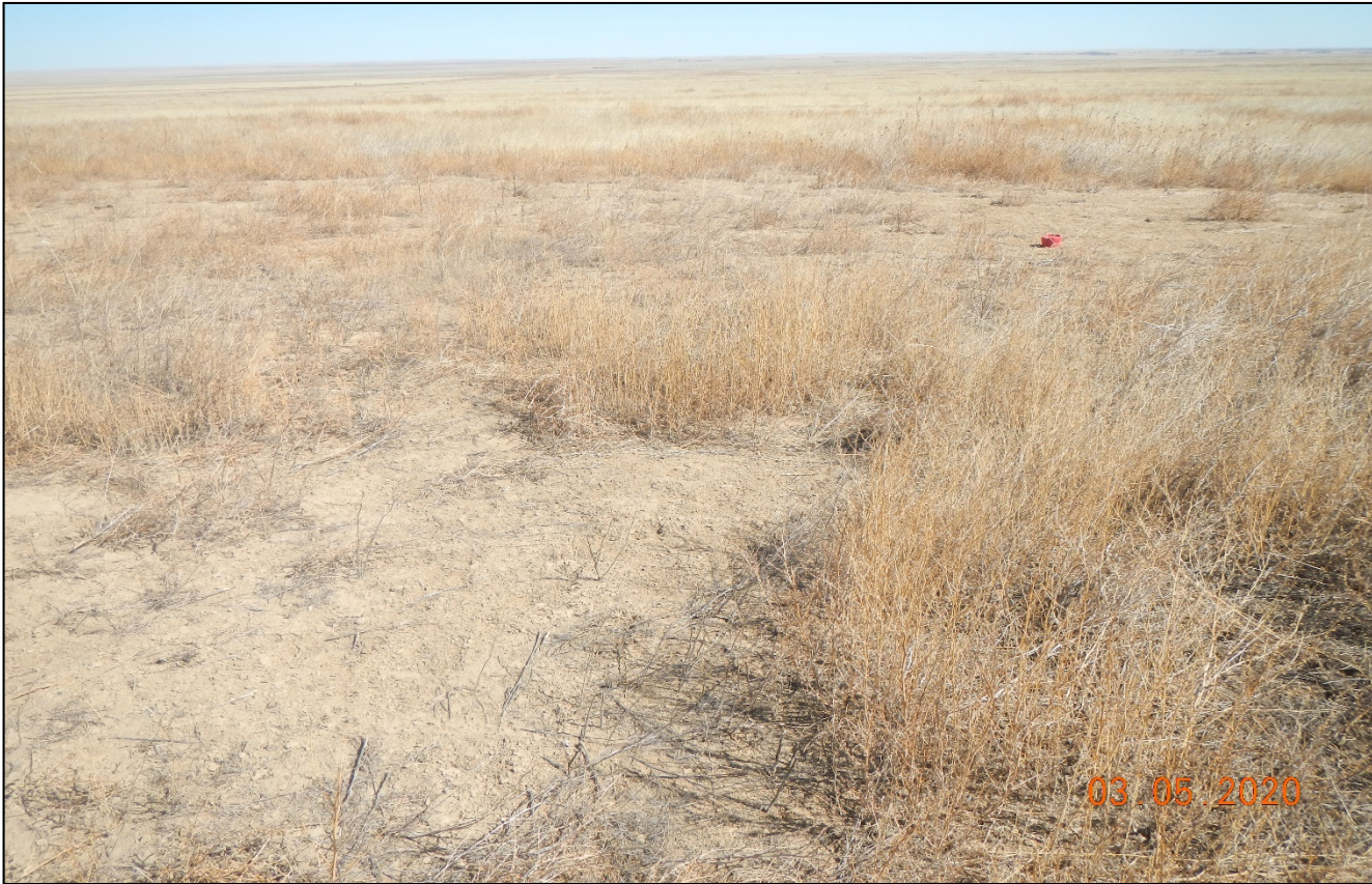
Photo 4. Facing east at the location. There is predominately undesirable weeds throughout the location.