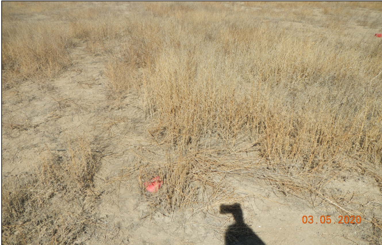
Photo 6. View of undesirable weeds ( Kochia sp.) observed throughout the location.