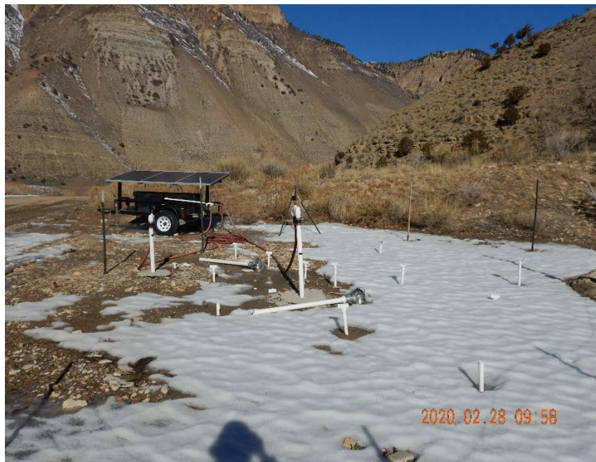
Photo #5 – SVE system remains west of tank battery. See Remediation Project #9489 for documentation.