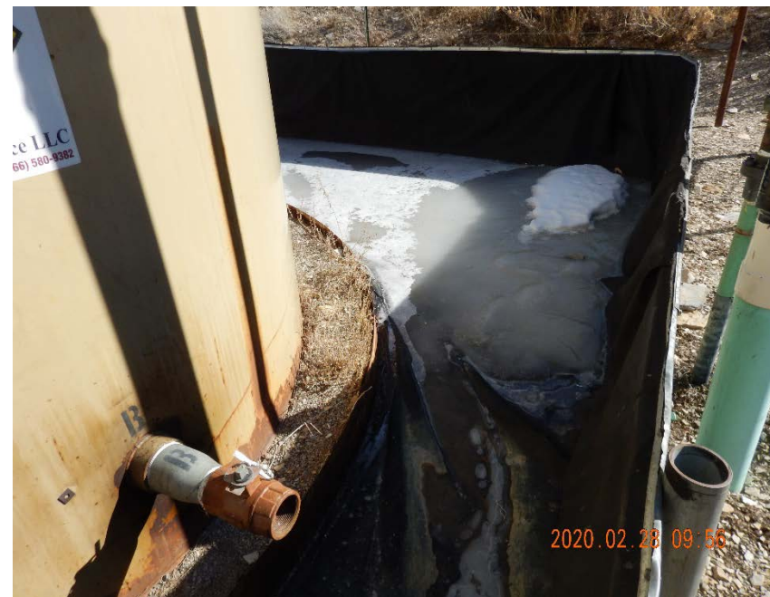
Photo #4 – Snow and ice inside of secondary containment (southeast corner).