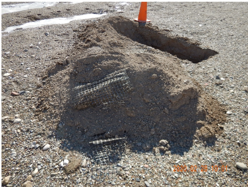
Photo #11 – Excavation and mesh debris in former tank battery area.