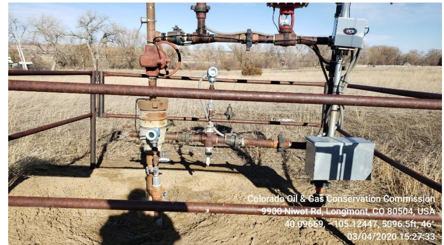
Photo 2 WH