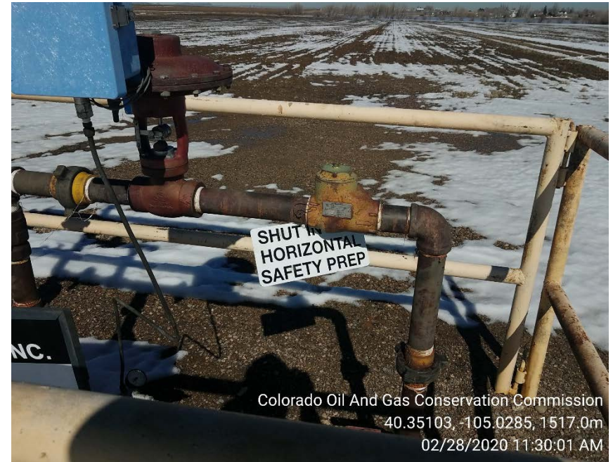
HZ safety prep sign