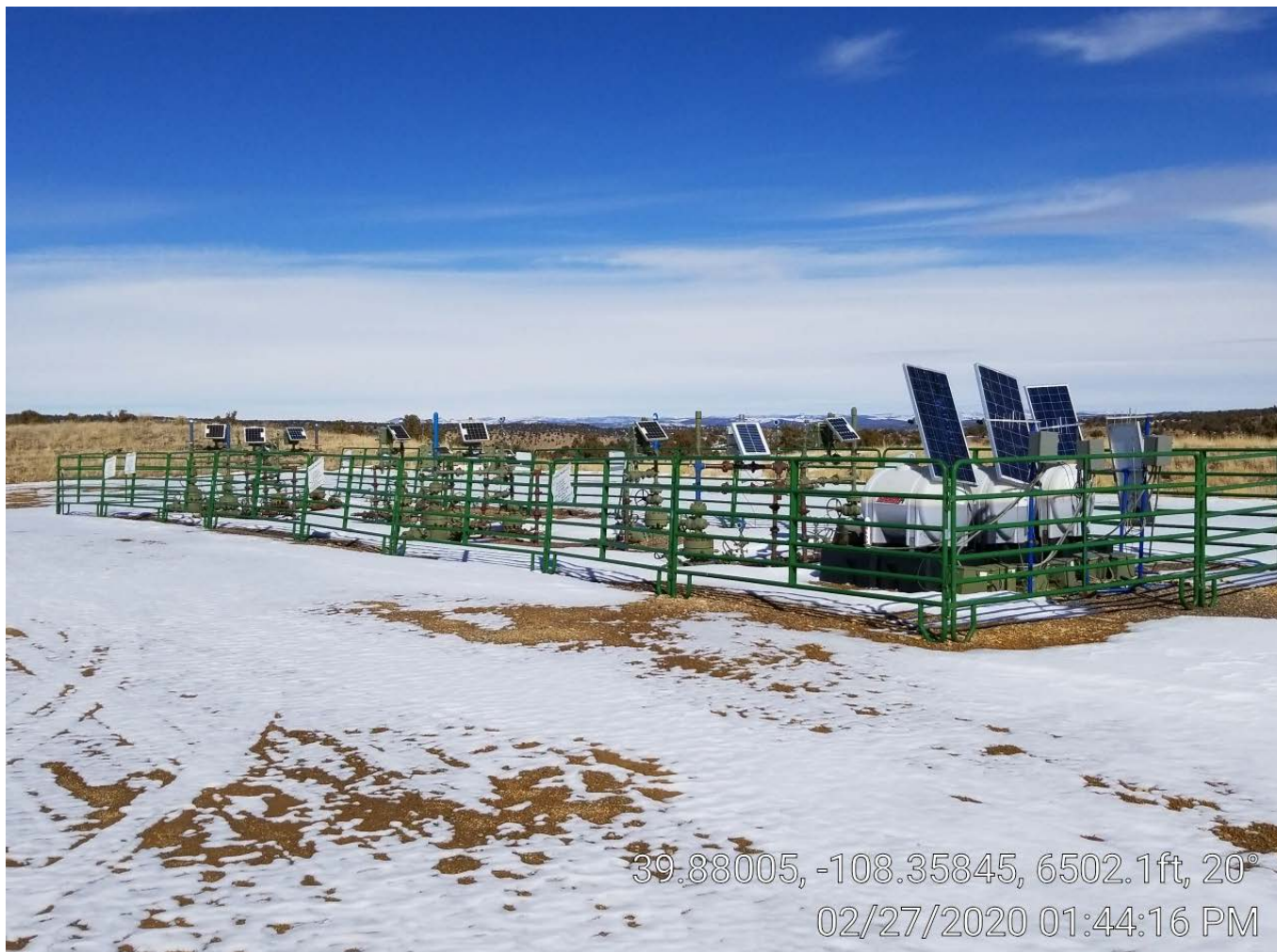
Photo 2. Well heads.

RG 32-14-298 pad API: 05-103-11270 Inspection: 700400227