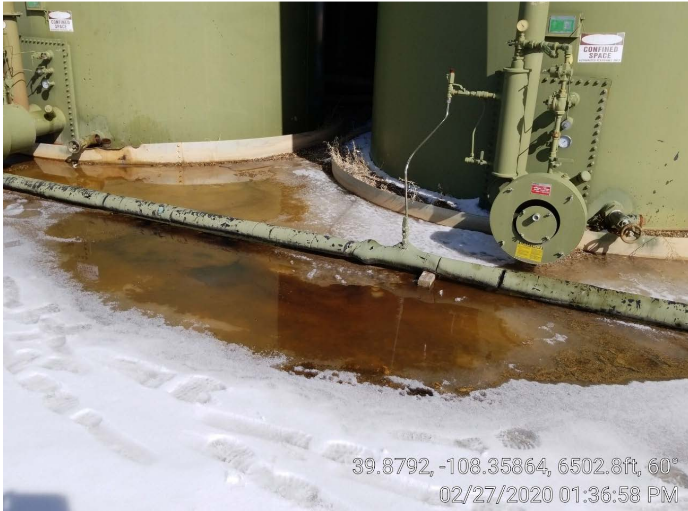
Photo 6. Hydrocarbons mixed in with snow melt.

RG 32-14-298 pad API: 05-103-11270 Inspection: 700400227