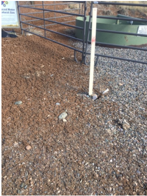
Photo of third corrective action completed

Completed work description of corrective action 3