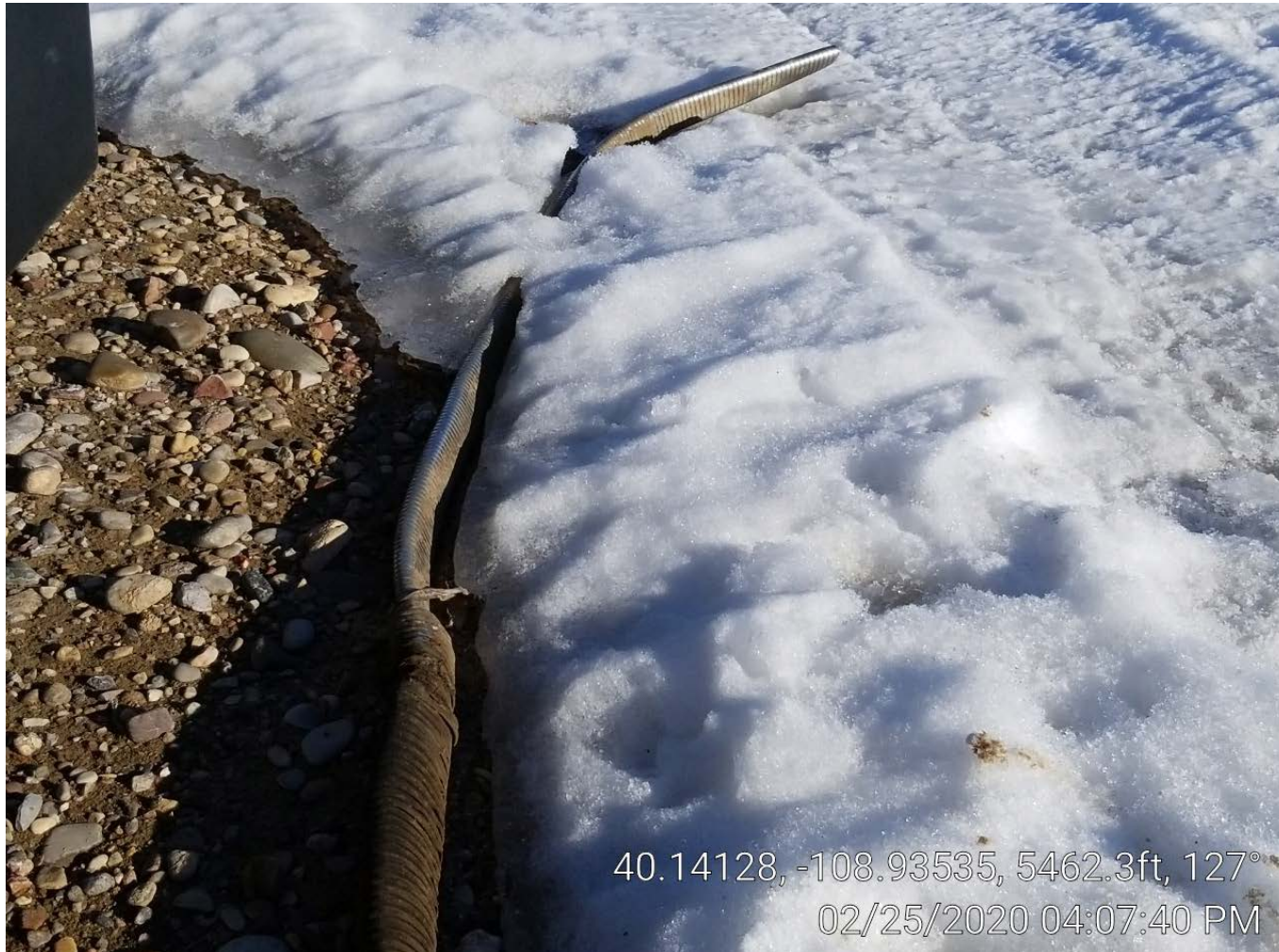
Photo 3. Cable trash next to chemical container.

A.C. McLaughlin 37 API: 05-103-06333 Inspection: 700400180