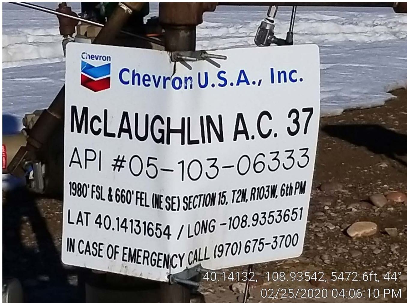
Photo 2. Well head sign.