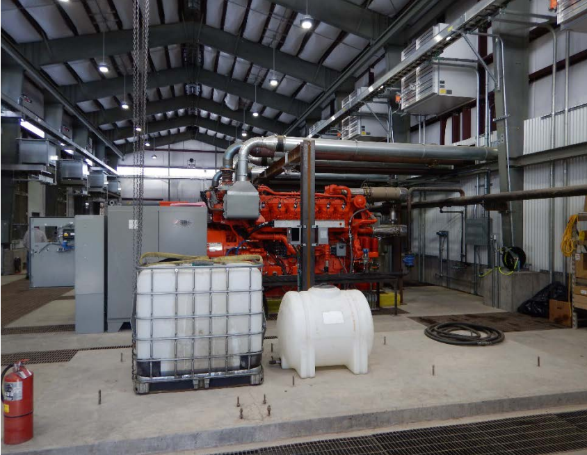
Photo #5 – View into the power generation building, from south. No accumulations of E&P waste were observed inside of this building during inspection.