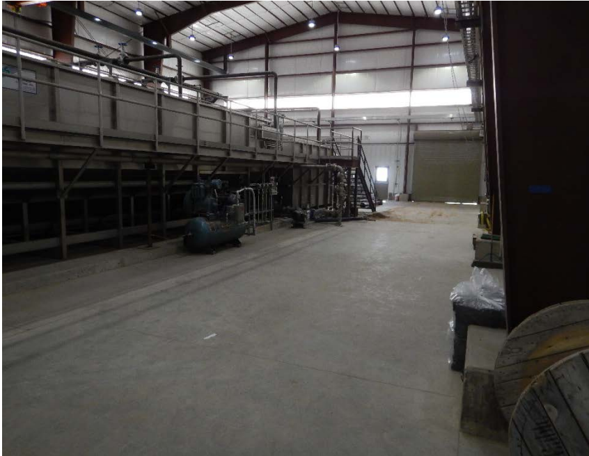
Photo #9 - View of equipment inside of DAF building. No accumulations of E&P waste were observed inside of this building during inspection.