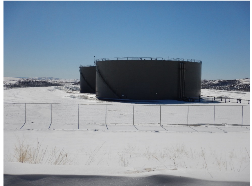
Photo #6 – View of water storage tanks inside of lined, fenced secondary containment, from north. Presence of snow on liner prevented closer inspection for liner integrity on inspection date.