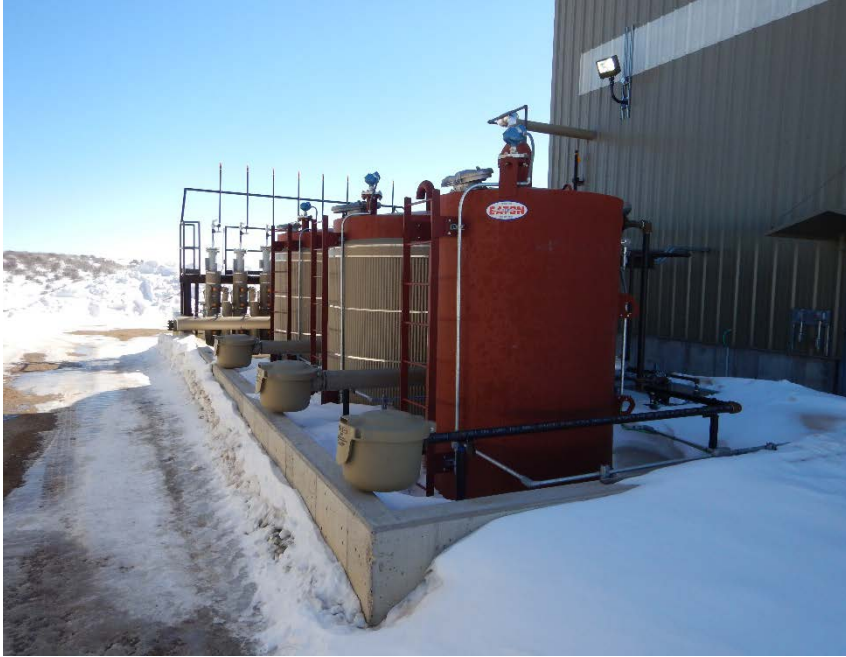
Photo #3 – Tank battery on north side of power generation building contained motor oil and engine coolant tanks inside of cement secondary containment device with loadout containment devices.