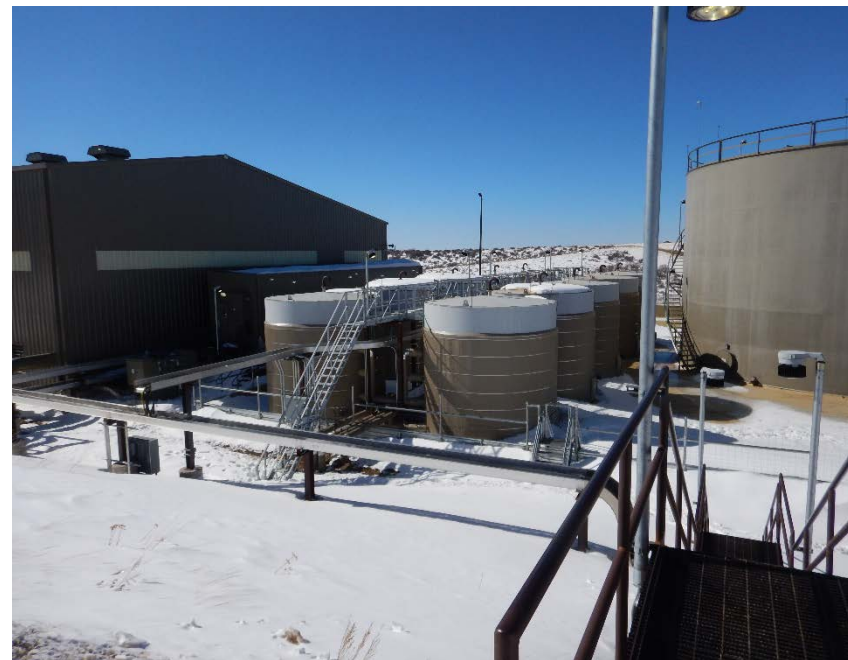
Photo #12 - View of condensate tank battery from east, looking southwest.