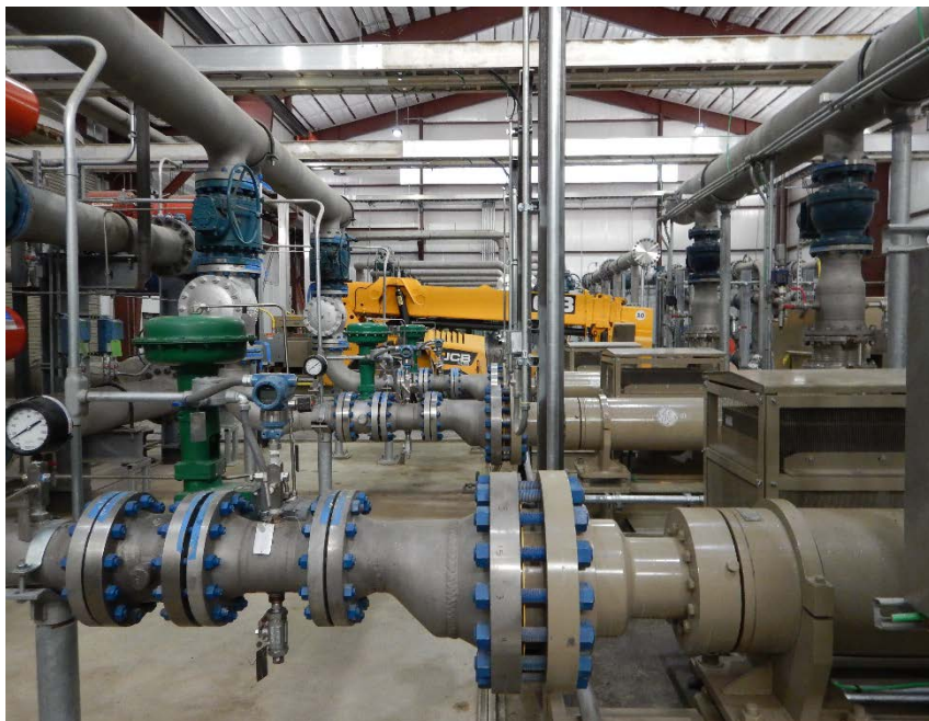
Photo #7 – View of equipment inside of pump building. No accumulations of E&P waste were observed inside of this building during inspection.