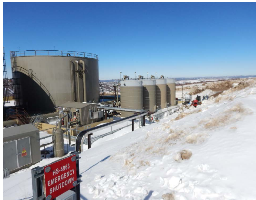
Photo #13 - View of condensate tank battery from east, looking northwest.