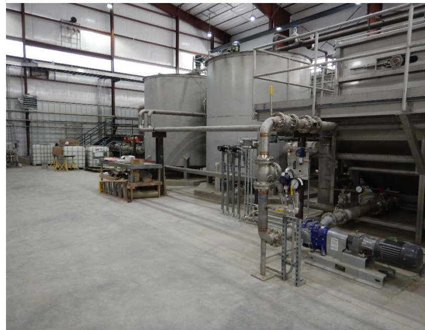
Photo #8 – View of equipment inside of DAF building. No accumulations of E&P waste were observed inside of this building during inspection.