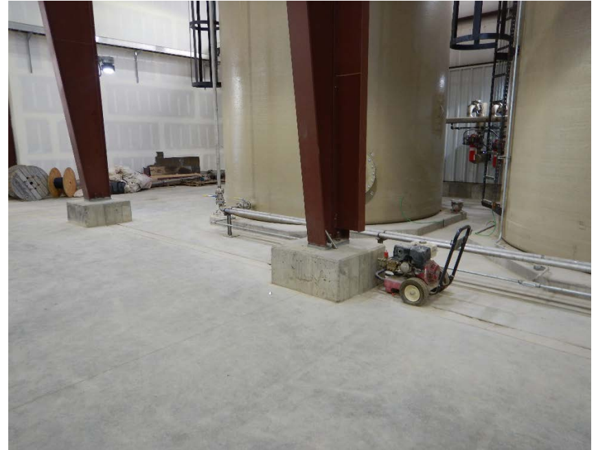
Photo #10 - View of equipment inside of DAF building. No accumulations of E&P waste were observed inside of this building during inspection.