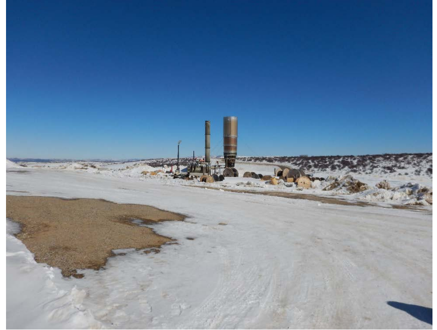
Photo #4 – ECD and unused equipment stored in northeast corner of facility.