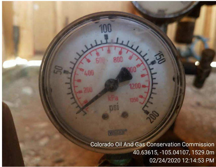
Colorado Oil And Gas Conservation Commission 40.63615, -105.04107, 1529.0m 02/24/2020 12:14:53 PM