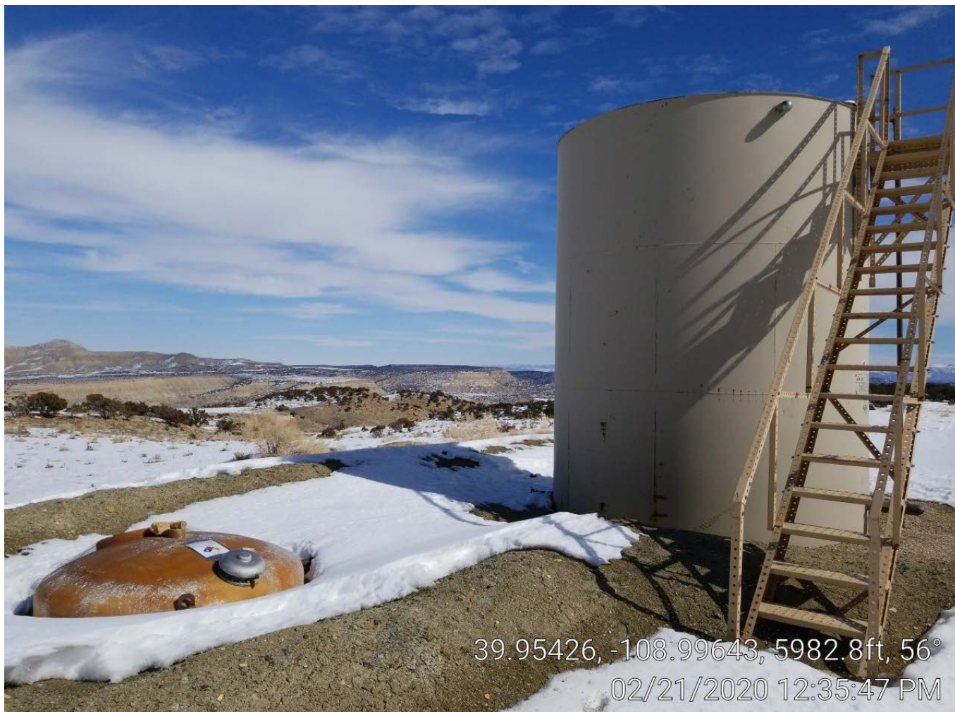
Photo 4. Tanks.