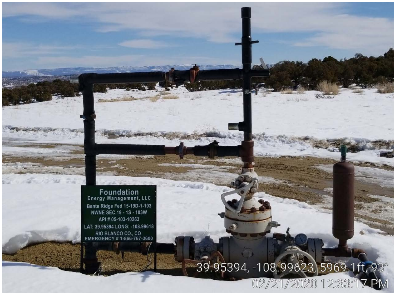
Photo 2. Well head.