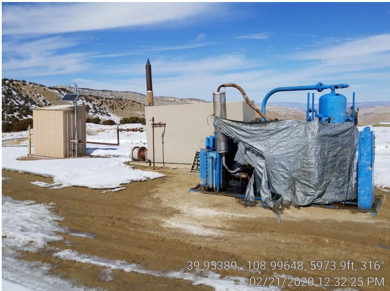
Photo 3. Compressor, separator, meter building.