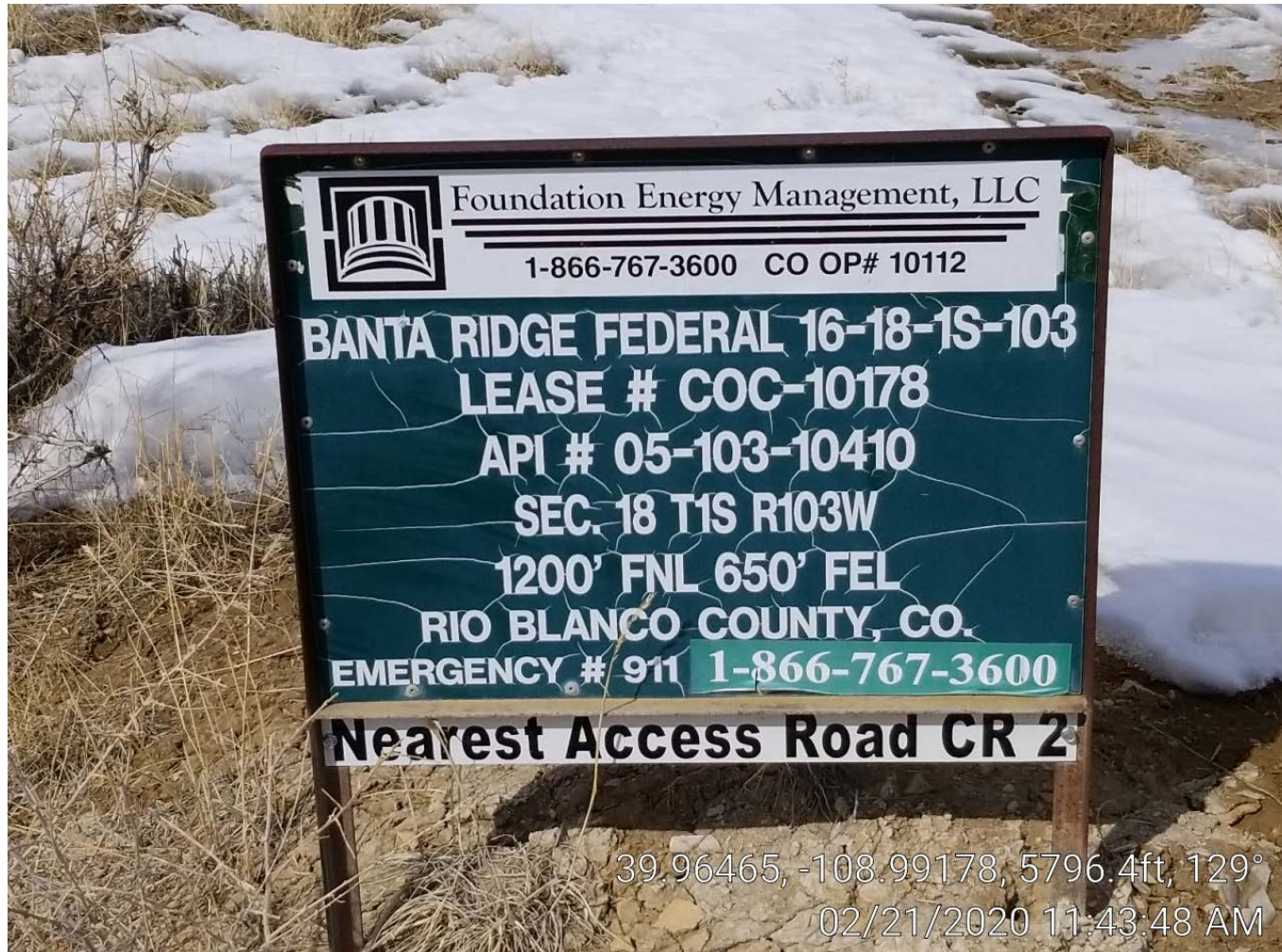
Photo 5. Battery sign.