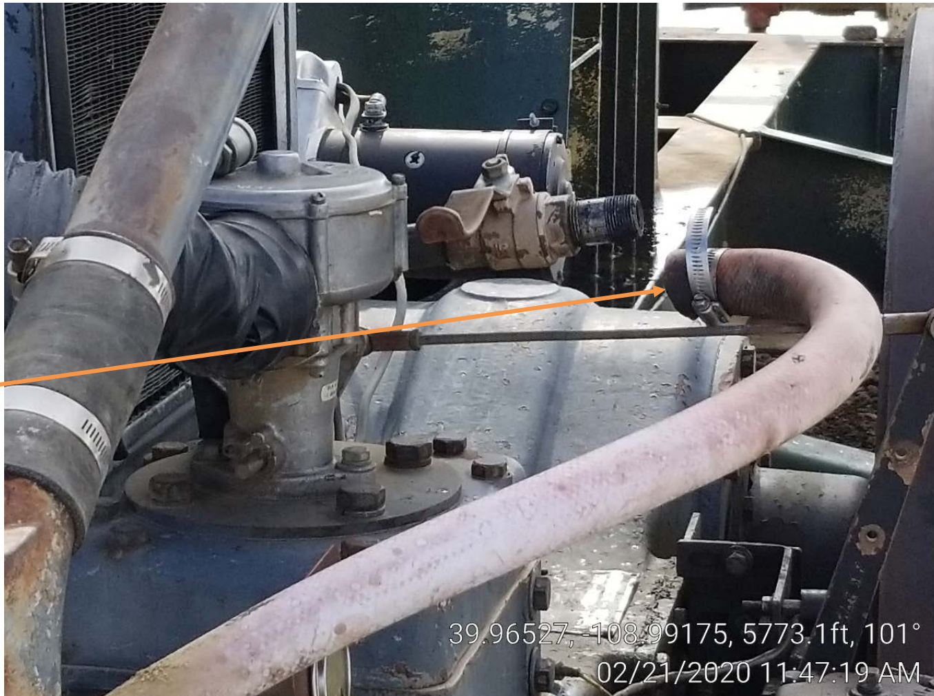
Photo 4. Gas leak at pump jack motor.