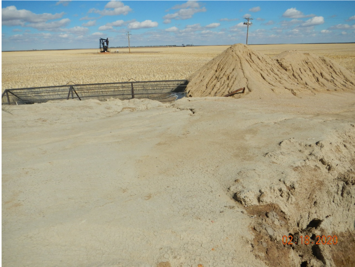
Photo # 4 – View northeast at former oil skim pit cover and soil stockpile

Location Name: – Ward and Son Operating – CO State 4 Battery – Spill ID 446492, 456489, 454306 Inspection Date: 02/18/2020