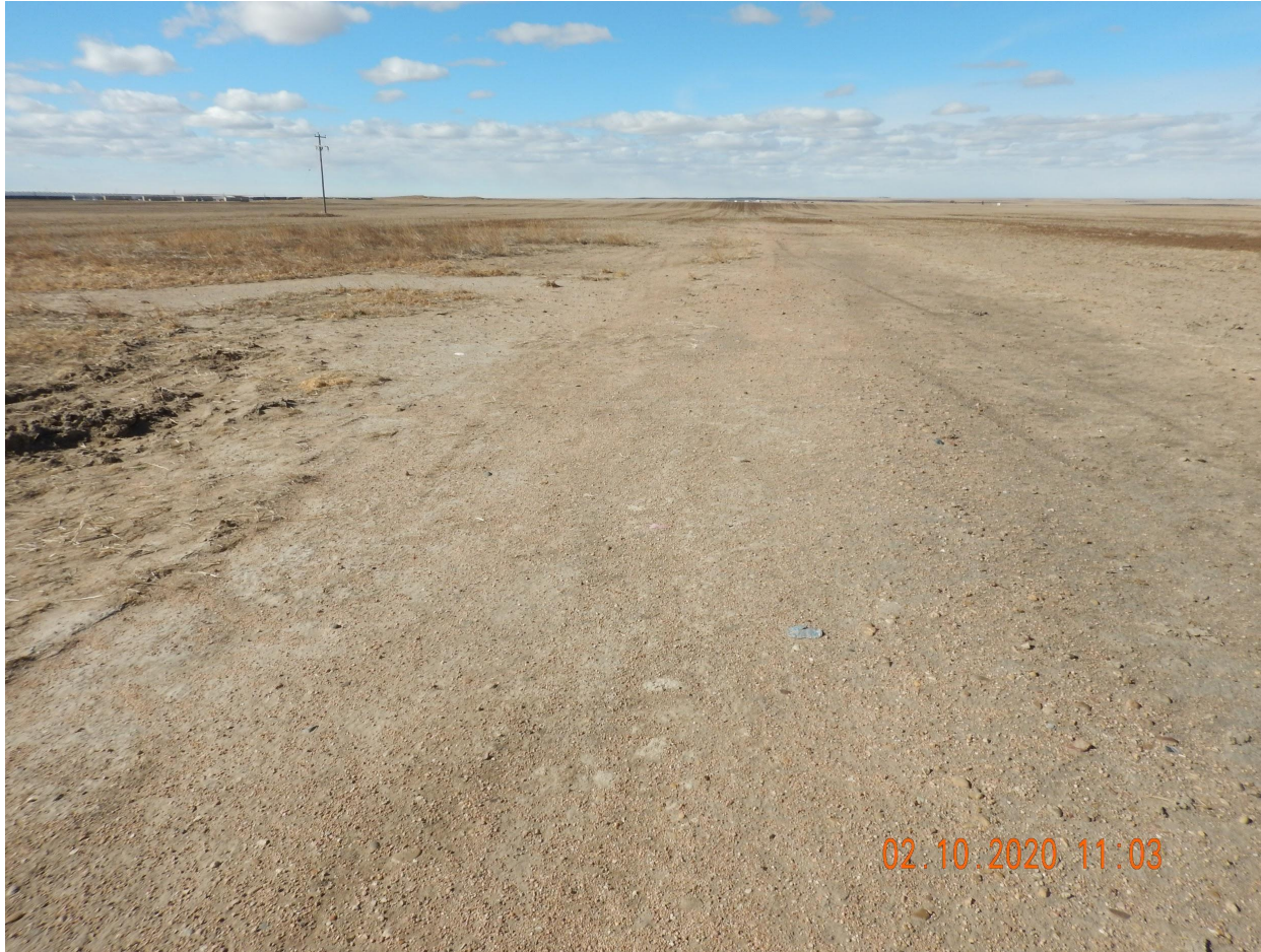
Photo 7. Photo taken from the former tank battery, facing West. Photo illustrates gravel remains along portions of the tank battery location and portions of the well location access road.