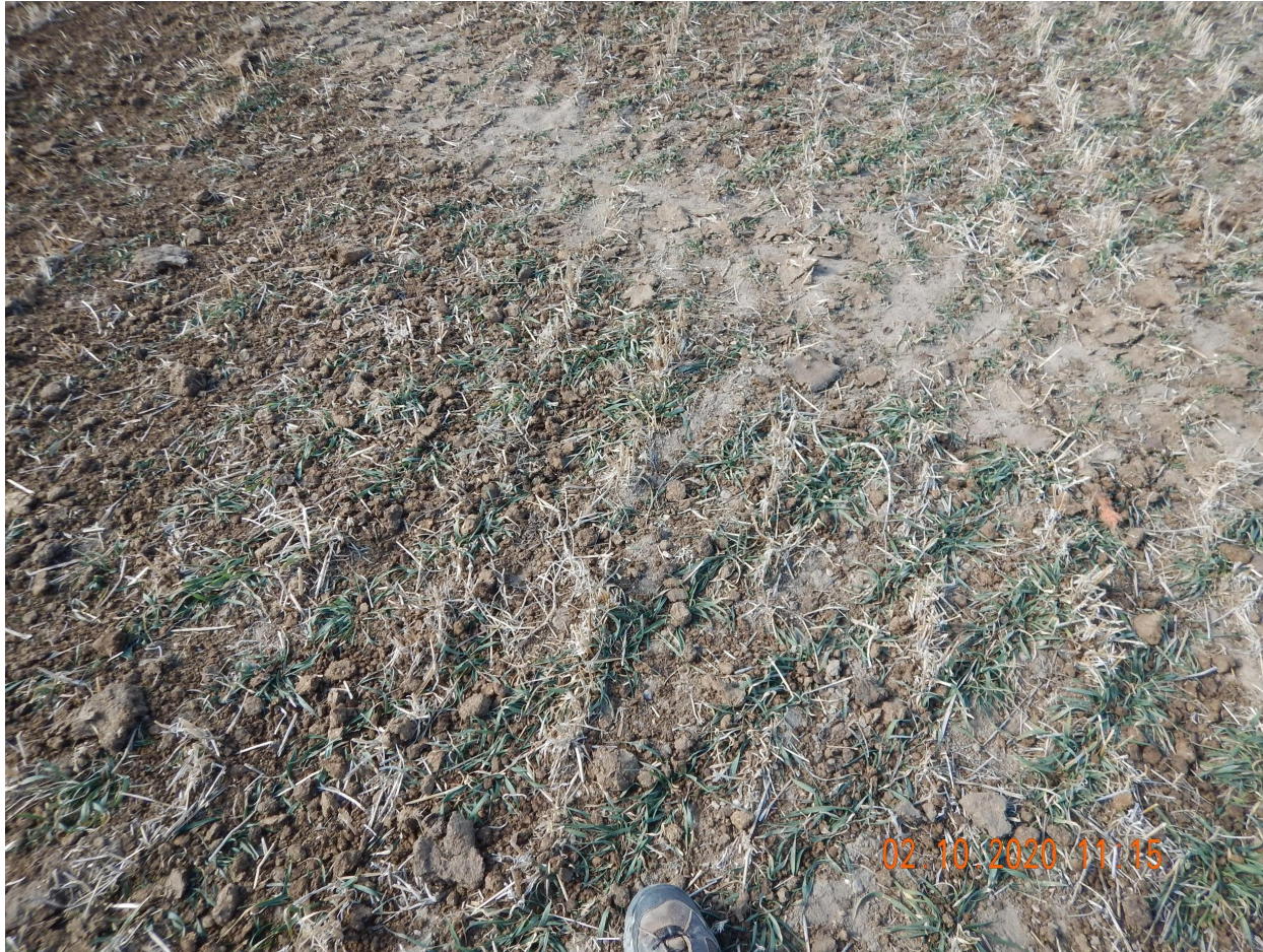
Photo 10. Reference crop photo taken south of the former tank battery. Photo illustrates drill rows with successful germination of winter wheat.