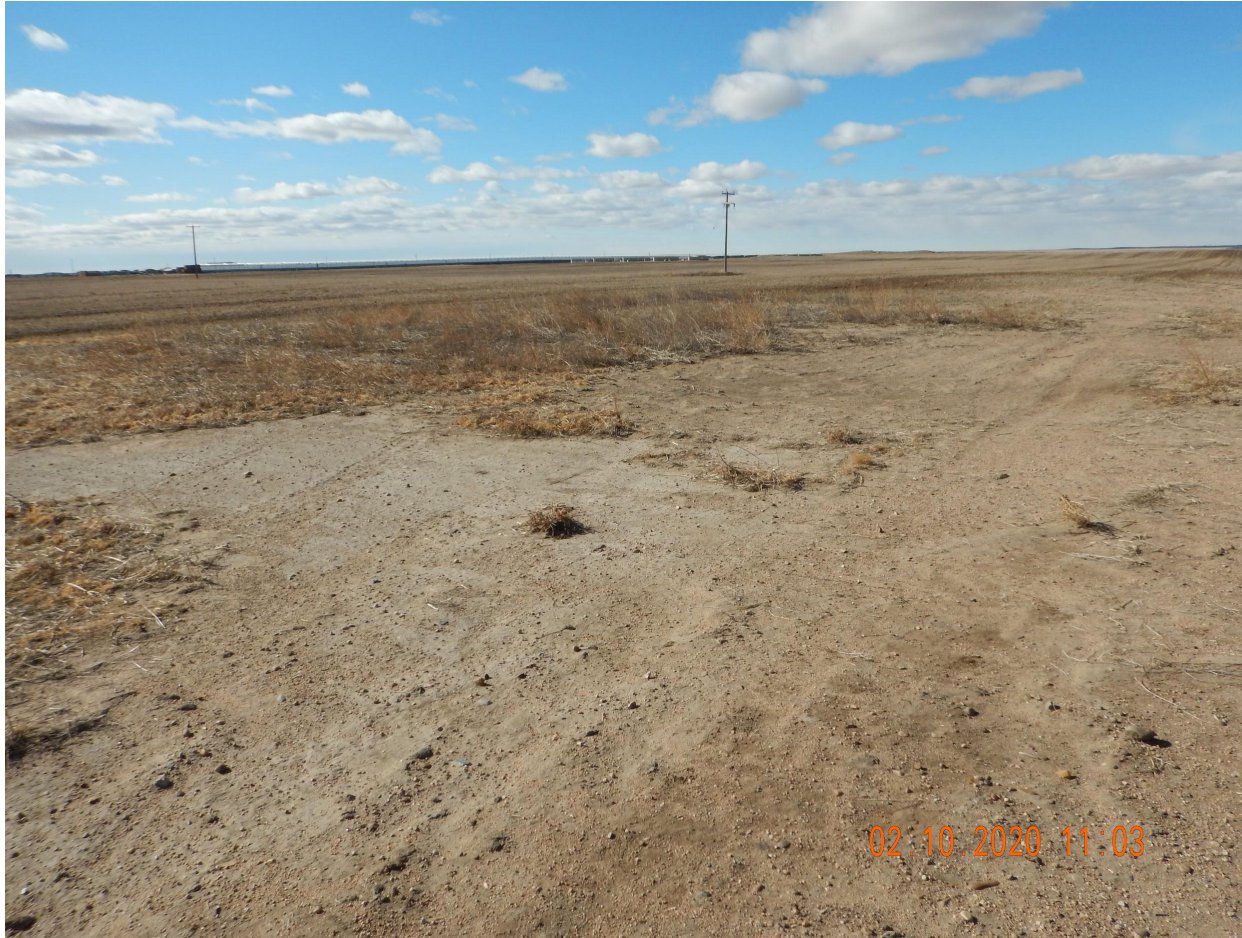
Photo 8. Photo taken from the former tank battery, facing Southwest. This appears to be where a former pit (#116196) was located- see Photo 2. Germination of winter wheat was not observed within this portion.