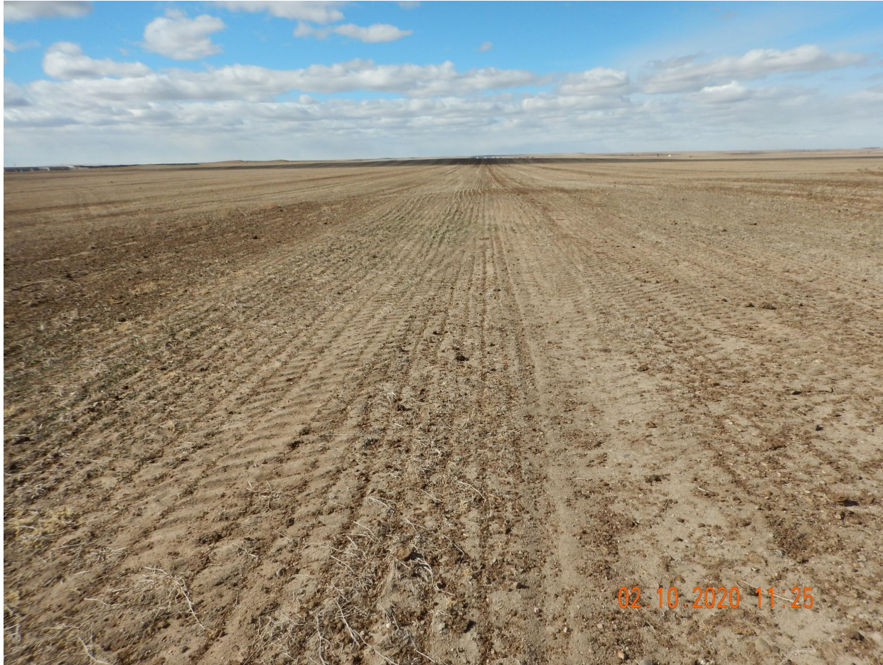
Photo 6. Photo taken from the former well location, facing West. Photo illustrates the one electrical power pole shown in Photo 2 (orange circle) has been removed.

Note: Reference crop areas appear to be planted in winter wheat. Germination of winter wheat was not observed within portions of the tank battery, pit area, portions of the well location access road and well location.