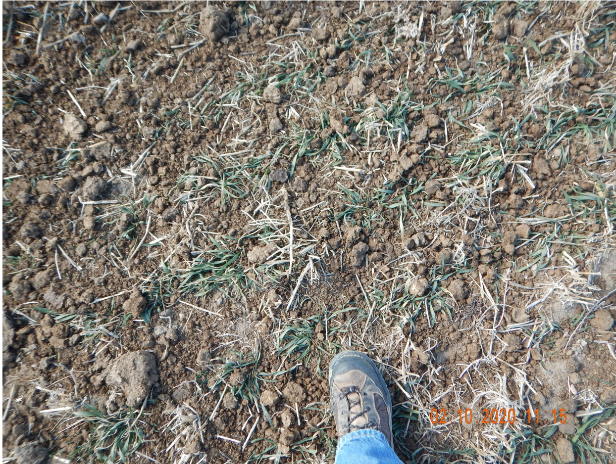
Photo 11. Close up reference crop photo taken south of the former tank battery.