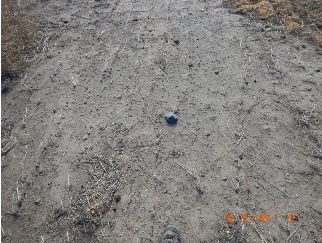
Photo 9. Photo taken from the former tank battery/pit area. Photo illustrates drill rows attempting to seed into a portion of the former tank battery/pit area with no germination success.