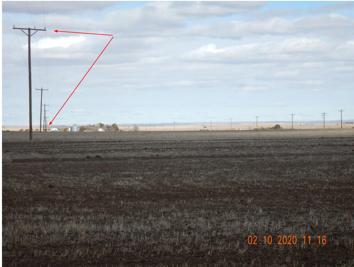
Photo 4. Photo taken from a portion of the former well location access road, facing North. Photo illustrates the power line continuing to the north, not terminating at the well location.