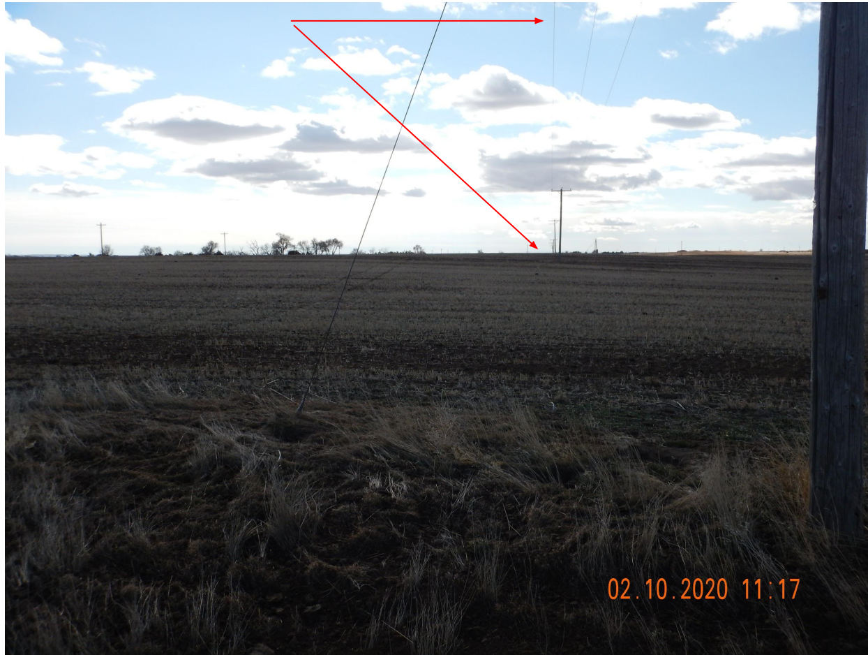
Photo 5. Photo taken from a portion of the former well location access road, facing South. Photo illustrates the power line continuing to the south, not terminating at the well location.