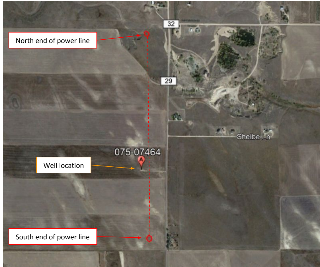
Photo 1. Google Earth aerial imagery taken 10/15/2015 illustrating a power line within Township 8 North, Range 53 West, Section 20. Photo illustrates the power line does not terminate at the well location. See Photo 2 for a close up of the well location.