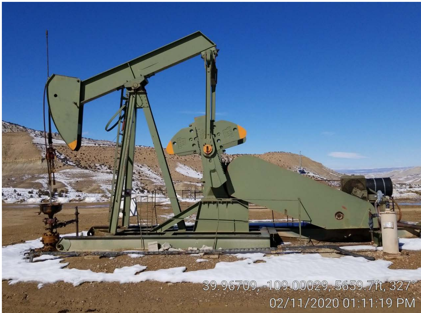
Photo 2. Pump jack.