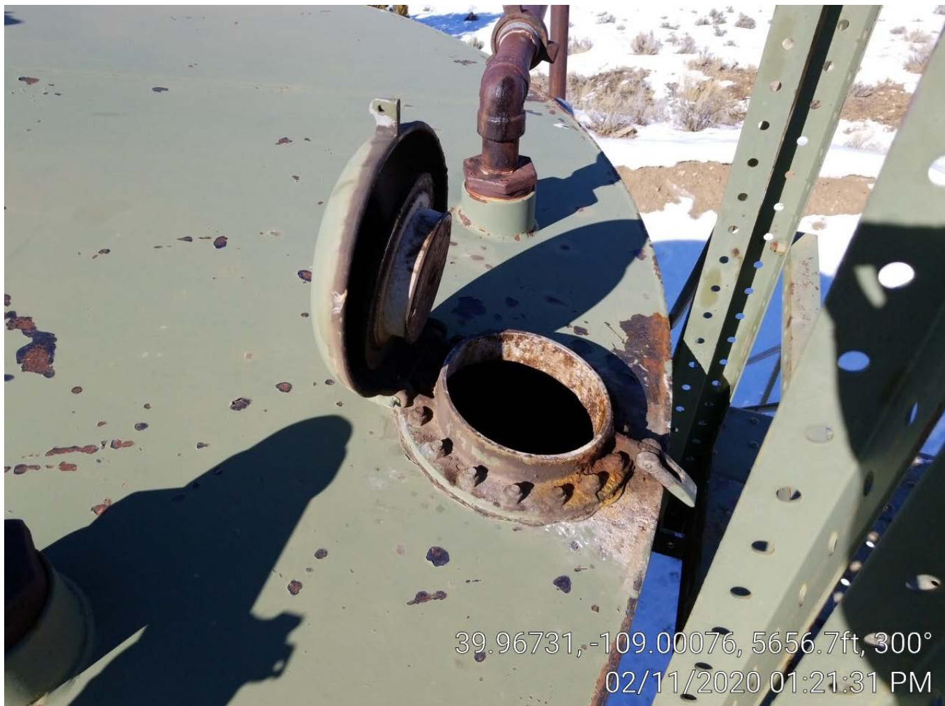
Photo 6. Open hatch on water tank.