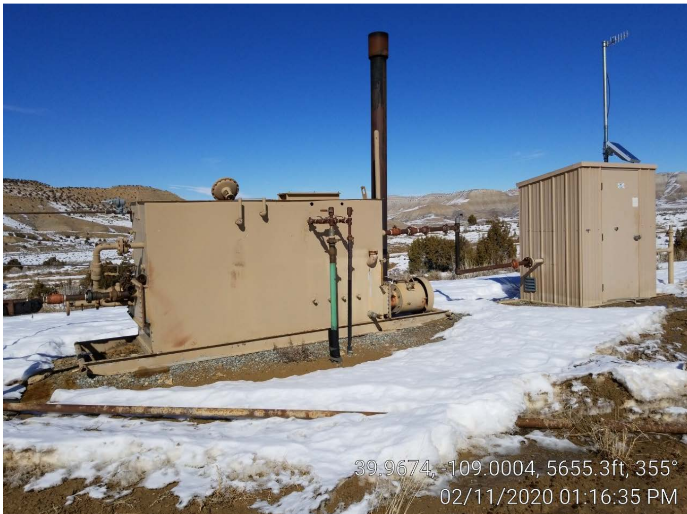
Photo 3. Separator & meter building.