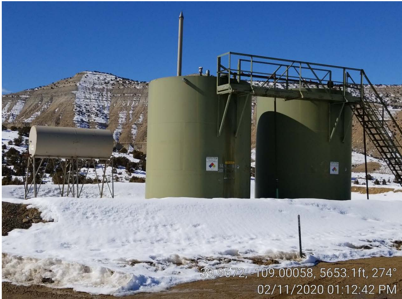
Photo 4. Tanks.