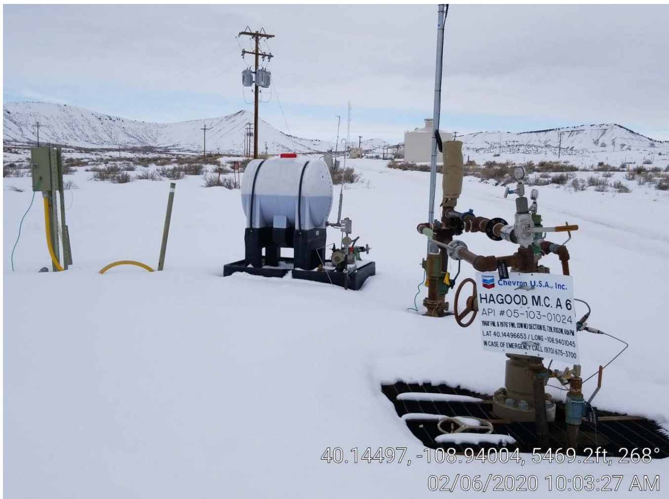
Photo 1. Location.

Hagood M.C. A 6 API: 05-103-01024 Inspection: 679707282