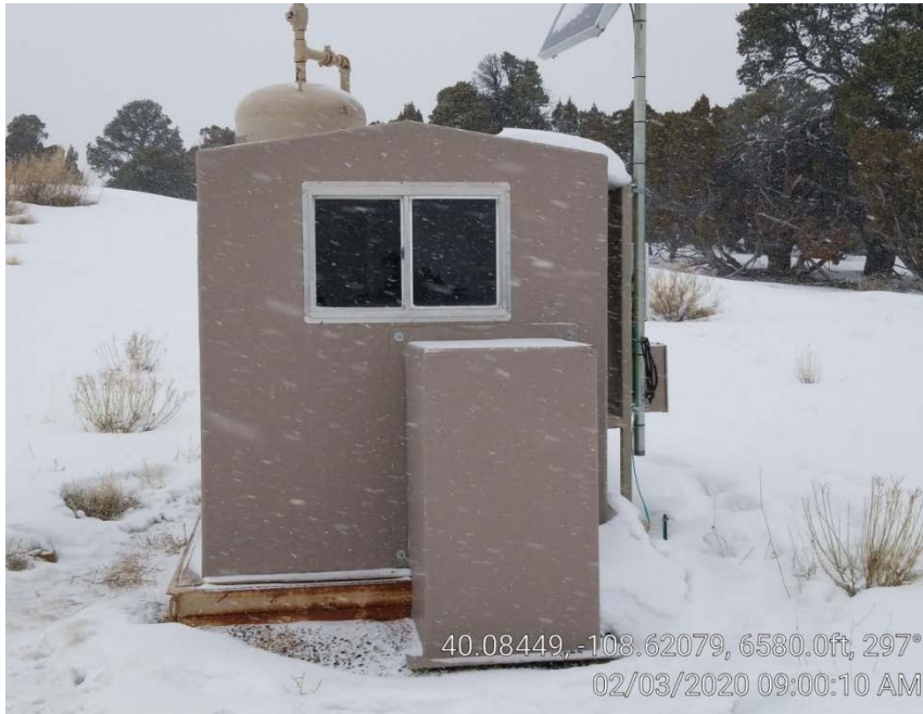
Photo 4. Vegetation next to meter building on 2-3-2020.