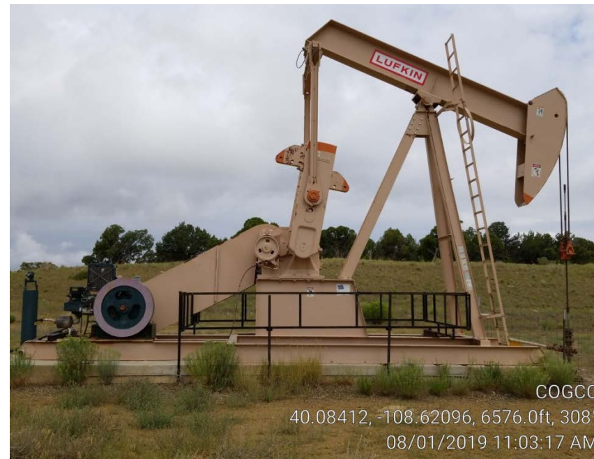
Photo 3. Vegetation next to pump jack on 8-1-2019.