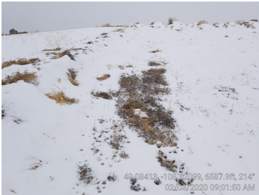
Photo 6. Weed debris.