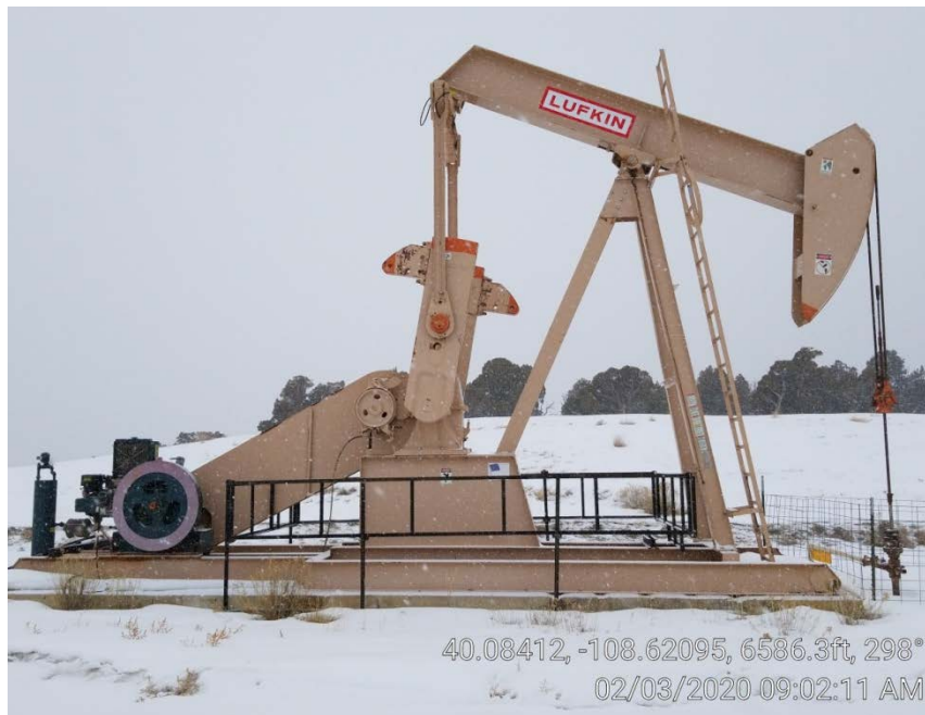
Photo 2. Vegetation next to pump jack on 2-3-2020.