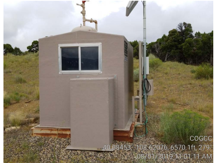
Photo 5. Vegetation next to meter building on 8-1-2019.