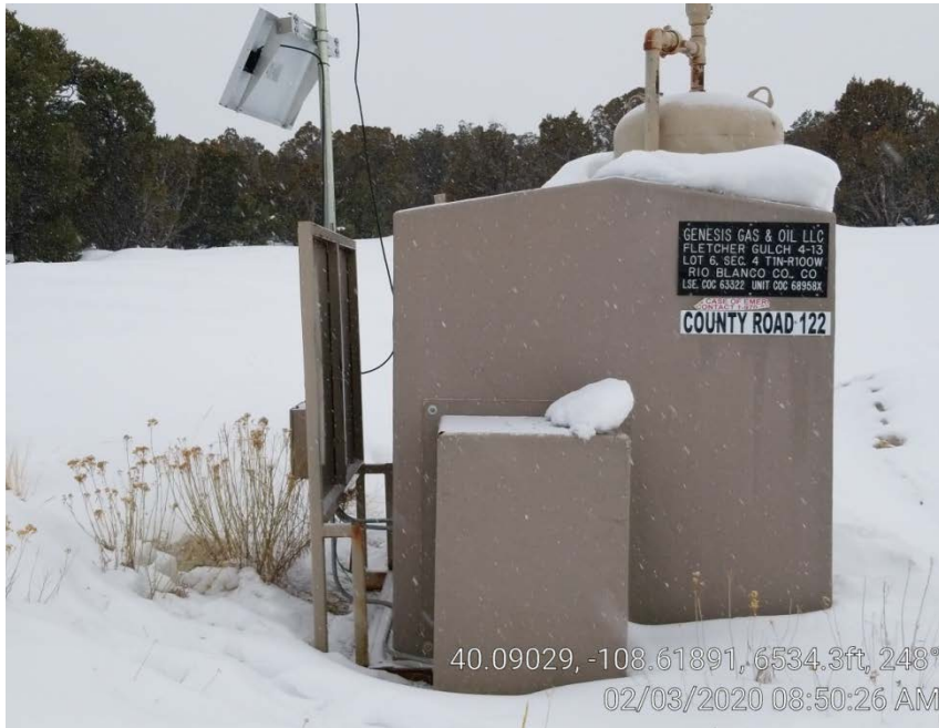
Photo 2. Vegetation next to meter building on 2-3-2020.