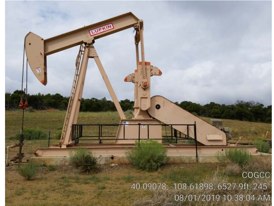
Photo 5. Vegetation next to pump jack on 8-1-2019.