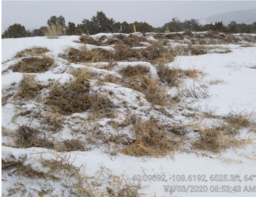
Photo 6. Weed debris.