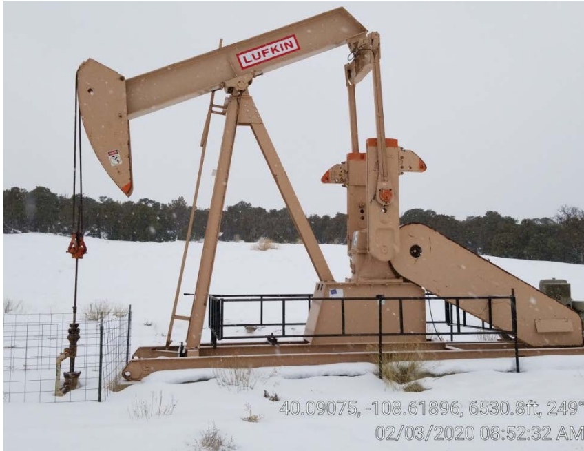
Photo 4. Vegetation next to pump jack on 2-3-2020.

Fletcher Gulch 4-13 API: 05-103-10895 Inspection: 679707201