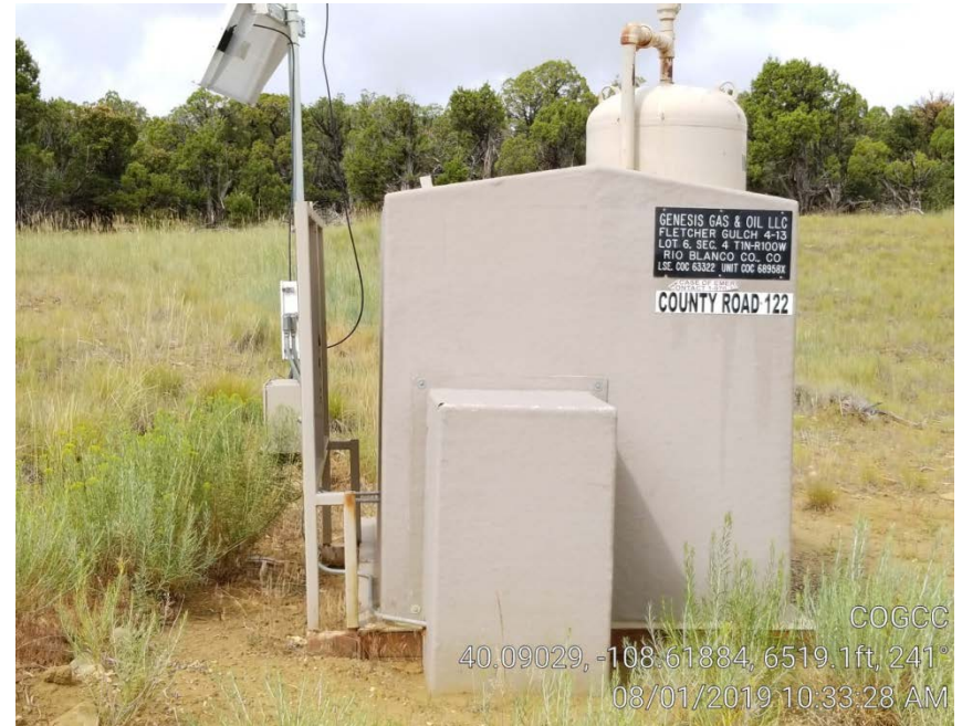
Photo 3. Vegetation next to meter building on 8-1-2019.