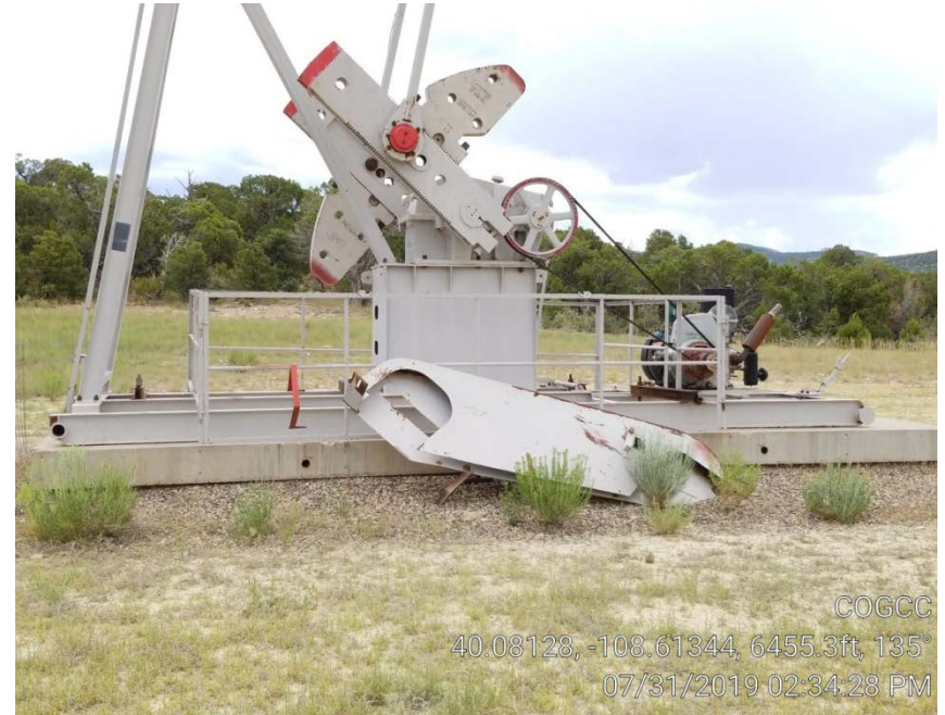
Photo 3. Vegetation next to pump jack on 7-31-2019.