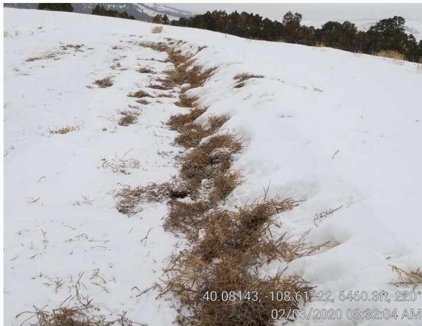
Photo 6. Weed debris.

Fletcher Gulch 4-44 API: 05-103-10890 Inspection: 679707197