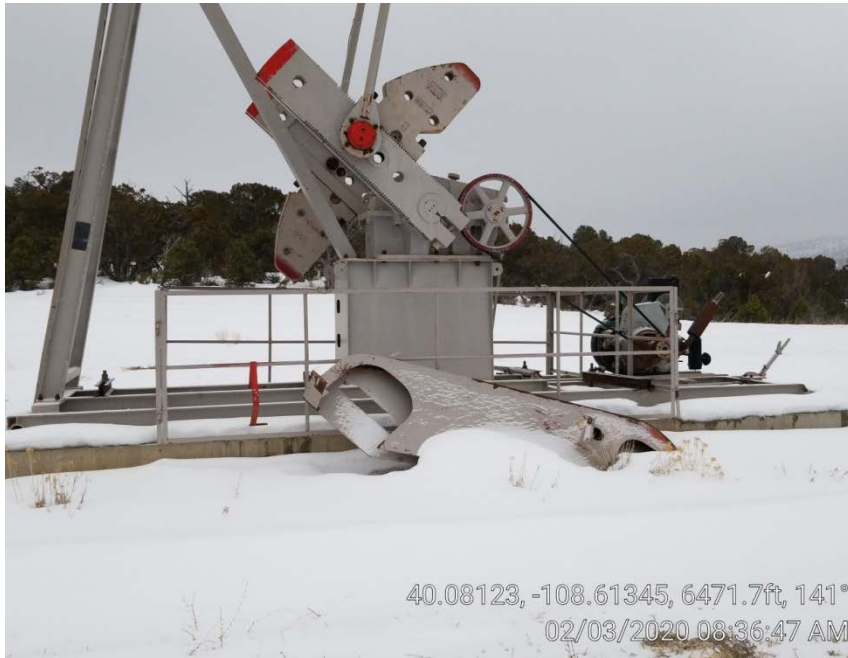
Photo 2. Vegetation next to pump jack on 2-3-2020.

Fletcher Gulch 4-44 API: 05-103-10890 Inspection: 679707197