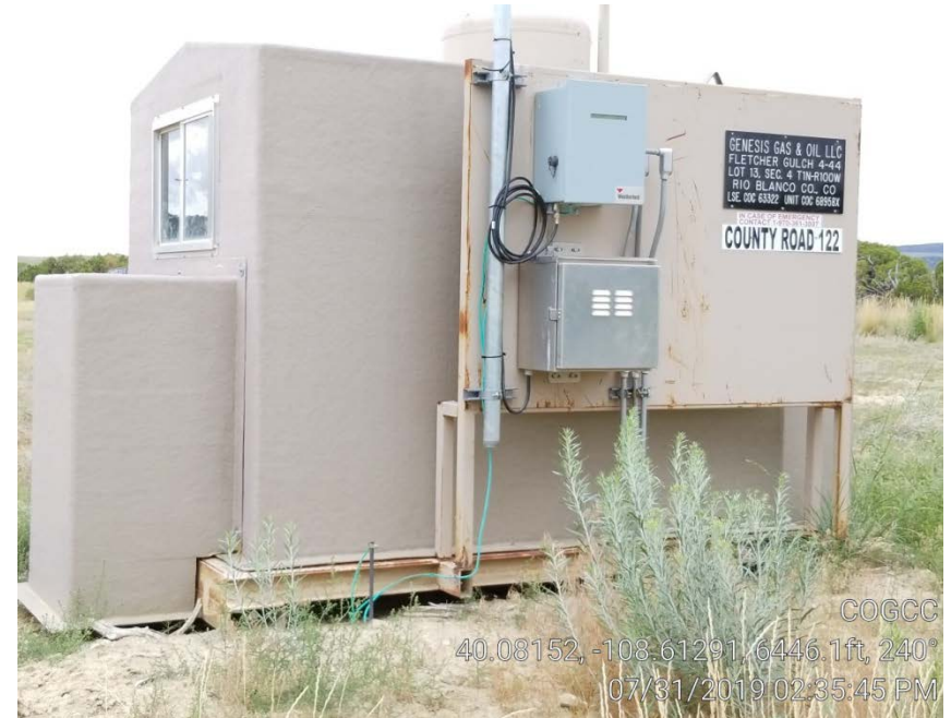
Photo 5. Vegetation next to meter building on 7-31-2019.