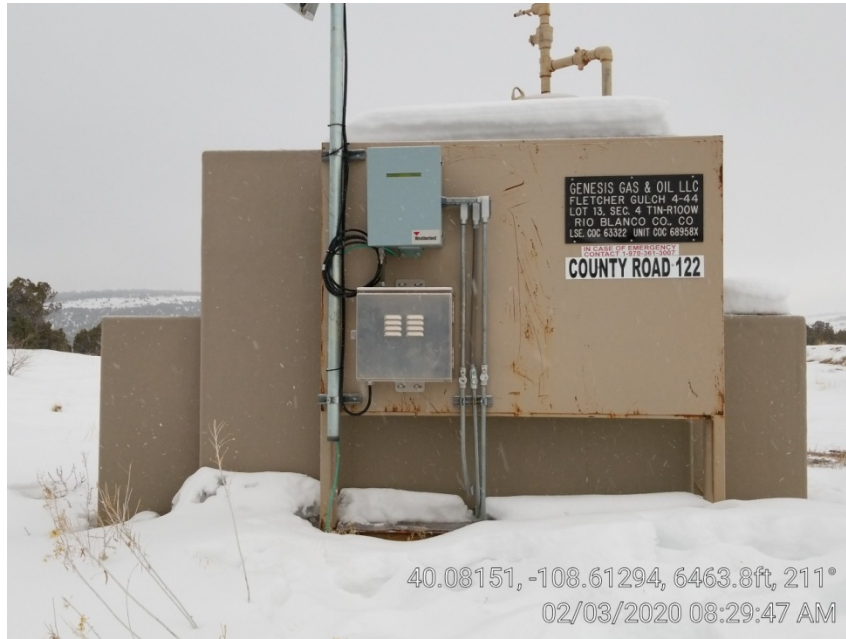
Photo 4. Vegetation next to meter building on 2-3-2020.