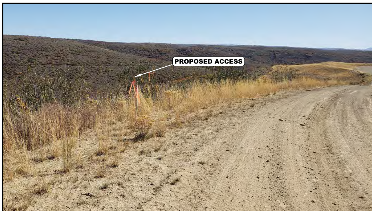
PHOTO: VIEW OF PROPOSED ACCESS