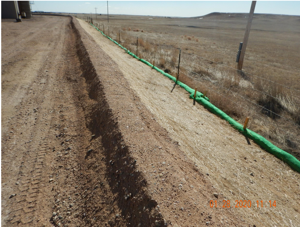
Photo 2. Photo taken from the western location, facing Southeast. See comments under Photo 1.