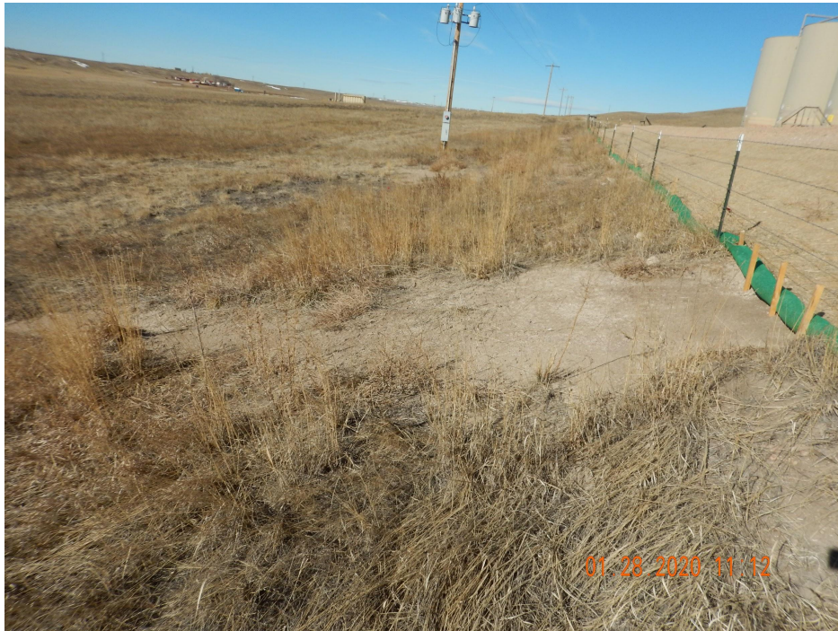
Photo 6. Photo taken along the western perimeter of location, facing Northwest. See comments under Photo 4.