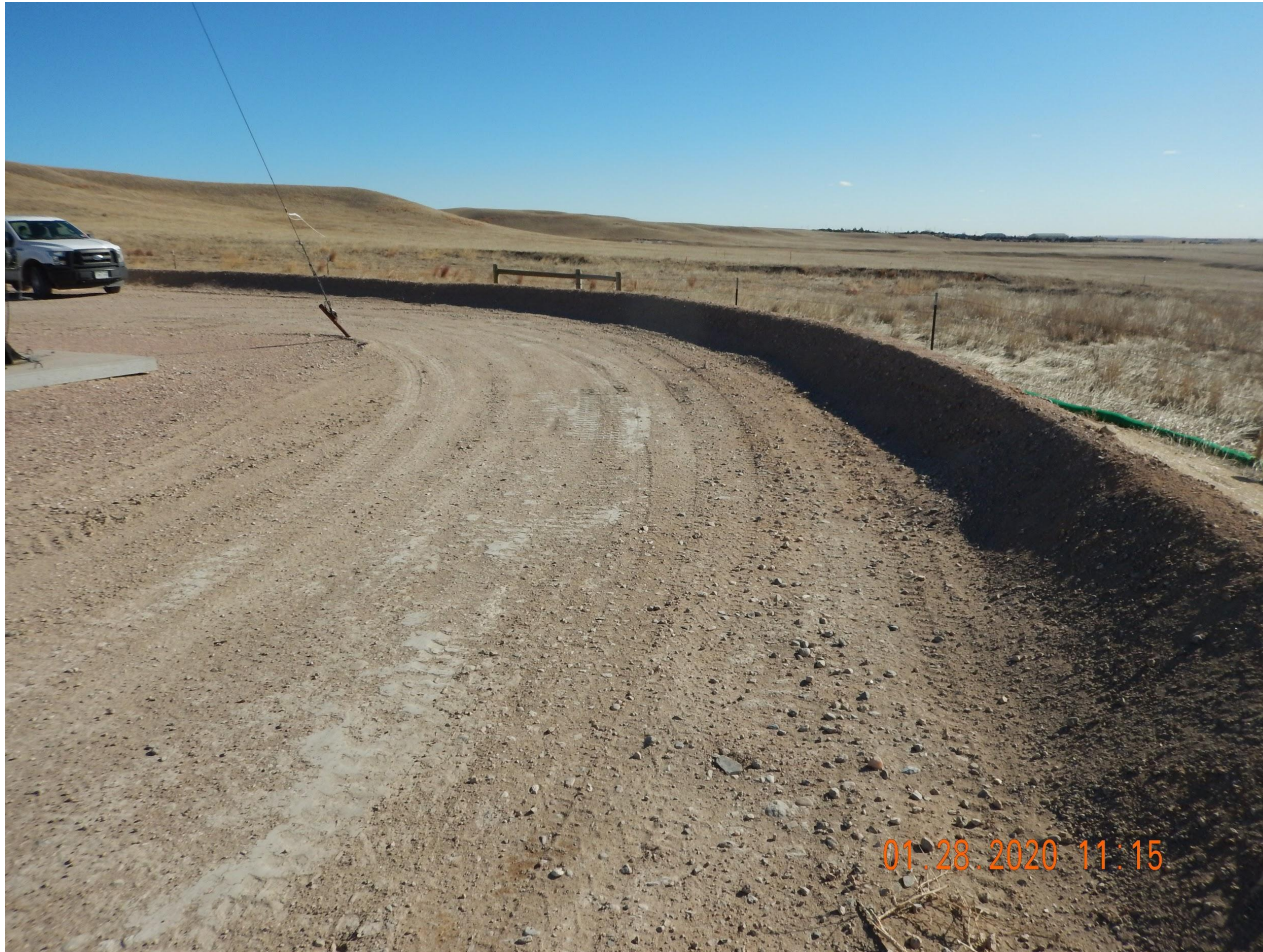
Photo 3. Photo taken from the southwestern location, facing Southeast. See comments under Photo 1.