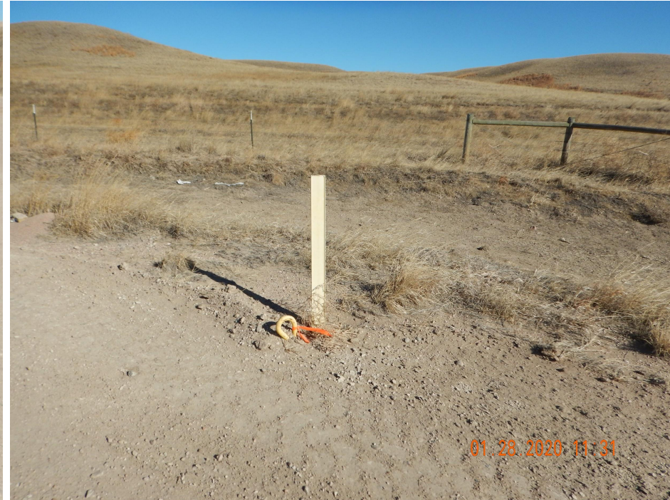
Photo 10. Photo taken from the southeastern guy line anchor, facing Northeast. Photo illustrates this guy line anchor is sufficiently marked per Rule 1003.a.