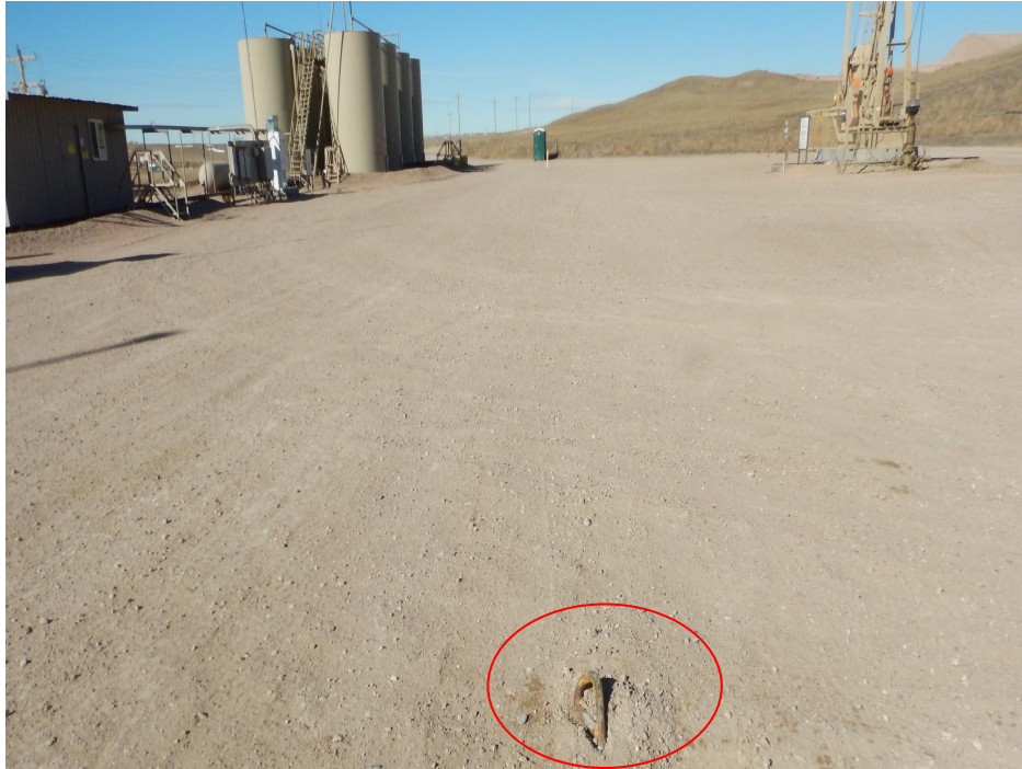
Photo 9. Photo taken from the southwestern guy line anchor, facing North. Operator shall properly mark anchor per Rule 1003.a.