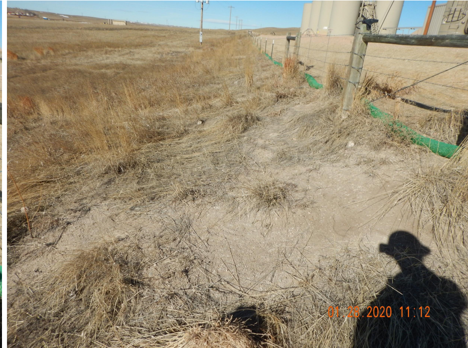
Photo 5. Photo taken from the southwestern perimeter of location, facing Northwest. See comments under Photo 4.