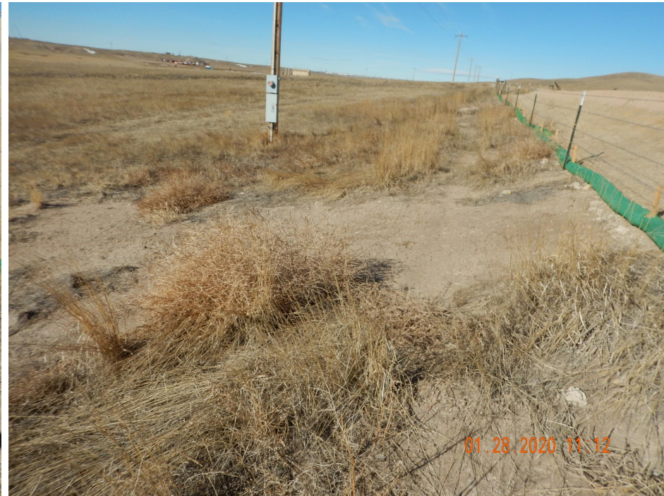
Photo 7. Photo taken along the western perimeter of location, facing Northwest. See comments under Photo 4.