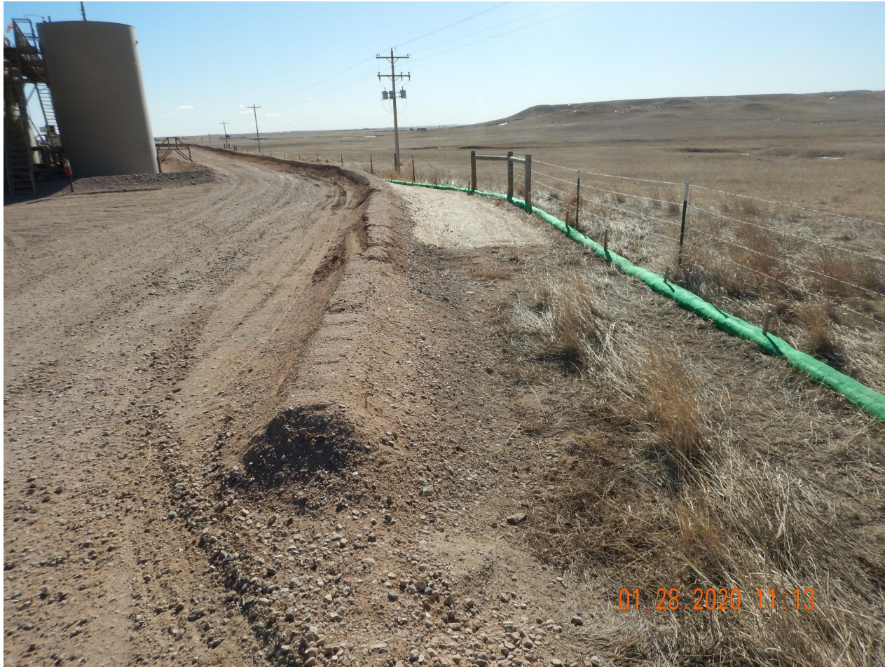
Photo 1. Photo taken from the northwestern location, facing Southeast. Photo illustrates Operator has installed additional BMPs (stabilized berm, erosion control blankets and wattles) along the western perimeter of the location in response to the previous corrective action inspection.