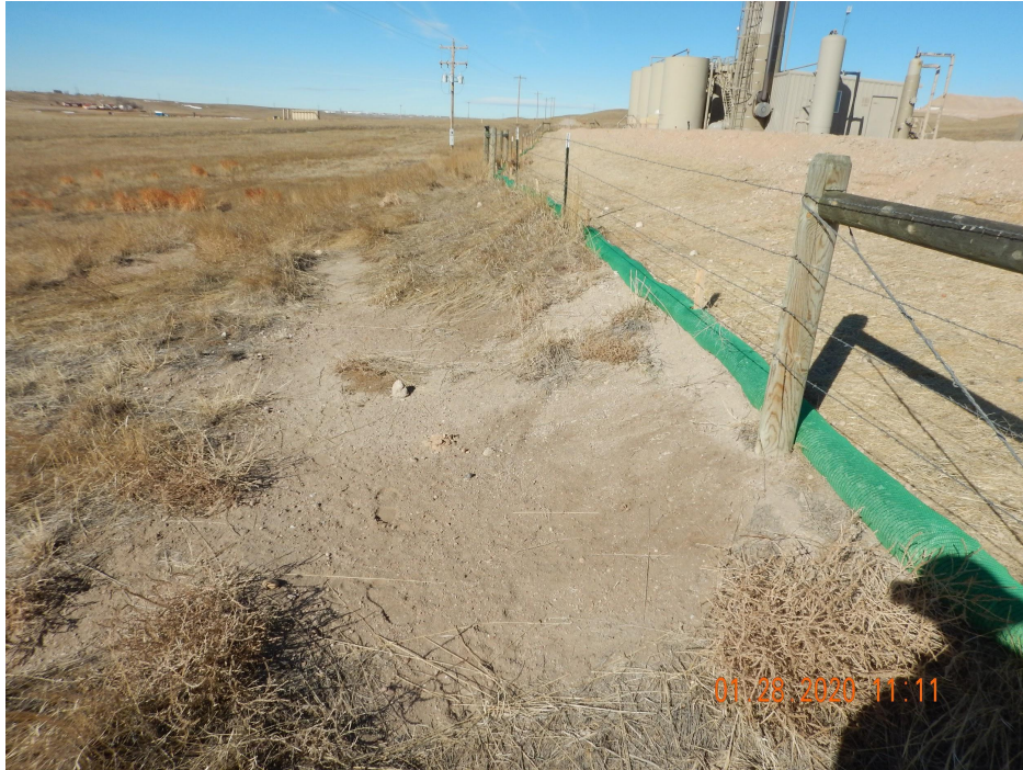
Photo 4. Photo taken from the southwestern perimeter of location, facing Northwest. Photo illustrates Operator has not yet performed reclamation activities associated with stormwater erosion degrading vegetation off location. Operator will be responsible for reclaiming this disturbance and should further reclamation activities the next available seeding opportunity.