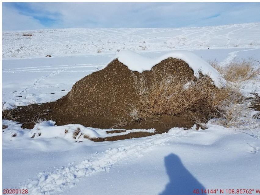
Photo 7: Photo of gravel pile stored on Location west of the wells.