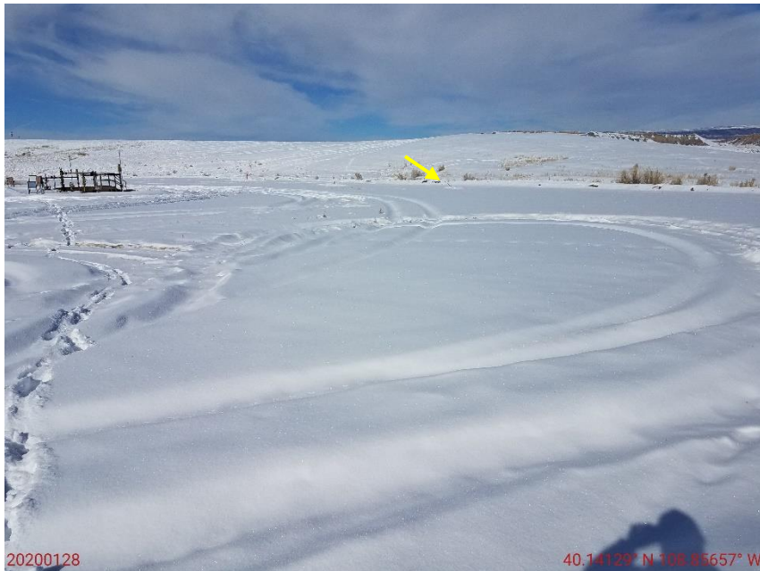
Photo 5: See comments under photo 3. Arrow shows easternmost anchor