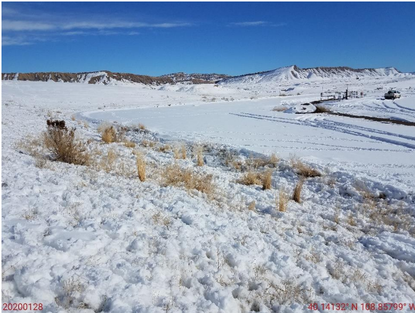
Photo 9: Photo taken from the west end of the location, facing northeast. Photo 9-10 provide an overview of the location from northeast, to southeast.

Photo shows areas of the production area beyond the anchors that do not appear to be reasonably needed for production activities, and needs to be reclaimed in accordance with Rule 1003.b.