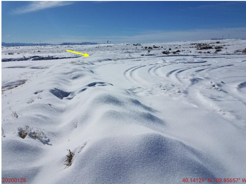
Photo 3: Photo taken from the east end of the location, facing south. Photos 3-6 provide an overview of the Location from south, southwest, northwest to north. Photos also show areas of the production area beyond the anchors that do not appear to be reasonably needed for production activities, and needs to be reclaimed in accordance with Rule 1003.b. Photo also shows soil stockpile on the southeast corner of the Location.