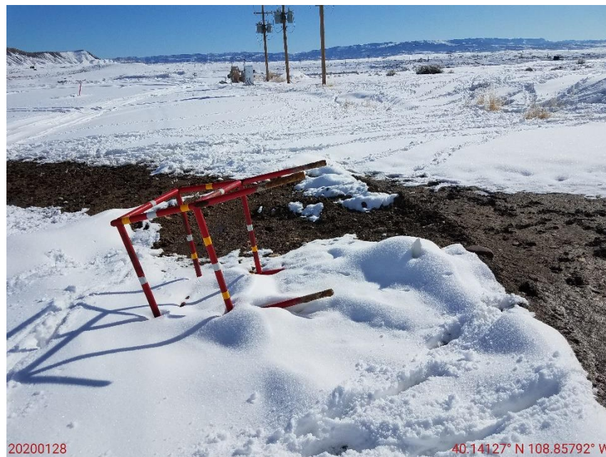
Photo 8: Photo of barrier in disrepair on the northwest end of the location.