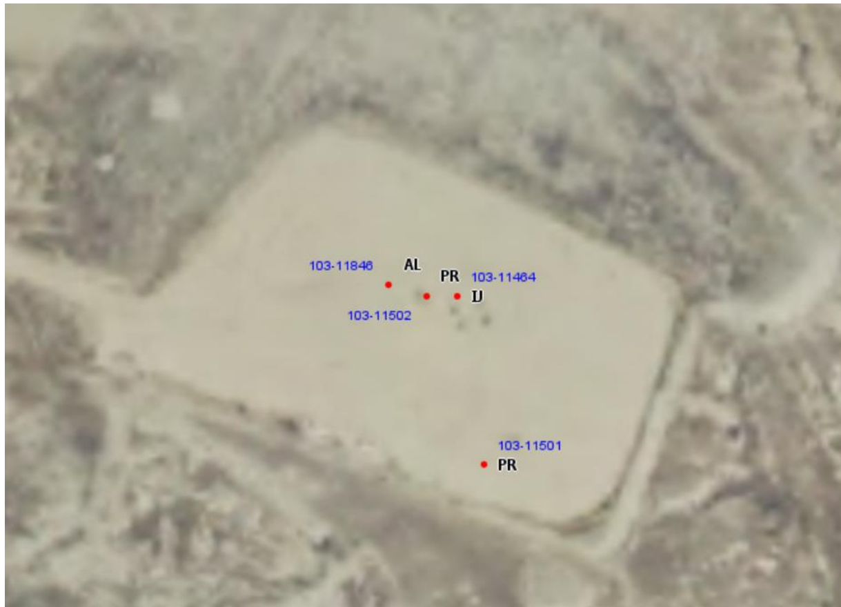
Photo 11: COGIS aerial imagery of wells on Location. Photo shows “As drilled” location for API 103-11501 is incorrect.