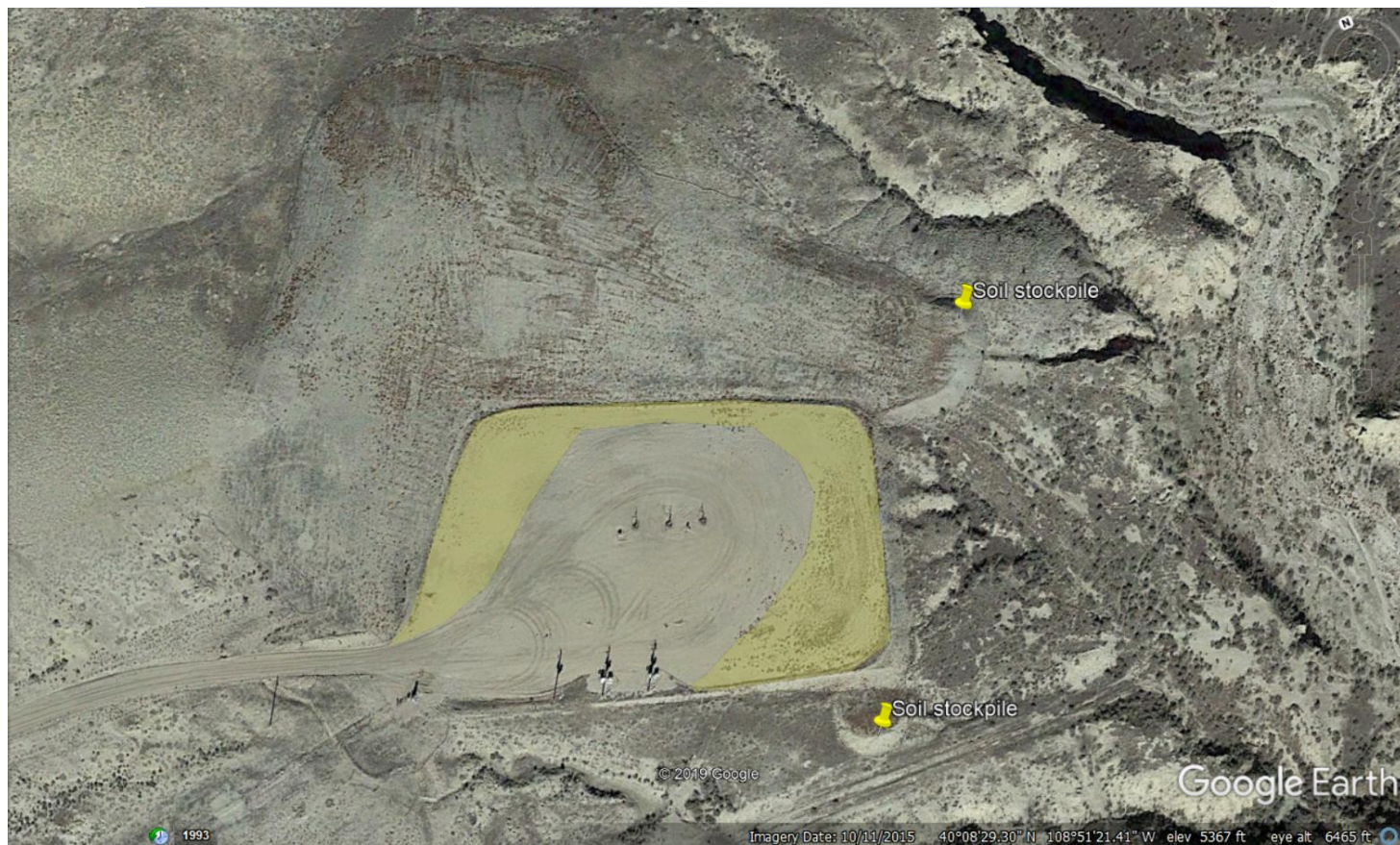
Photo 13: 2015 Google Earth aerial imagery; most current google imagery. Photo shows the soil stockpile on the northeast and southeast ends of the Location. Photo also shows approximate areas of the current production area beyond the anchors that do not appear to be reasonably needed for production activities