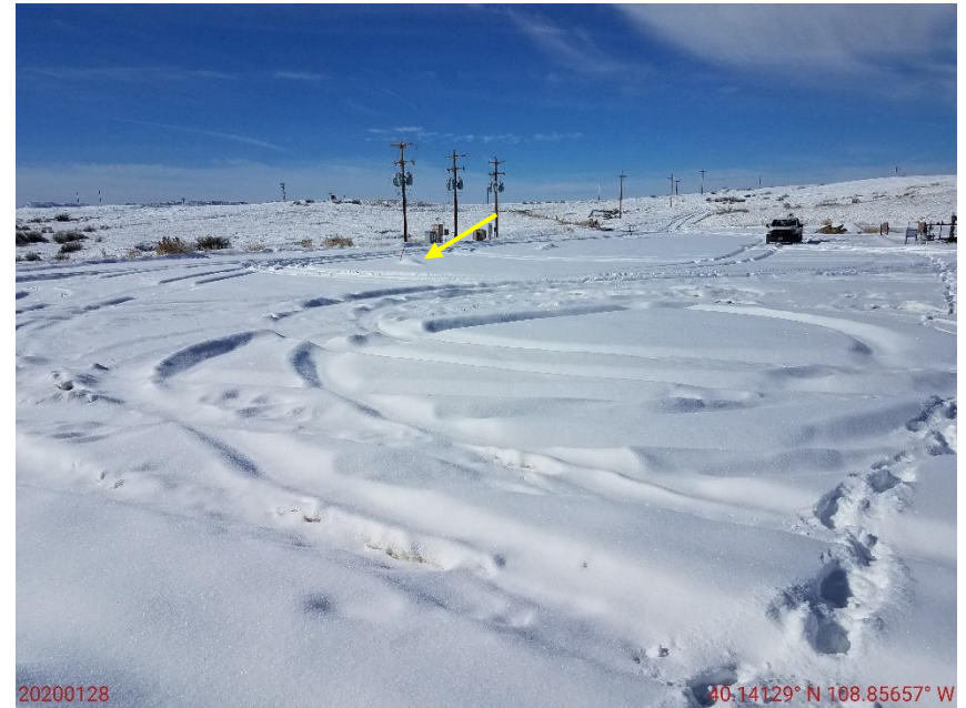
Photo 4: See comments under photo 3. Arrow shows easternmost anchor.