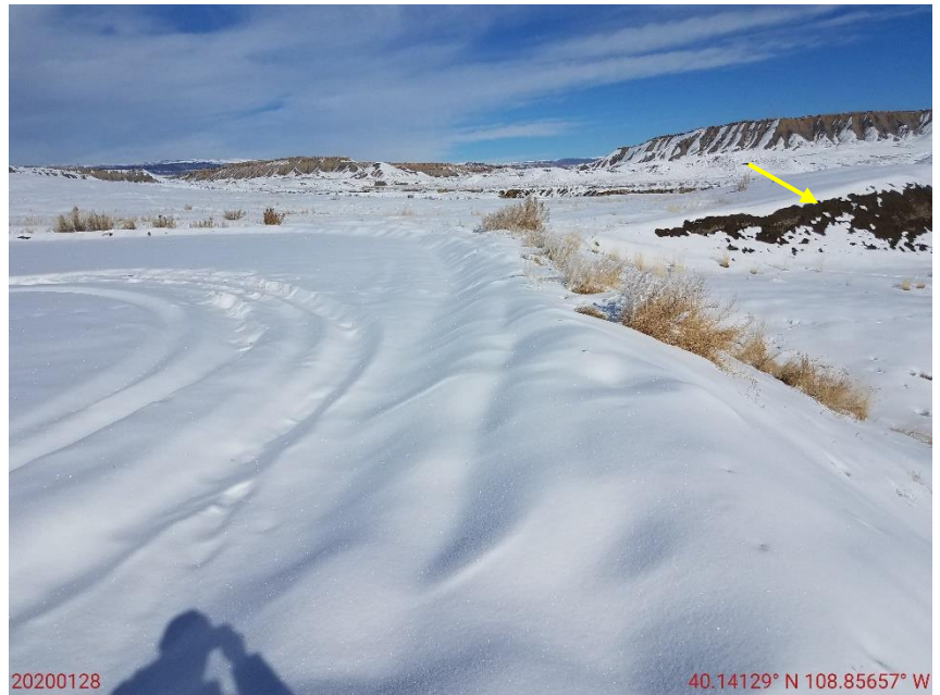
Photo 6: See comments under photo 3. Photo also shows soil stockpile on the northeast end of the Location. Soil stockpile appears exposed and unstabilized on the visible slopes.