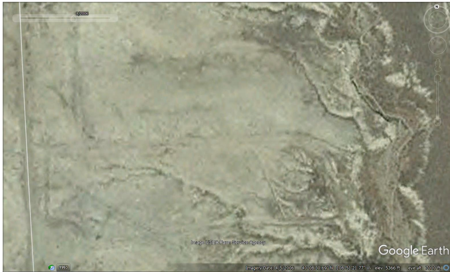
Photo 12: 2006 Google Earth aerial imagery. Photo shows Location prior to the Location's O&G disturbance.