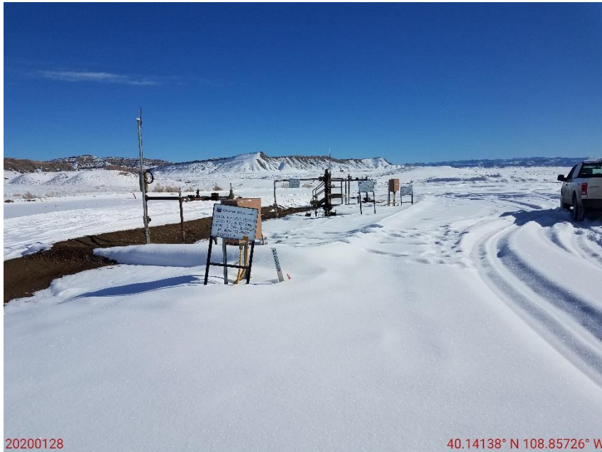
Photo 1: Photo taken from the west end of the active wells, facing east. Photo shows all 3 of the active wells have been drilled in proximity of one another. 4 th well on location "AL"; unable to find evidence that well was drilled.