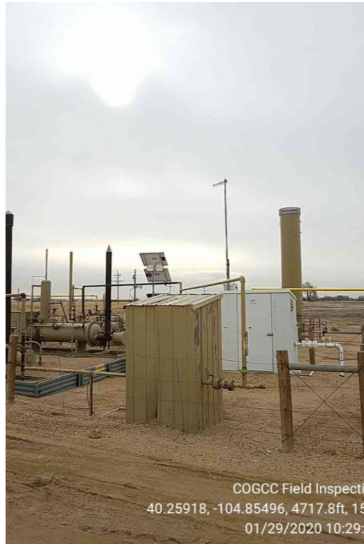
Photo 1 Battery

COGCC Field Inspection 40.25918, -104.85496, 4717.8ft, 156 01/29/2020 10:29:0