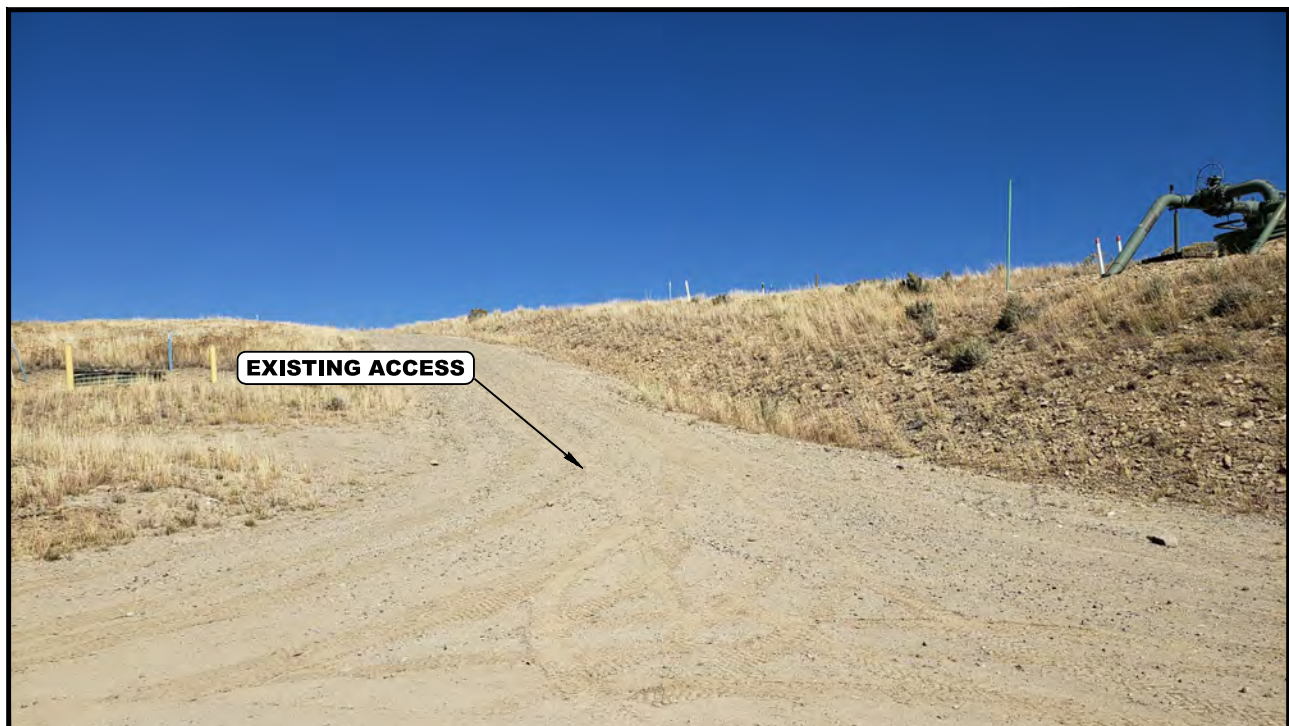
PHOTO: VIEW OF EXISTING ACCESS