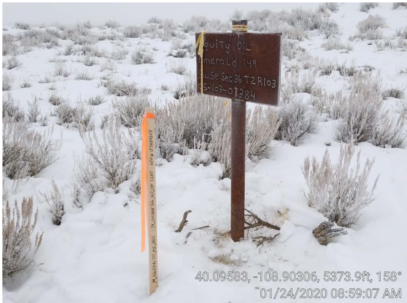
Photo 1. Location.

Emerald 149 API: 05-103-07384 Inspection: 679707078