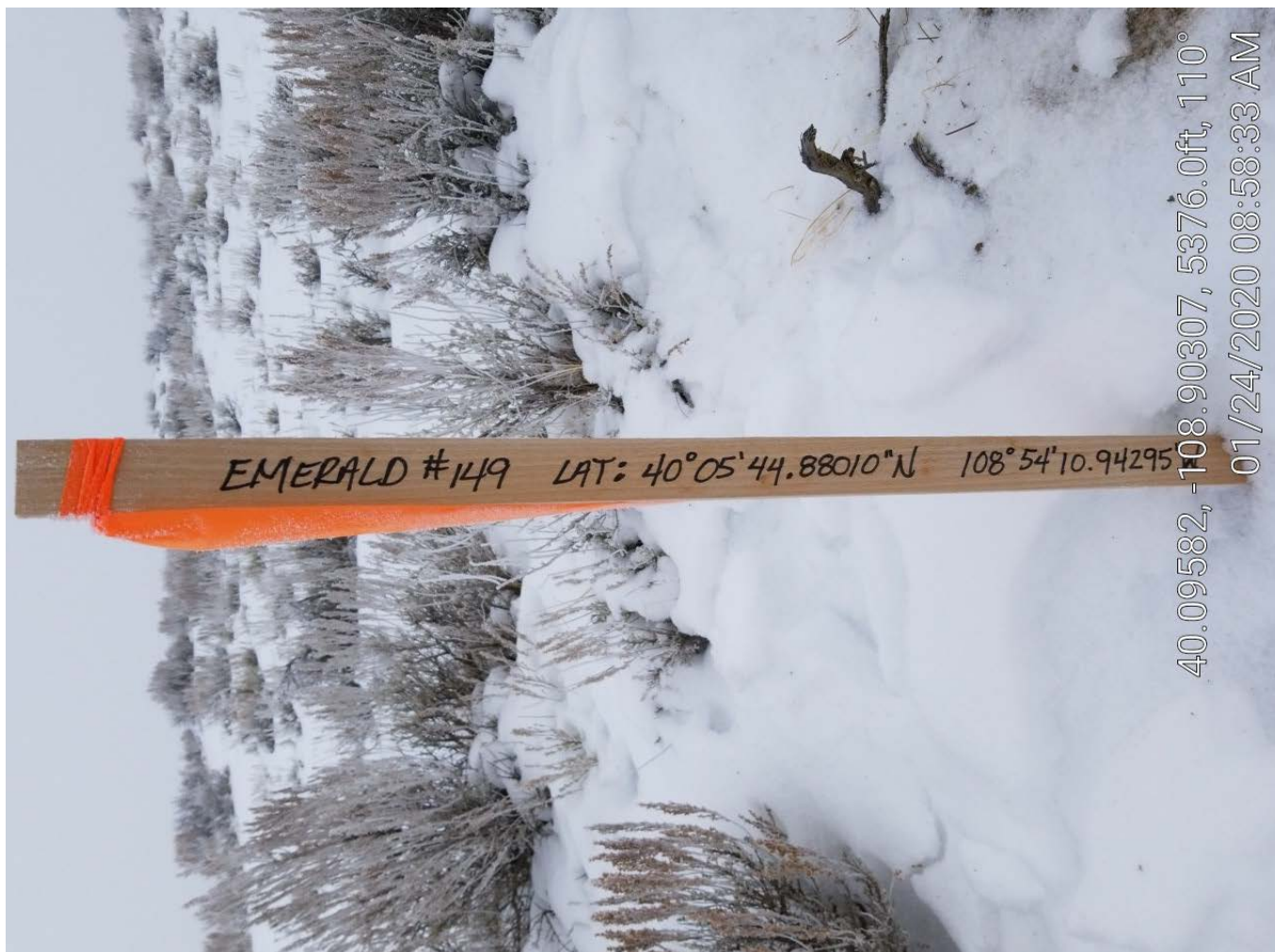
Photo 3. Survey marker. 40.09580003, -108.90303971

Emerald 149 API: 05-103-07384 Inspection: 679707078