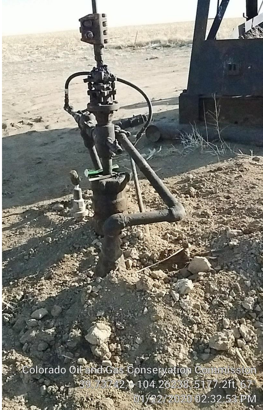
Bradenhead is plumbed to surface.