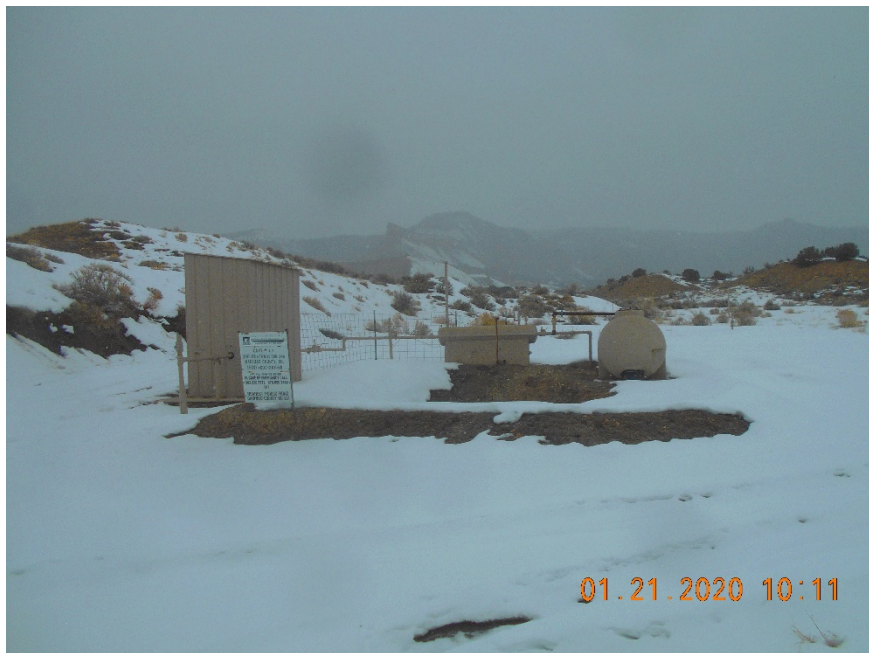
Location overview looking S. Meter housing with sign, Separator, Produce water tank and pit.