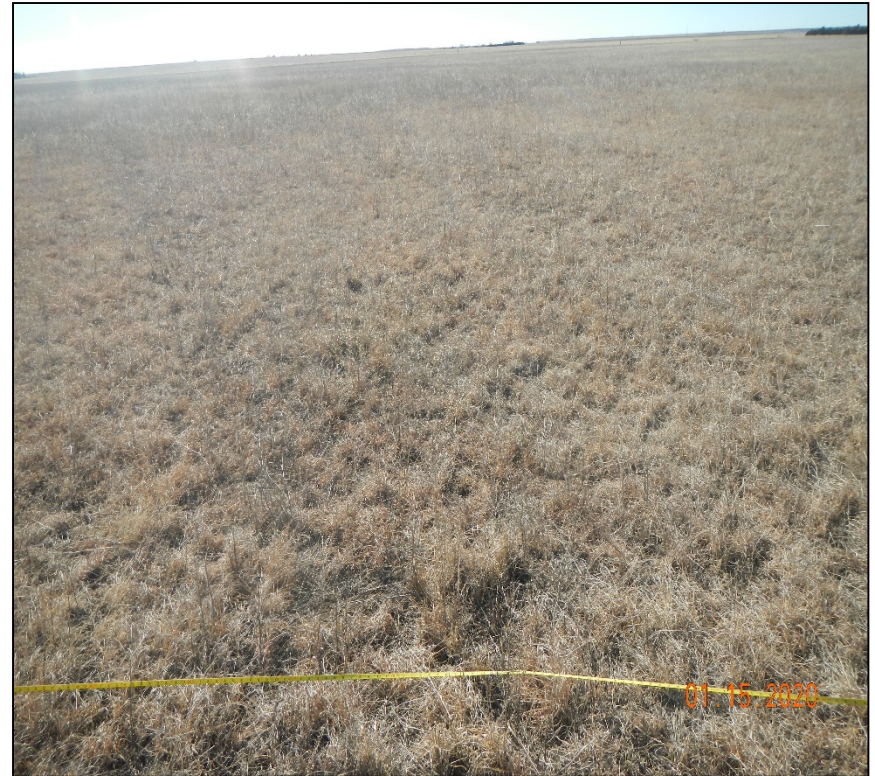
Photo 14. Facing southwest along the transect at the undisturbed reference site. Vegetation in the undisturbed reference is CRP grassland consisting of Sideoats grama and Sand dropseed.