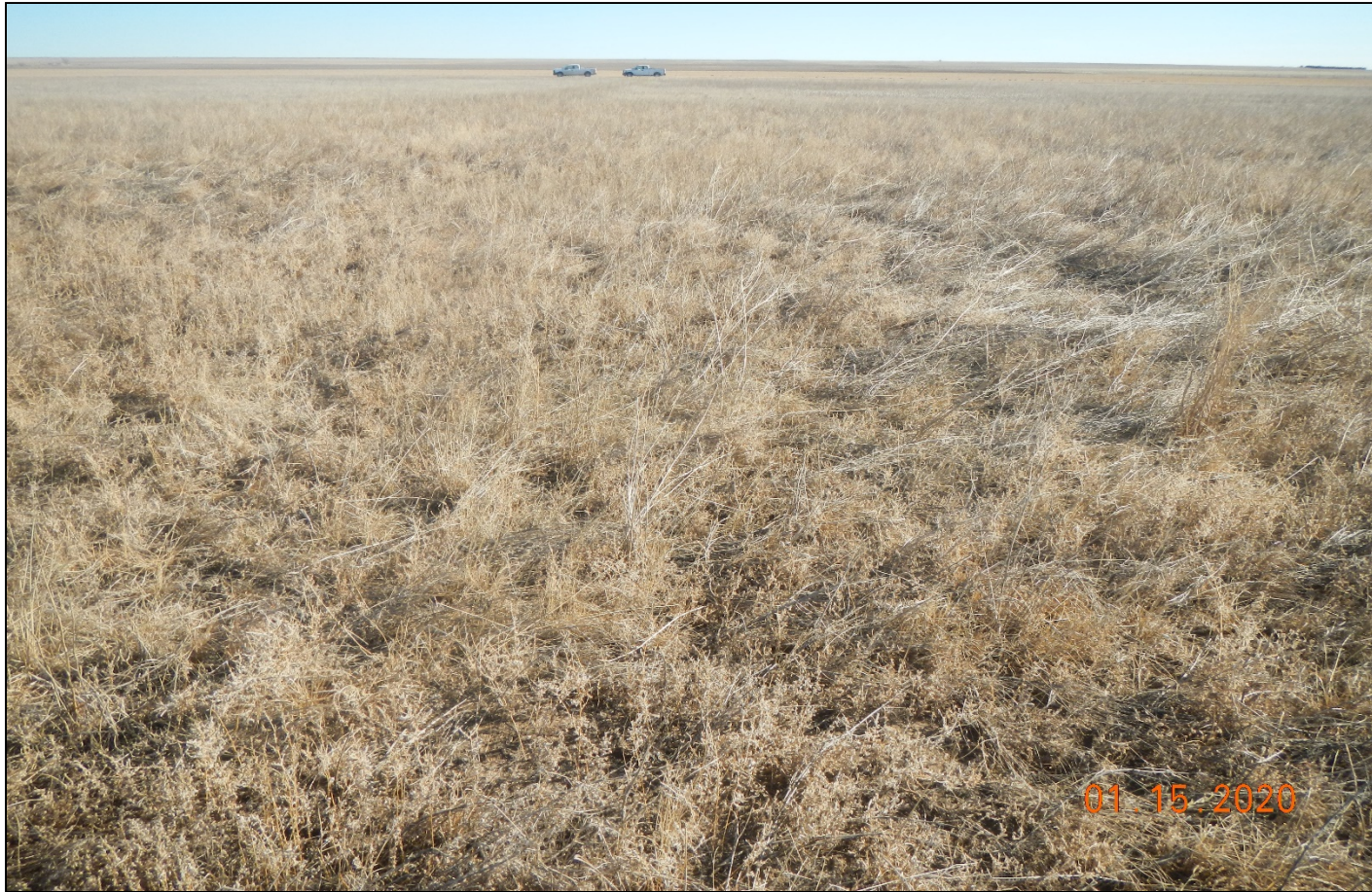
Photo 4. Center of the location facing east.