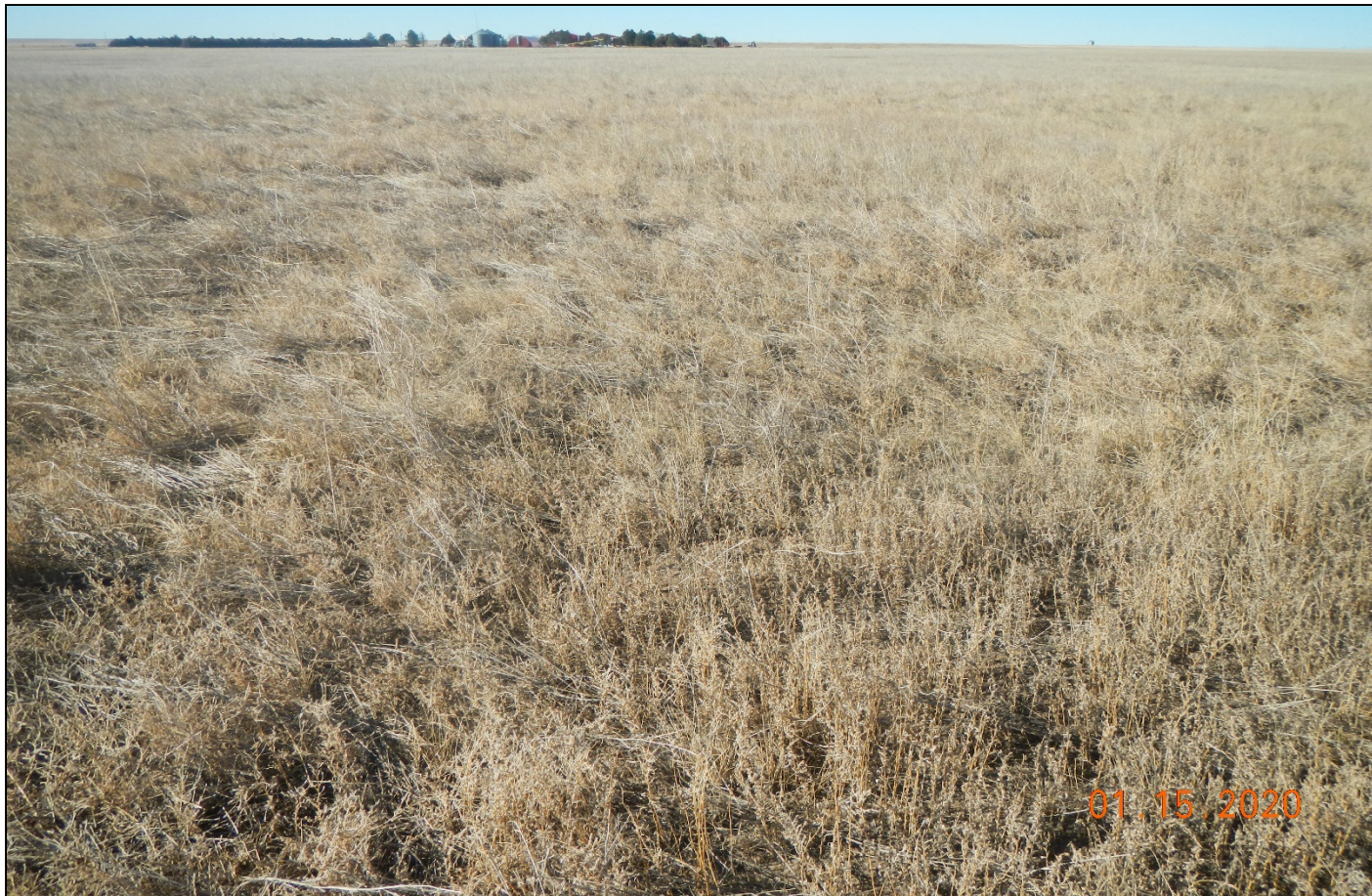
Photo 2. Center of the location facing west.