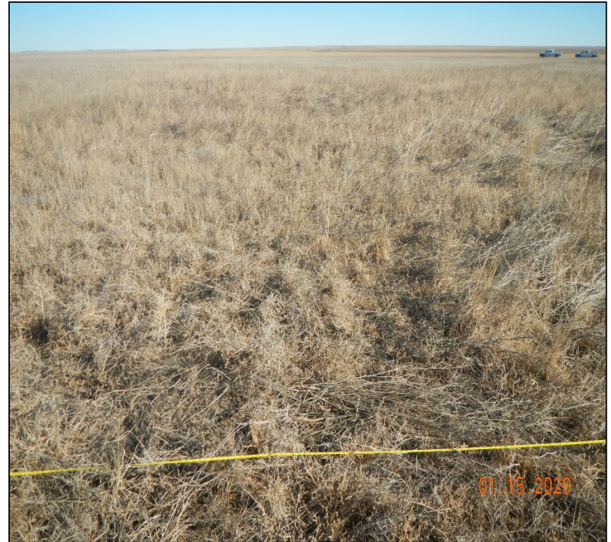
Photo 10. Facing northeast along the transect at the disturbed location. Vegetation at the location is predominately weed cover consisting of Kochia and Russian thistle.