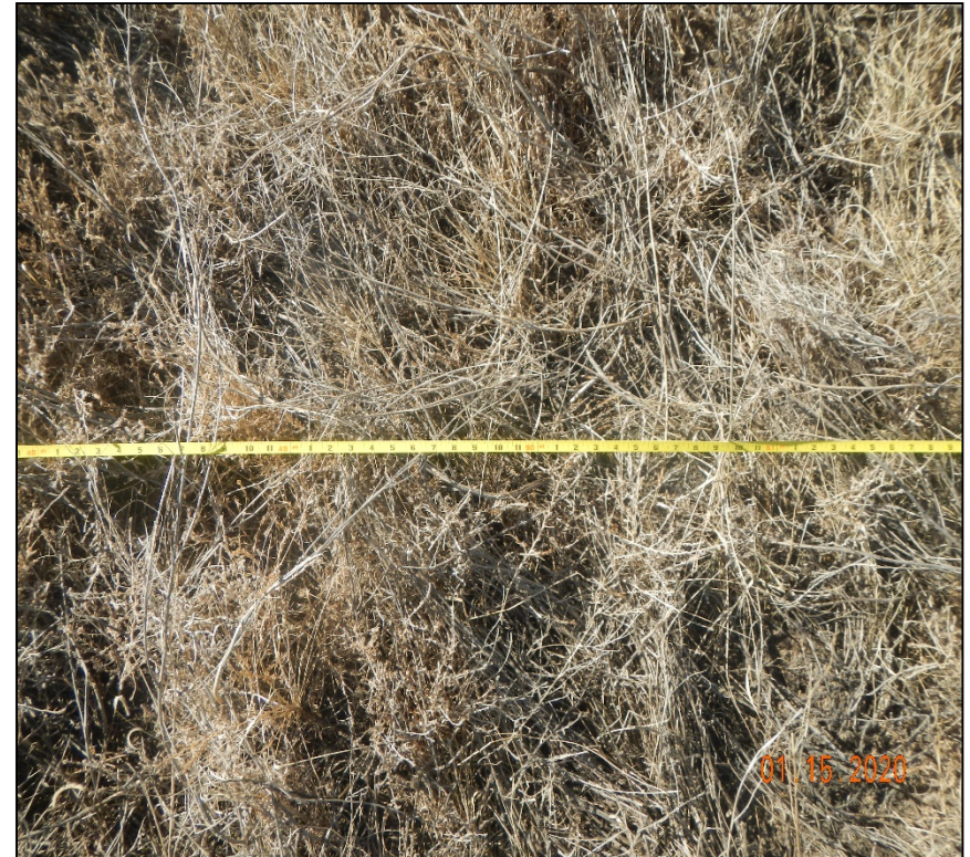
Photo 8. Ground cover at midpoint along the transect at the disturbed location. Vegetation at the location is predominately weed cover consisting of Kochia and Russian thistle.