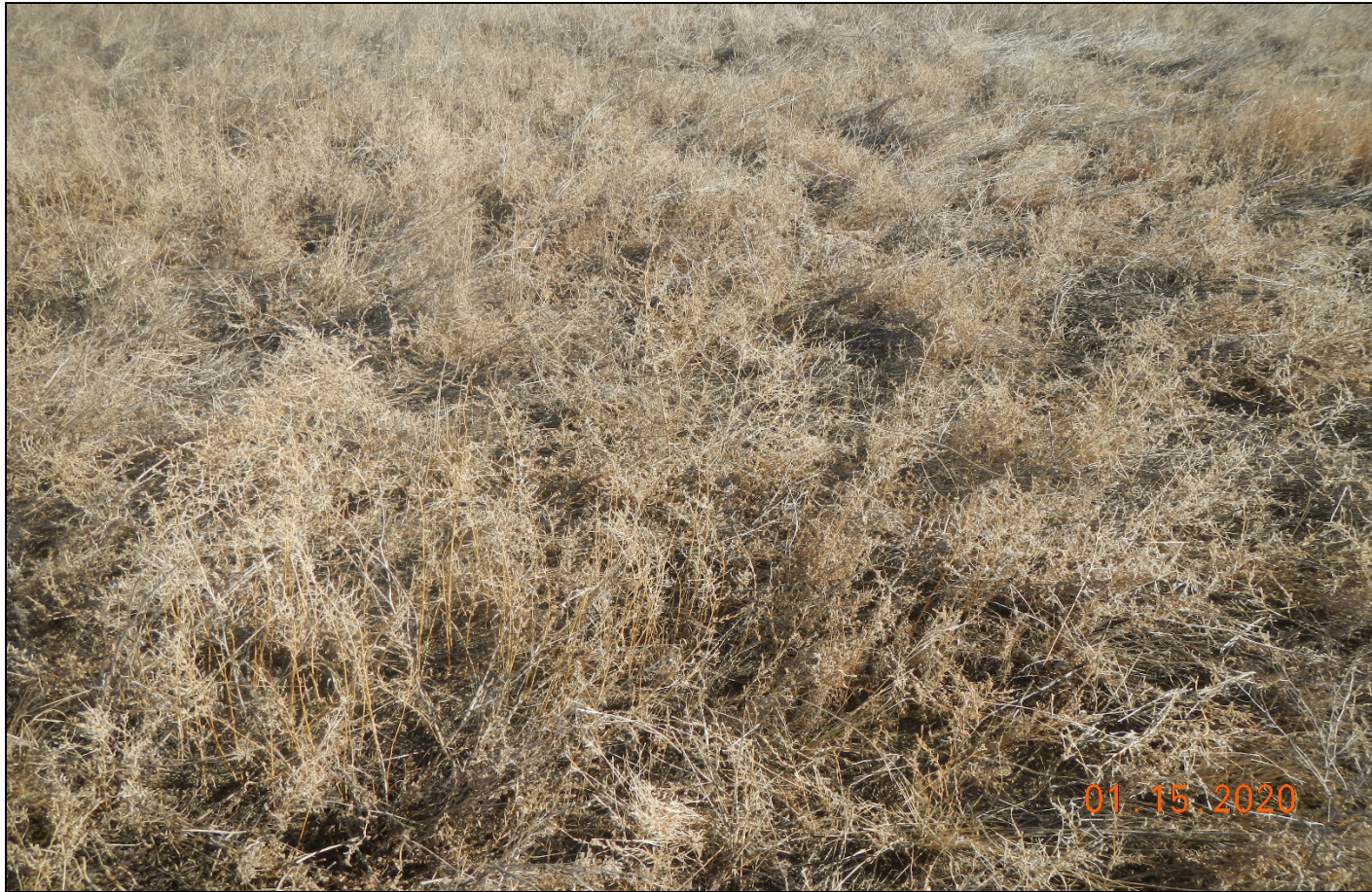
Photo 6. View of groundcover shows predominately undesirable weeds at the location.