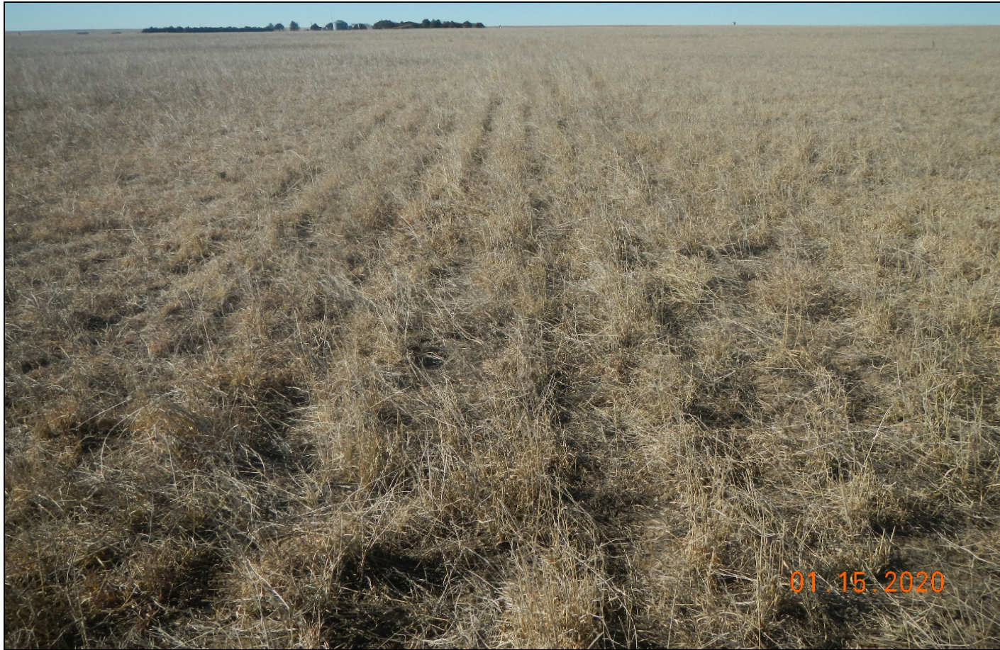
Photo 1. Facing west along the former access road.