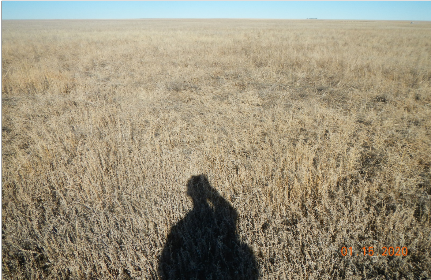
Photo 3. Center of the location facing north.