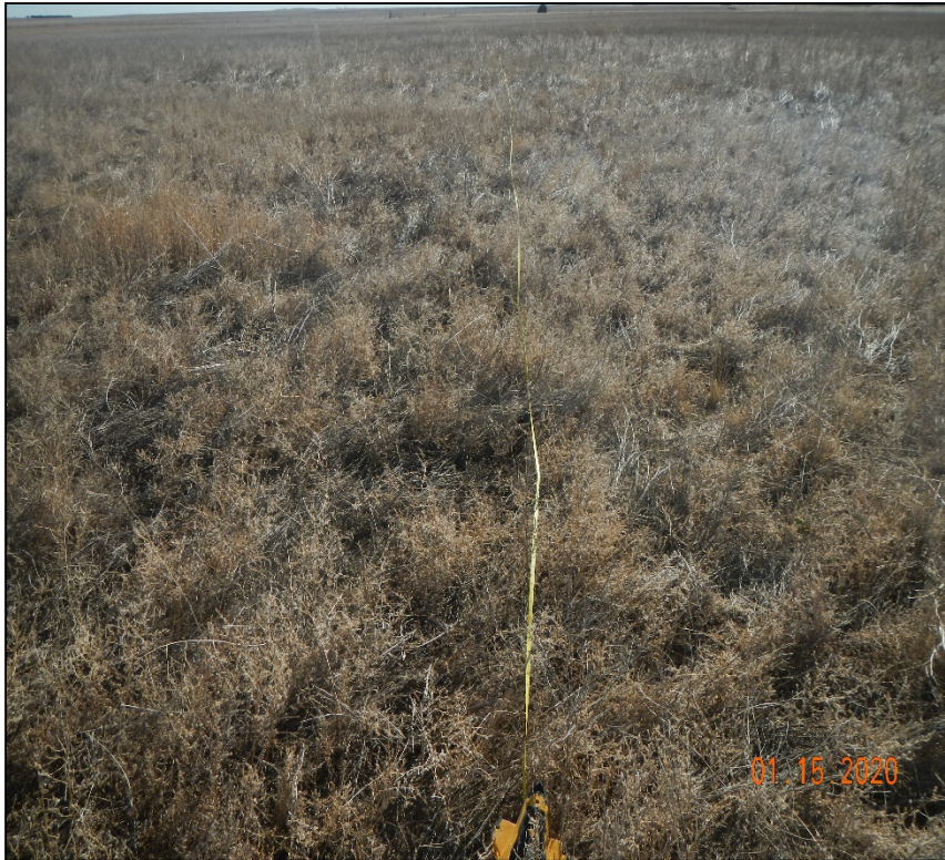
Photo 11. Facing southeast at the end of the transect at the disturbed location. Vegetation at the location is predominately weed cover consisting of Kochia and Russian thistle.