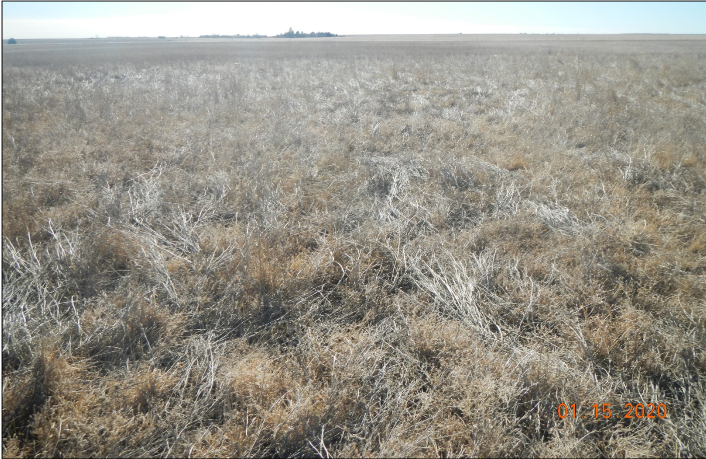
Photo 5. Center of the location facing south.