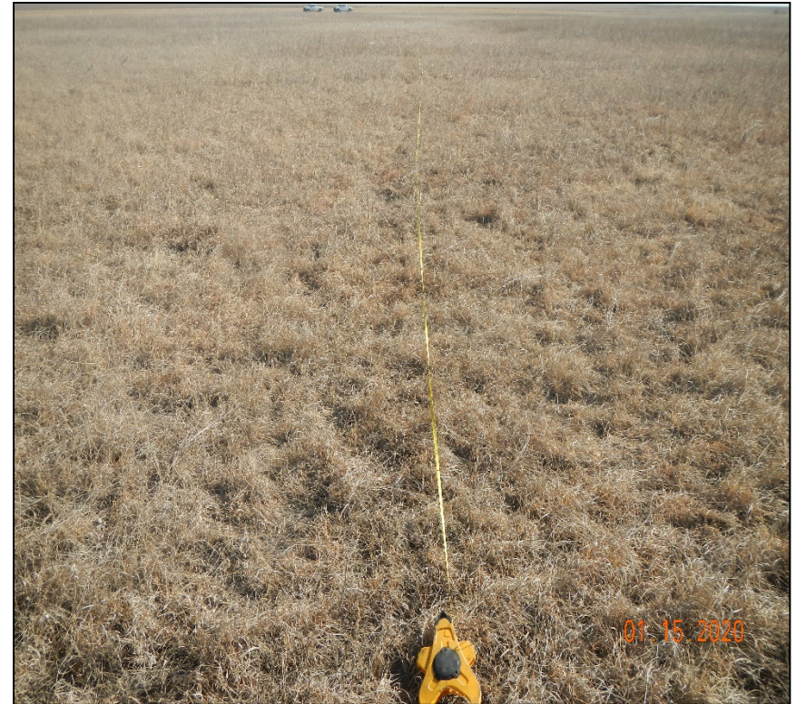
Photo 16. Facing southeast at the end of the transect at the undisturbed reference site. Vegetation in the undisturbed reference is CRP grassland consisting of Sideoats grama and Sand dropseed.