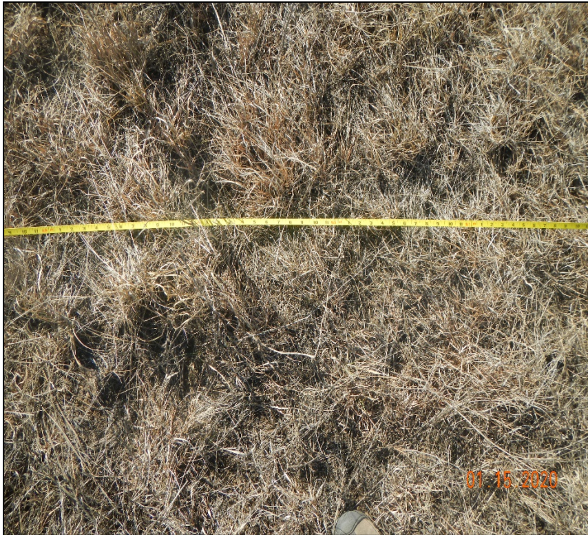
Photo 13. Ground cover at midpoint along the transect at the undisturbed reference site. Vegetation in the undisturbed reference is CRP grassland consisting of Sideoats grama and Sand dropseed.