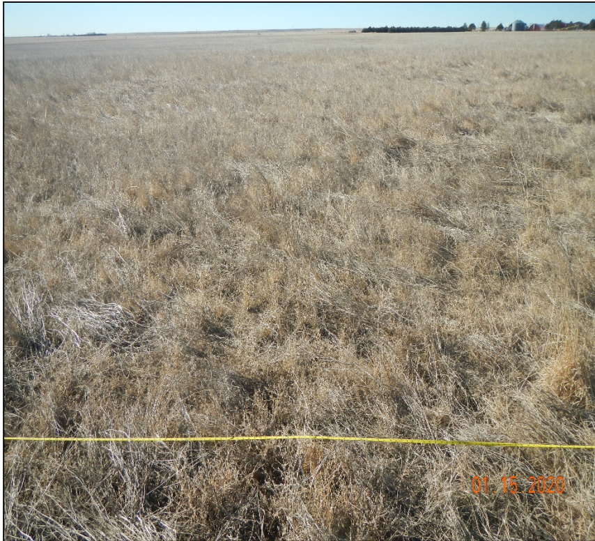
Photo 9. Facing southwest along the transect at the disturbed location. Vegetation at the location is predominately weed cover consisting of Kochia and Russian thistle.