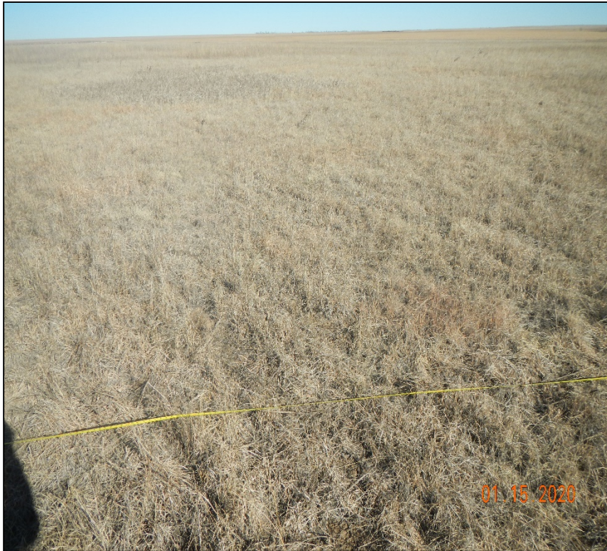
Photo 15. Facing northeast along the transect at the undisturbed reference site. Vegetation in the undisturbed reference is CRP grassland consisting of Sideoats grama and Sand dropseed.