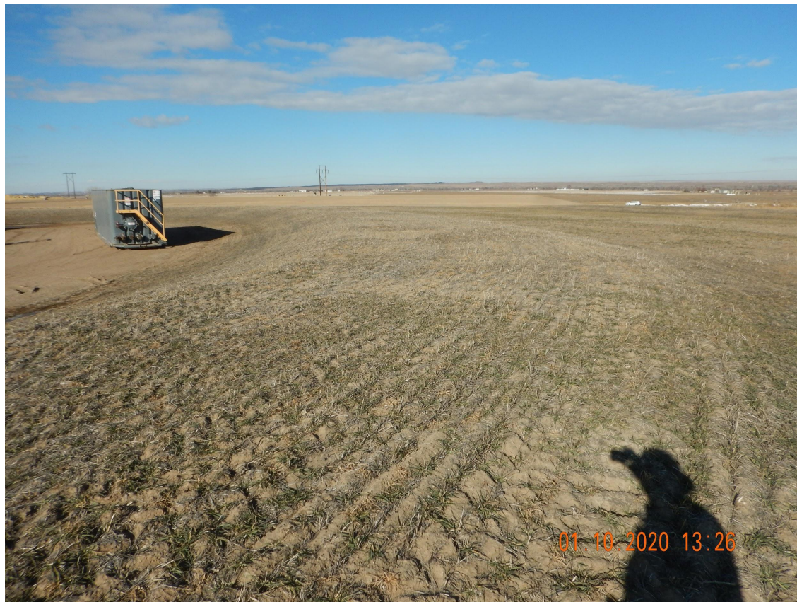
Photo 3. Photo taken from the southeastern interim area, facing North. See comments under Photo 1.