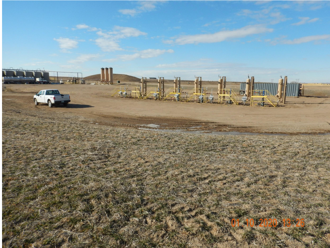
Photo 1. Photo taken from the southeastern interim area, facing Northwest. Photo illustrates Operator has performed interim reclamation to reduce all areas only needed for production operations.

Photo also illustrates germination within the interim area. A follow up vegetative inspection will be conducted at a future date.