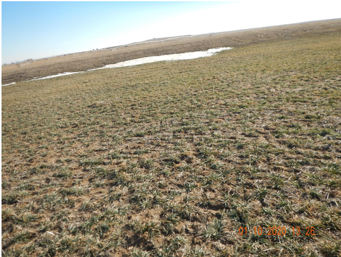
Photo 4. Photo taken from the southeastern interim area, facing Southeast. See comments under Photo 1.