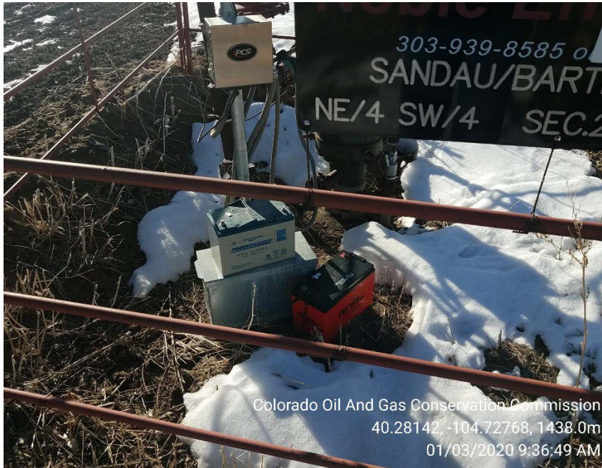
Unused equipment on 1/3/20