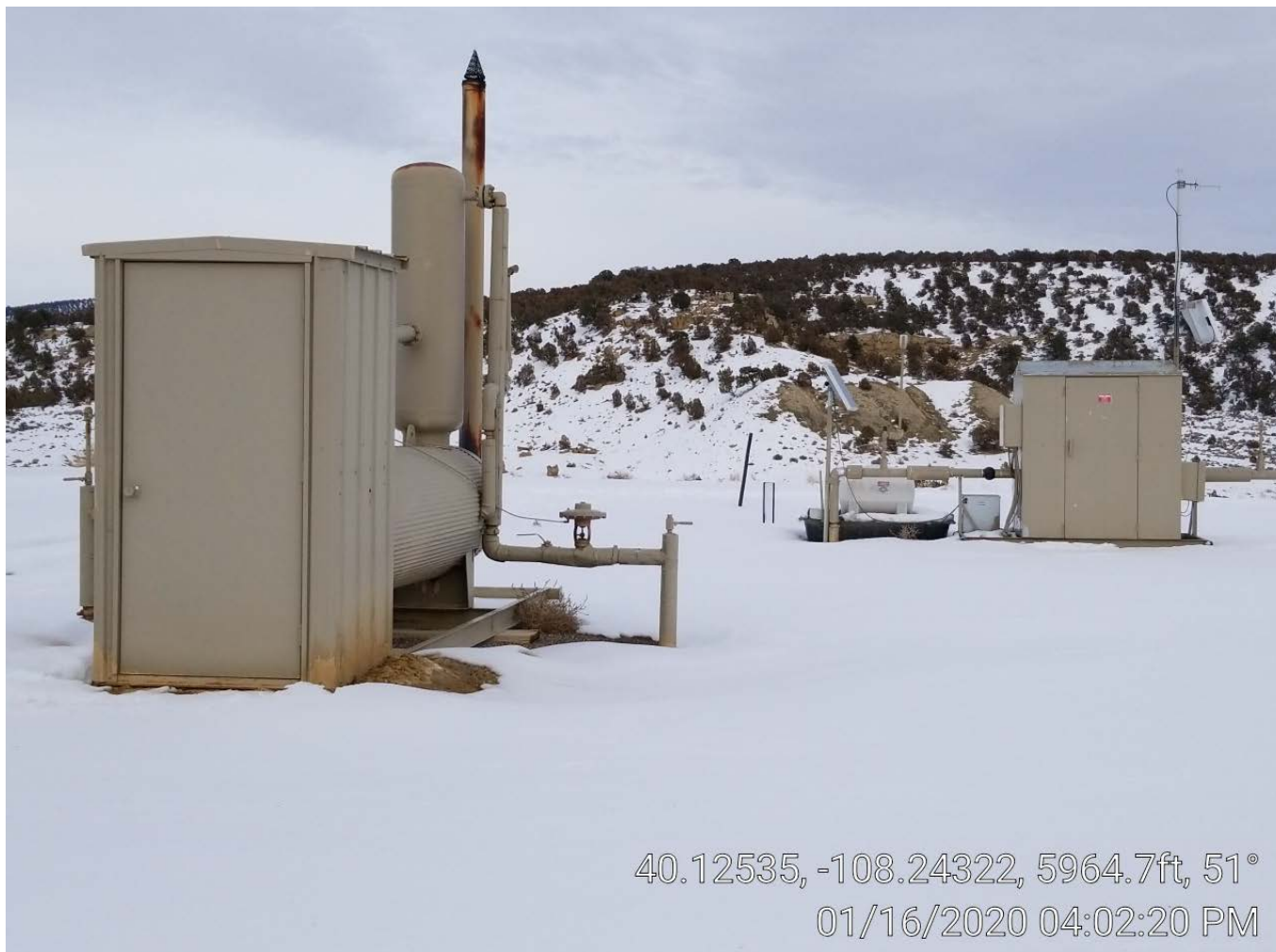
Photo 3. Separator & meter building.

WRD Federal 2-33 API: 05-103-10998 Inspection: 679707019