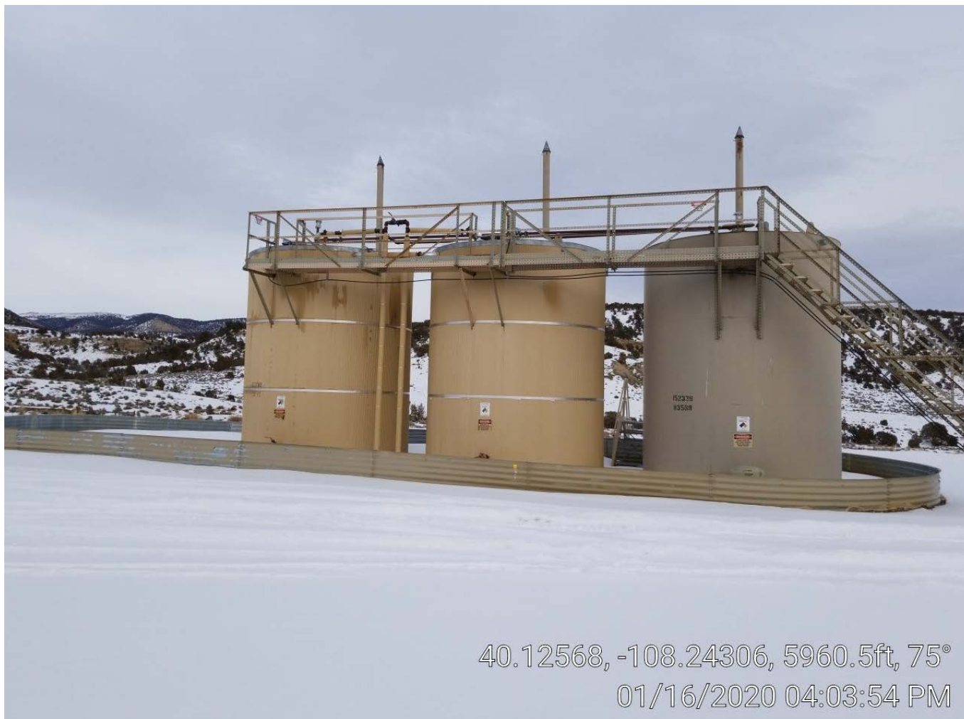
Photo 4. Tank battery.

WRD Federal 2-33 API: 05-103-10998 Inspection: 679707019