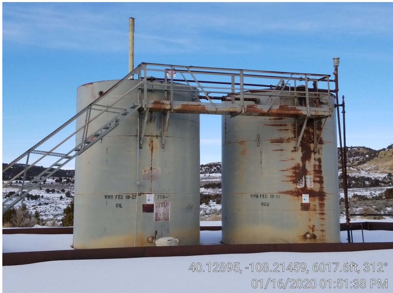
Photo 4. Tank battery.