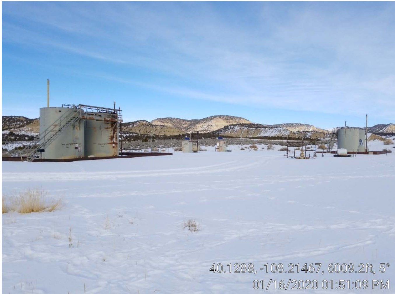
Photo 1. Location.