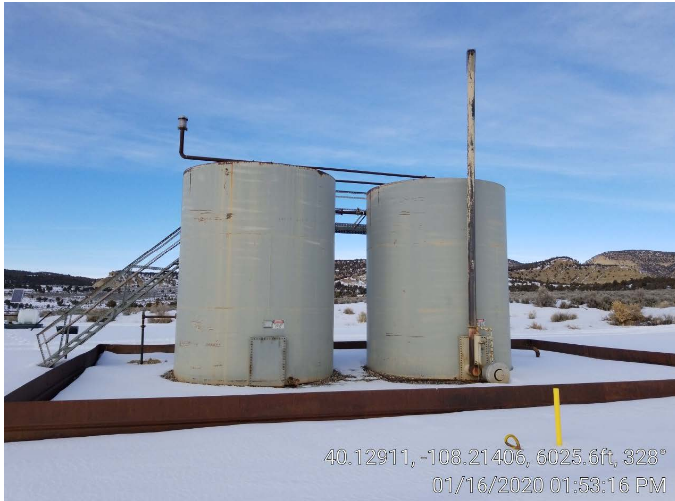
Photo 5. Tank battery.

WRD Federal 19-21, Ant Hill Unit 19-22 API: 05-103-10041, 10231 Inspection: 679707007