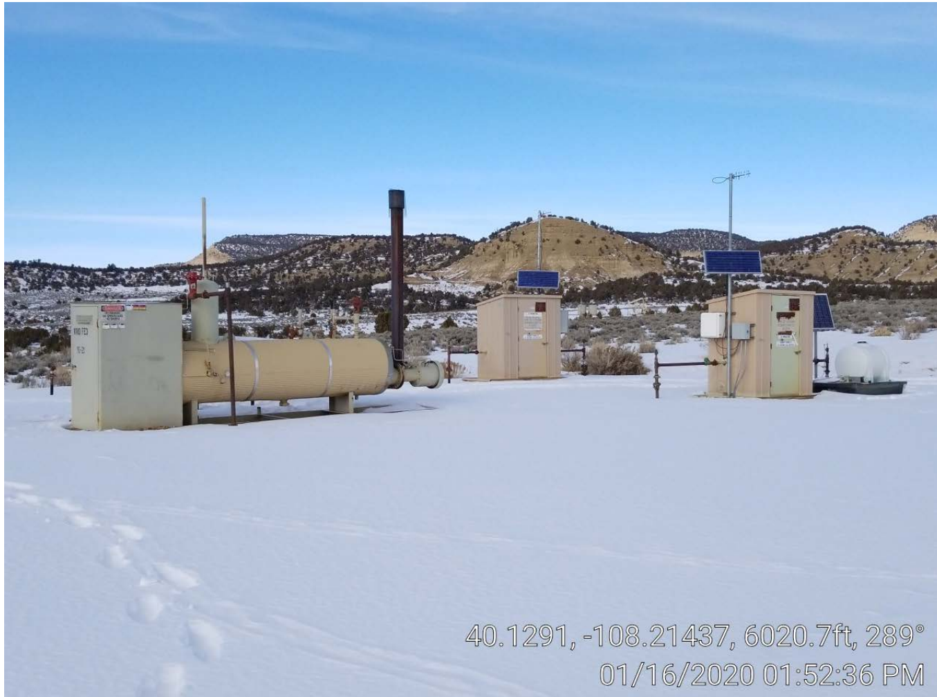
Photo 3. Separator & meter buildings.

WRD Federal 19-21, Ant Hill Unit 19-22 API: 05-103-10041, 10231 Inspection: 679707007